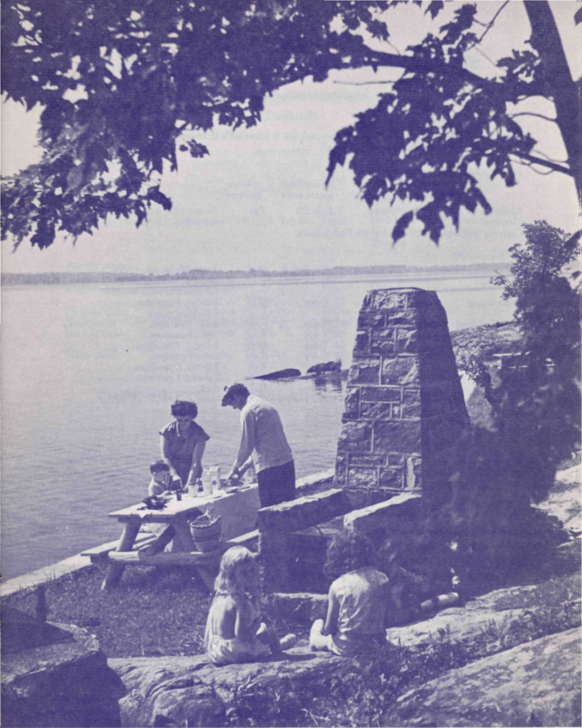
Picnic and camping facilities in the National Parks of Canada are among the finest in North America, shown is a picnic site in the St. Lawrence Islands Park, Ontario.