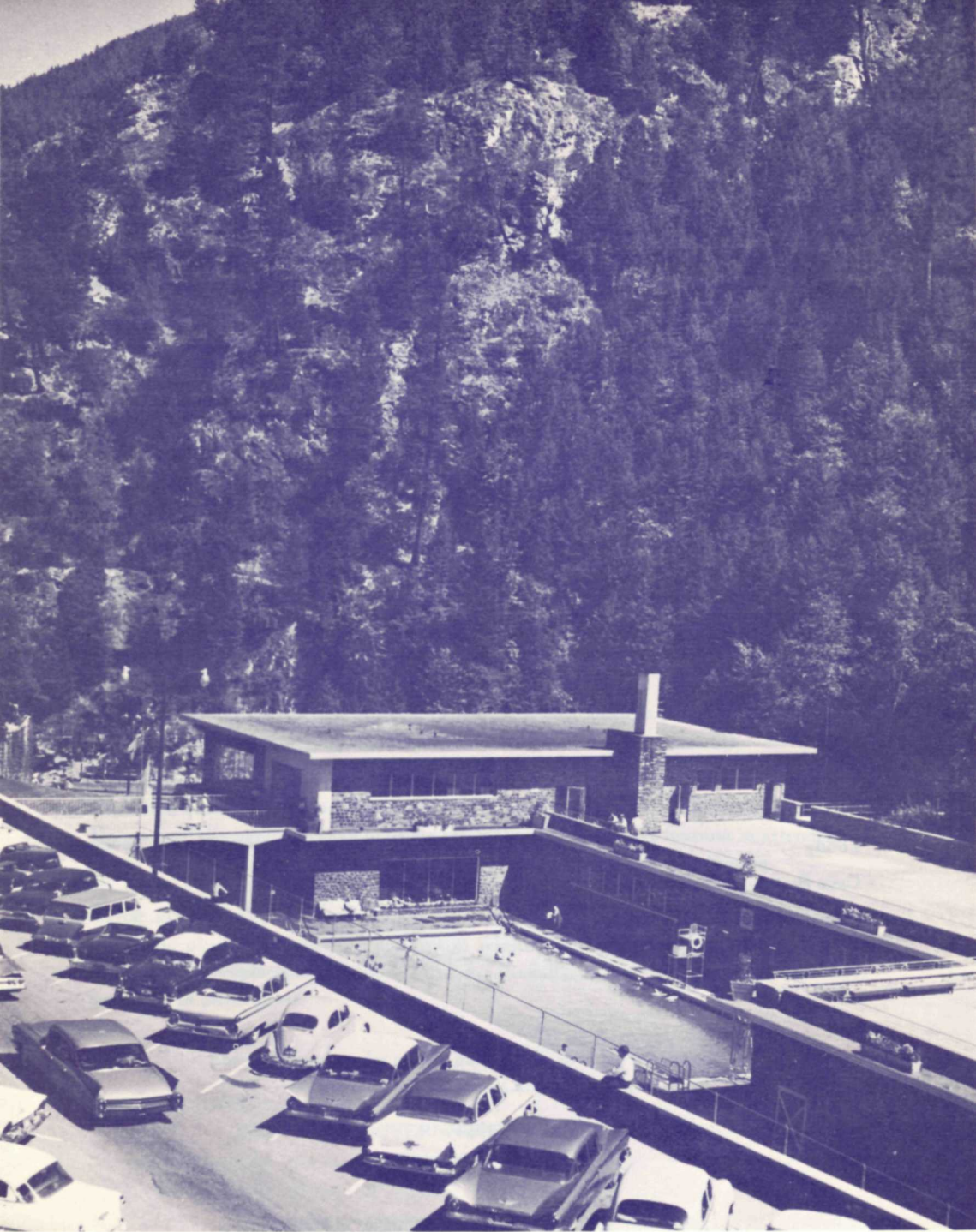
Canada's National Parks offer a wide choice of recreational facilities near to accommodation, like Radium Hot Springs, Kootenay National Park, British Columbia.