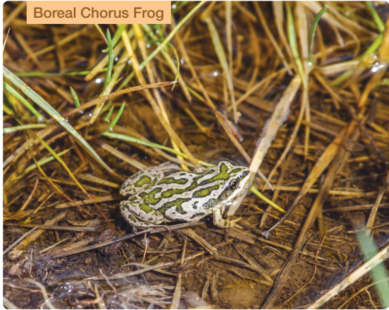
Boreal Chorus Frog