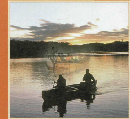
Contemporary canoeists, Ontario

The story of how our country became what it is today is told through the national historic sites, national parks and national marine conservation areas of Canada. Parks Canada works to protect and present our natural and cultural heritage so that it may continue to be enjoyed by present and future generations of Canadians.