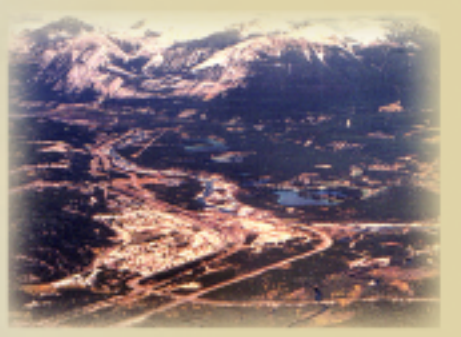
Sharing the valley with wildlife. The town of Jasper in Jasper National Park.

It's becoming harder for bears to avoid bumping into people even in our parks. These protected areas are an important part of the remaining habitat for black and grizzly bears in North America.