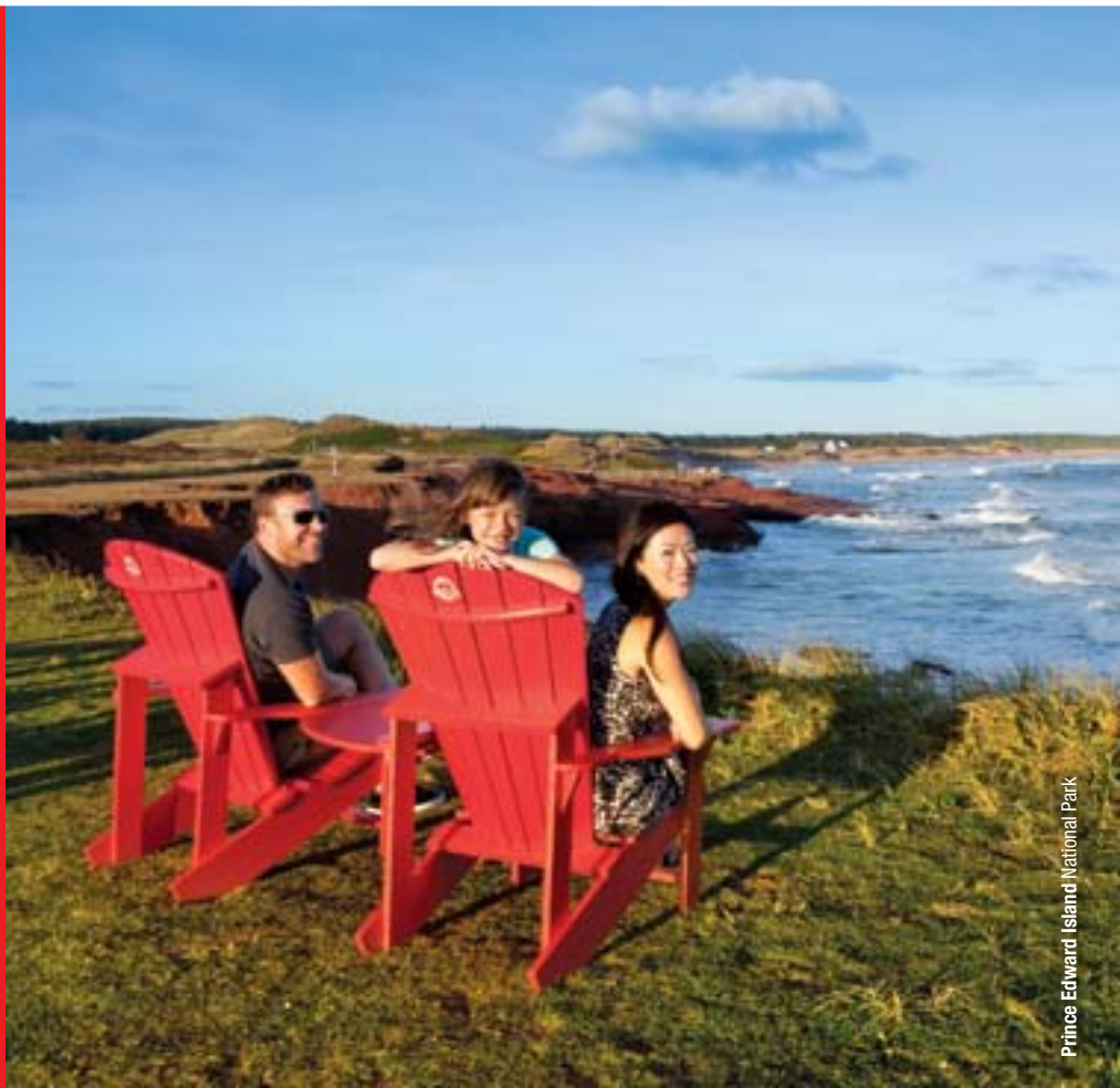
Prince Edward Island National Park