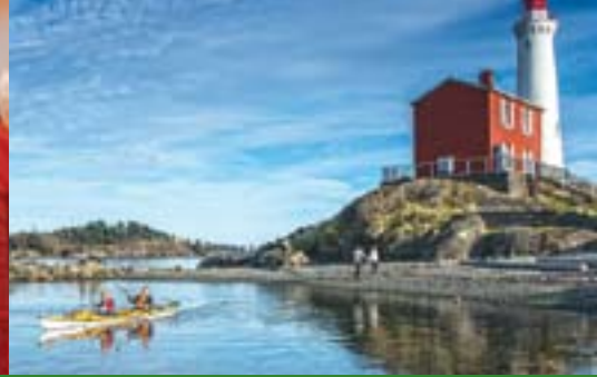
Fort Rodd Hill and Fisgard Lighthouse