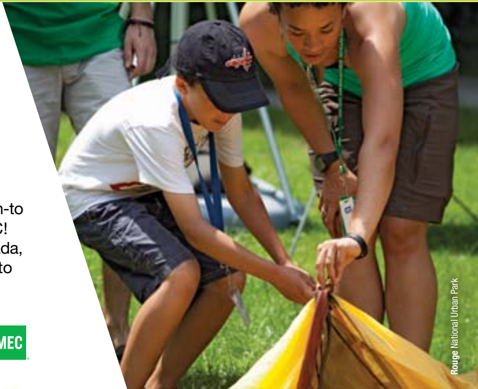
Rouge National Urban Park