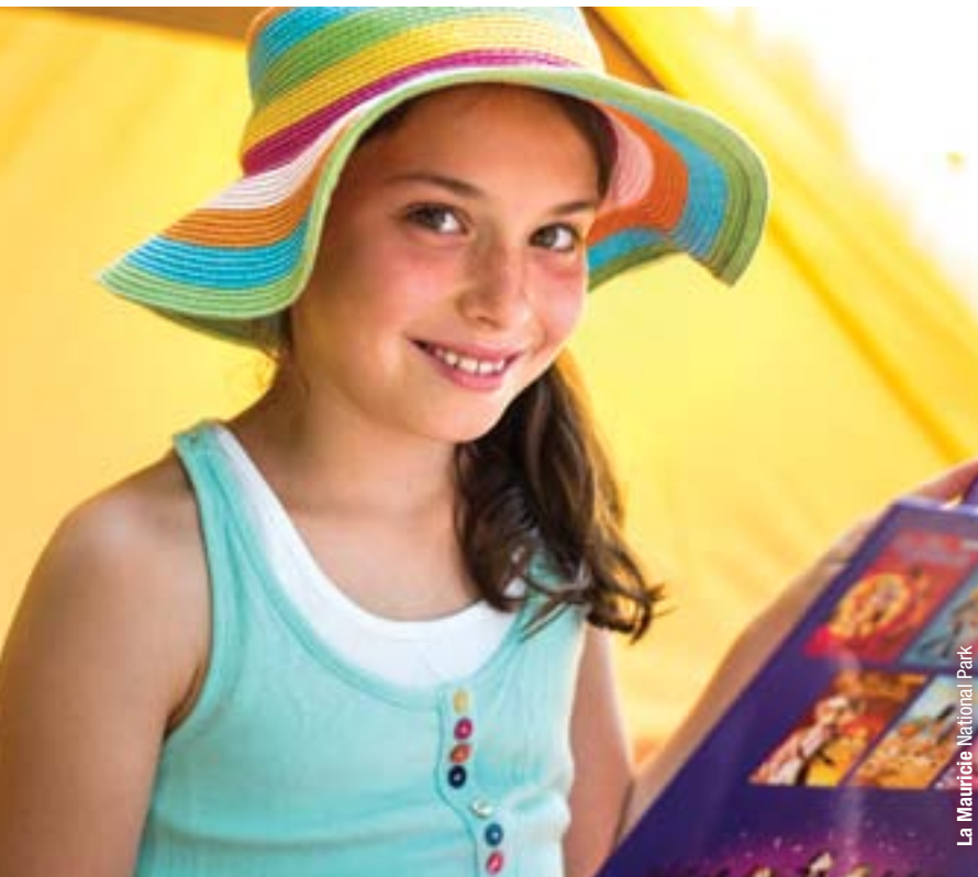
La Mauricie National Park