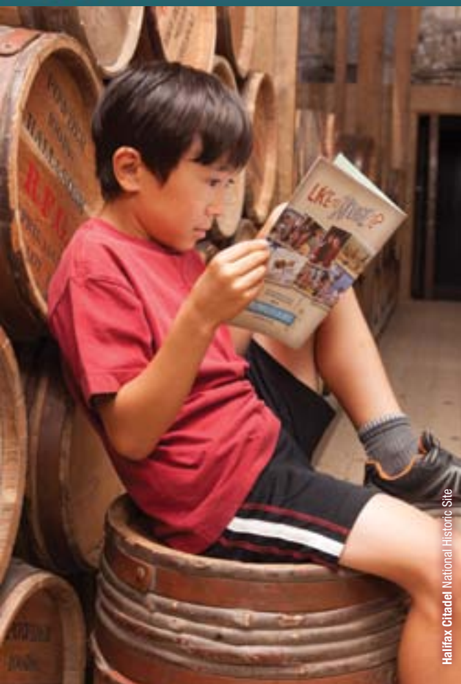
Halifax Citadel National Historic Site