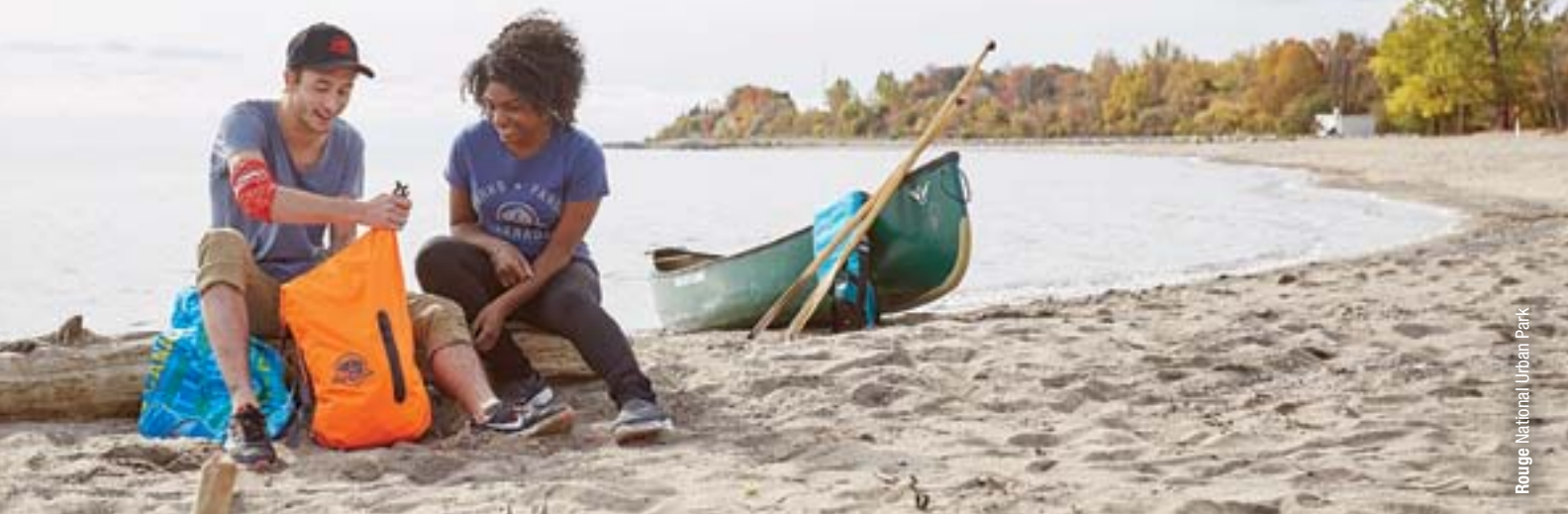
Rouge National Urban Park

Every purchase supports national parks, historic sites and marine conservation areas.