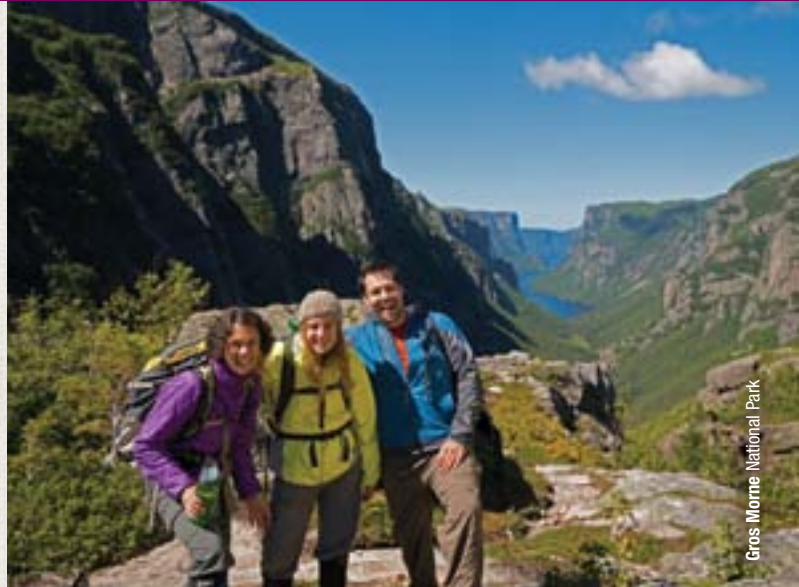
Gros Morne National Park