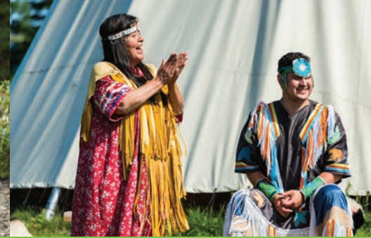
Kouchibouguac National Park