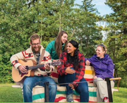
Elk Island National Park