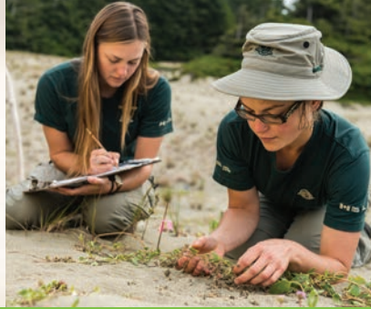
Pacific Rim National Park Reserve