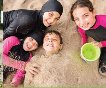
Pukaskwa National Park