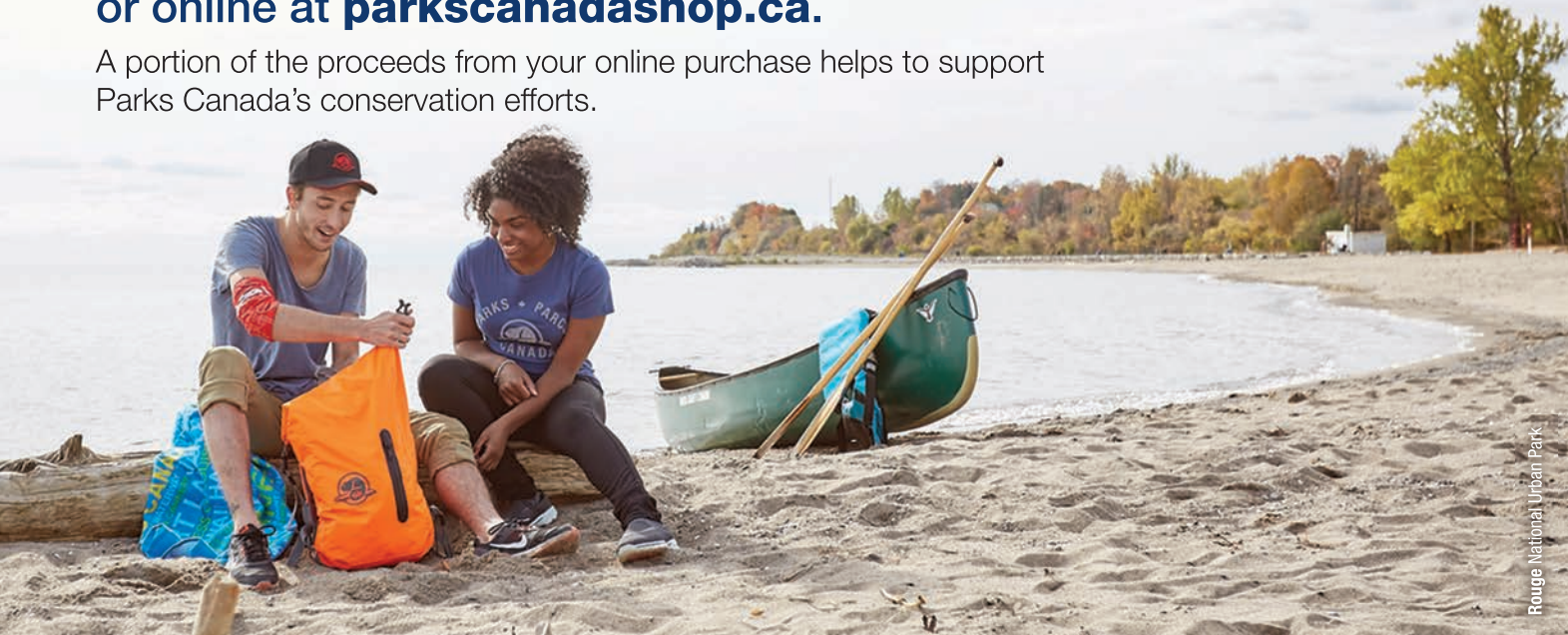
Rouge National Urban Park

A portion of the proceeds from your online purchase helps to support Parks Canada's conservation efforts.