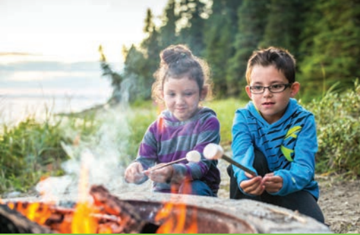
Mingan Archipelago National Park Reserve