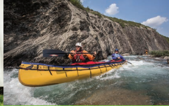
Nááts'ihch'oh National Park Reserve

— National Park — National Historic Site — National Marine Conservation Area — National Urban Park — Other