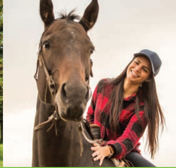
Grasslands National Park