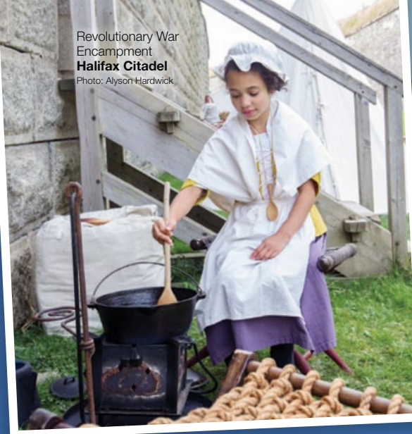
Revolutionary War Encampment Halifax Citadel