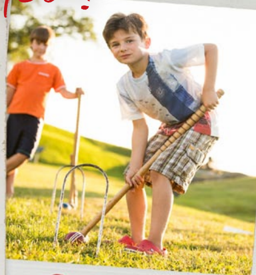
Fort Anne Let's play croquet