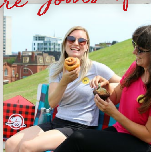
Halifax Citadel Perfect Picnic