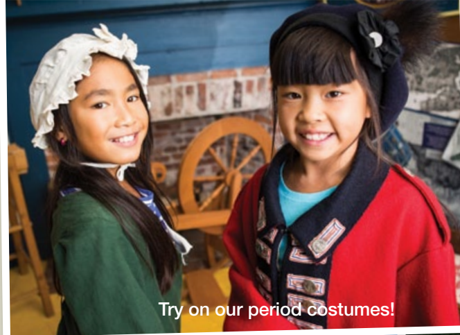
Try on our period costumes!