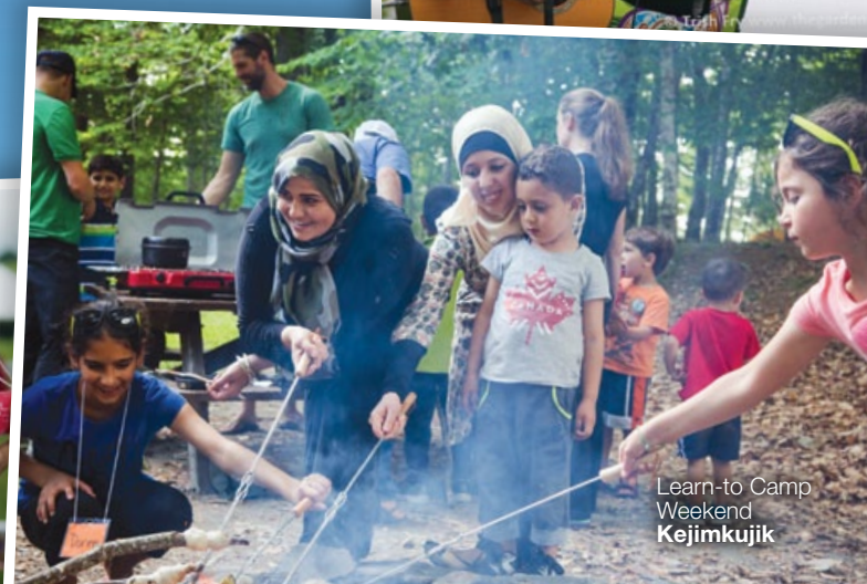
Learn-to Camp Weekend Kejimikujik