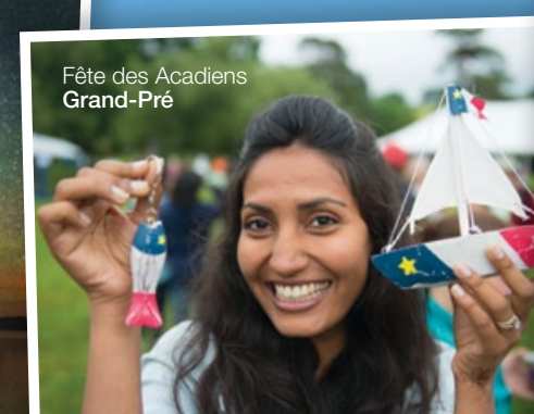
Fête des Acadiens Grand-Pré