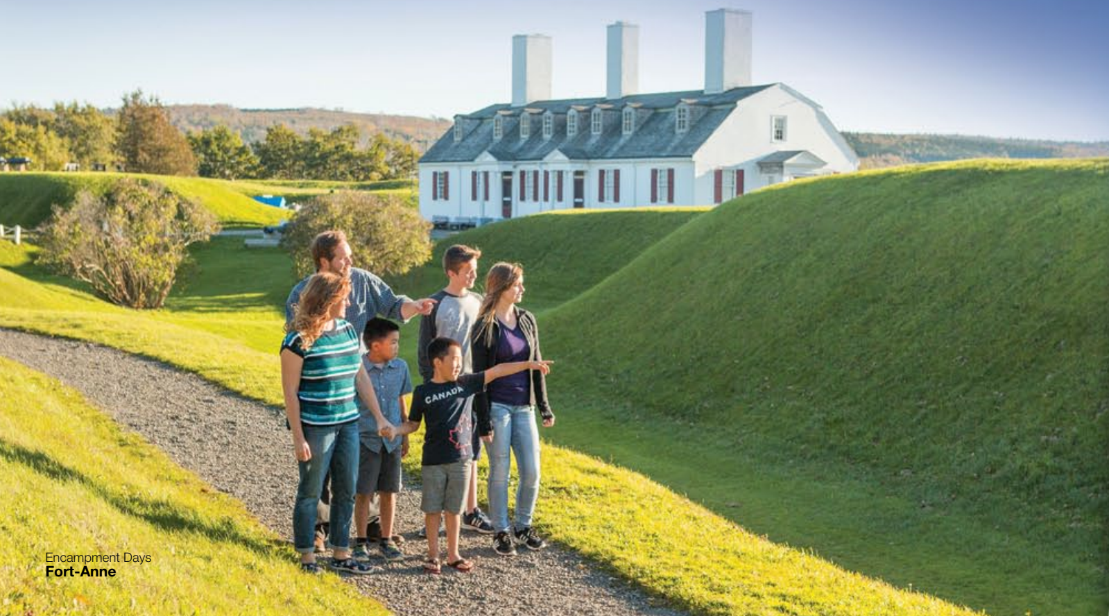
Encampment Days Fort-Anne

30TH ANNUAL VICTORIAN CHRISTMAS Halifax Citadel