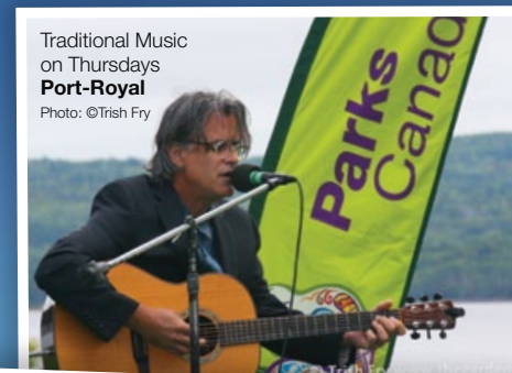
Traditional Music on Thursdays Port-Royal