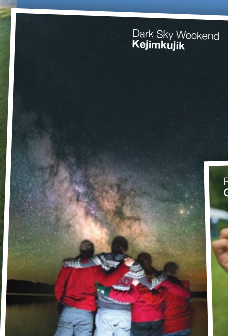
Dark Sky Weekend Kejimikujik