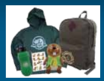
Get the Gear!

Support national parks, marine conservation areas and historic sites. Get your Parks Canada official merchandise and spark memories and pride for your Canada today!