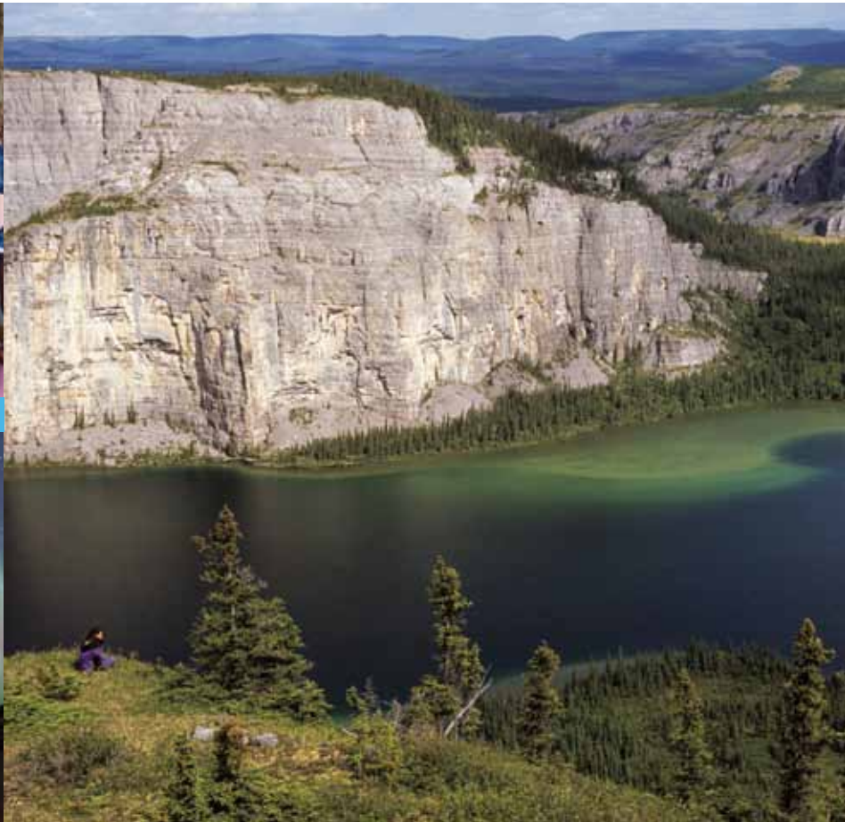
Nahanni National Park Reserve