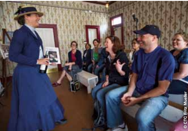
Klondike National Historic Sites