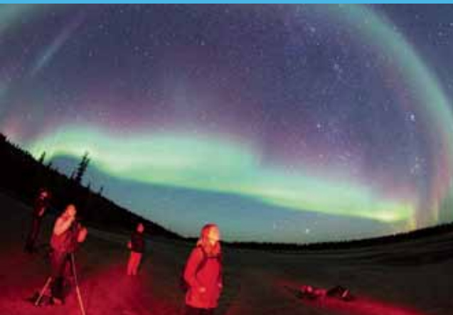
Wood Buffalo National Park