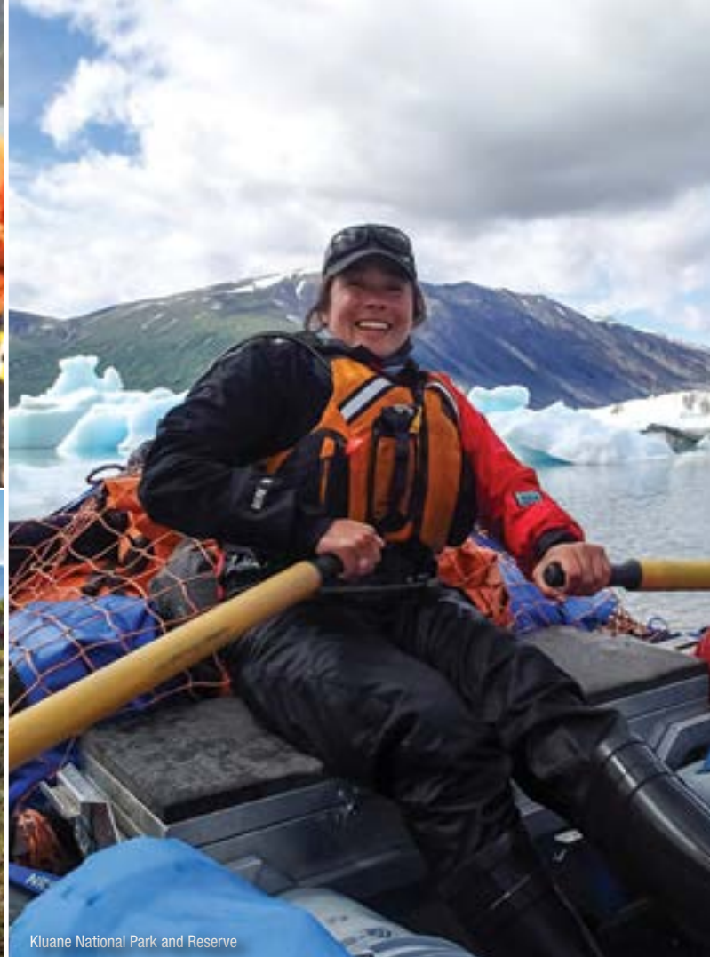
Kluane National Park and Reserve