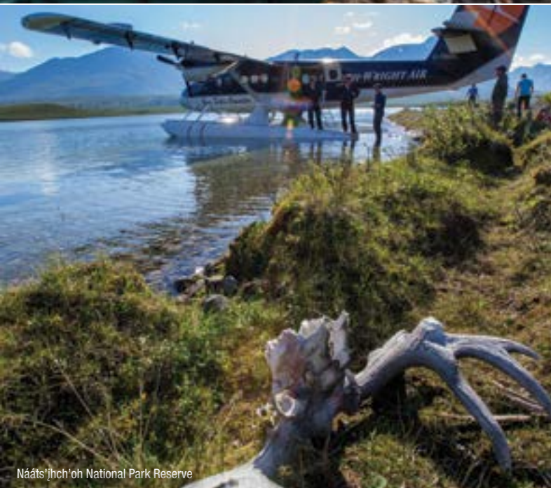
Nááts'íhch'oh National Park Reserve