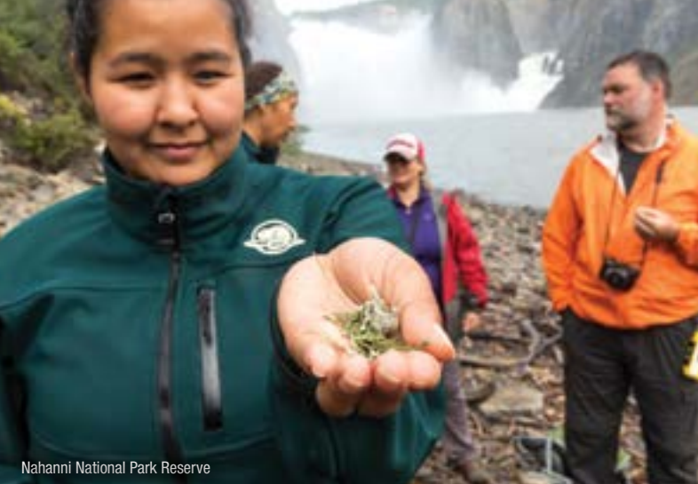
Nahanni National Park Reserve