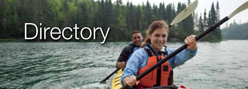
Lake Superior National Marine Conservation Area