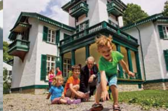
Bellevue House National Historic Site