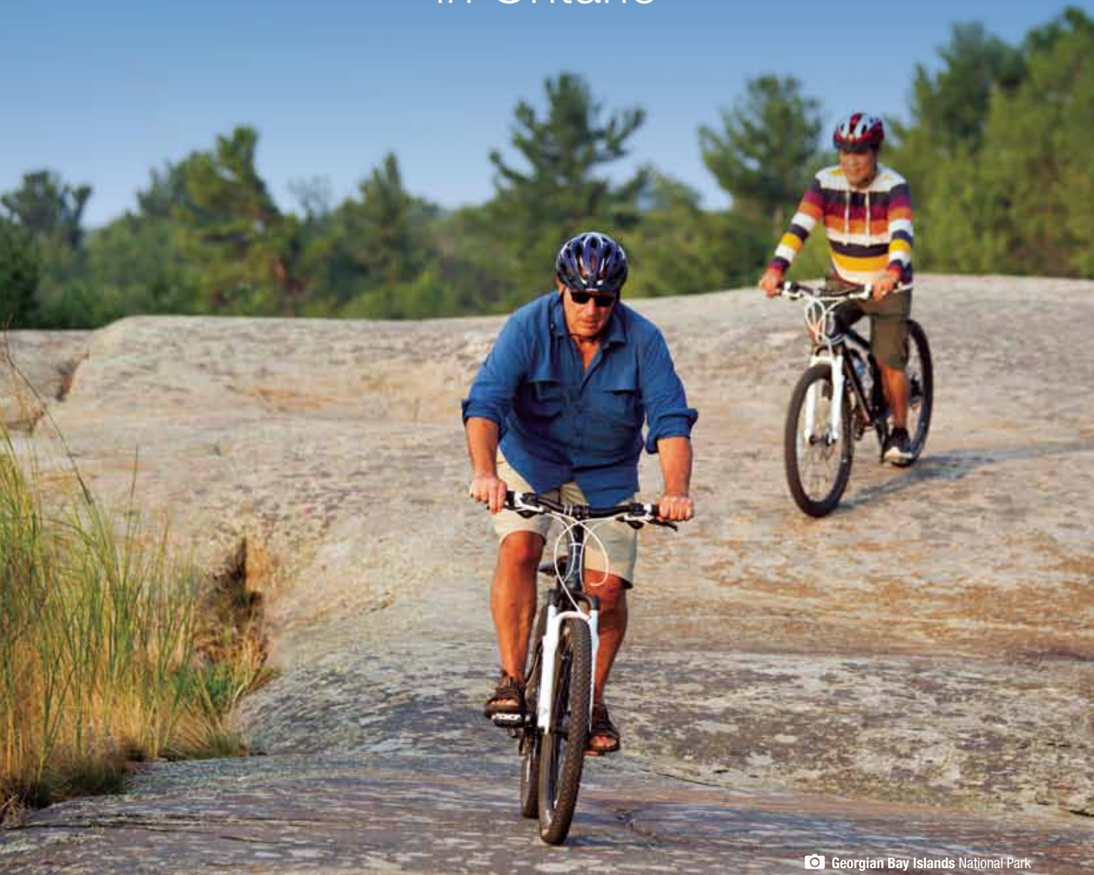
📷 Georgian Bay Islands National Park