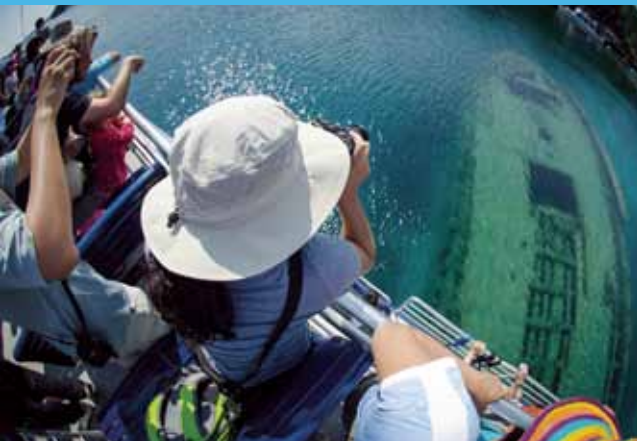
Fathom Five National Marine Conservation Area