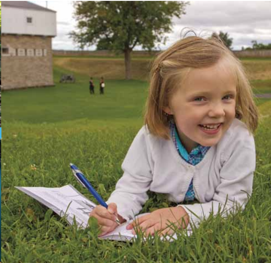
Fort Wellington National Historic Site