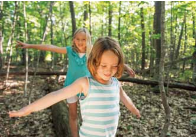
Fort St. Joseph National Historic Site