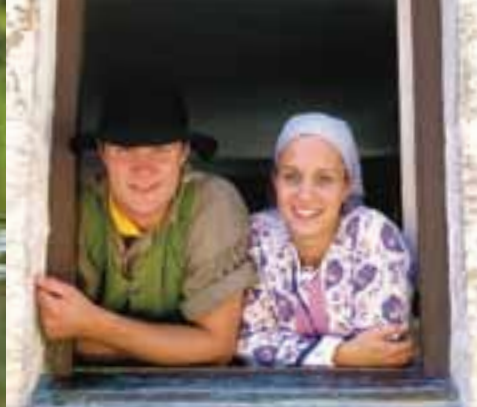
Lower Fort Garry National Historic Site