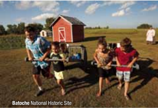
Batoche National Historic Site