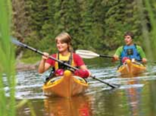
Prince Albert National Park