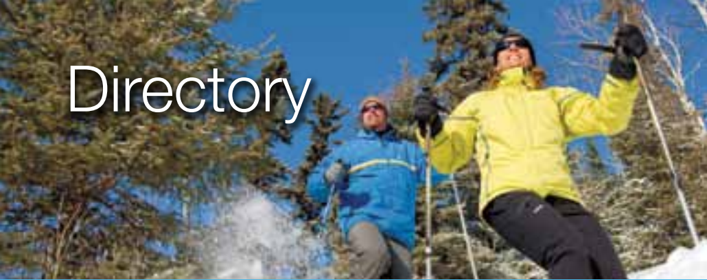
Prince Albert National Park