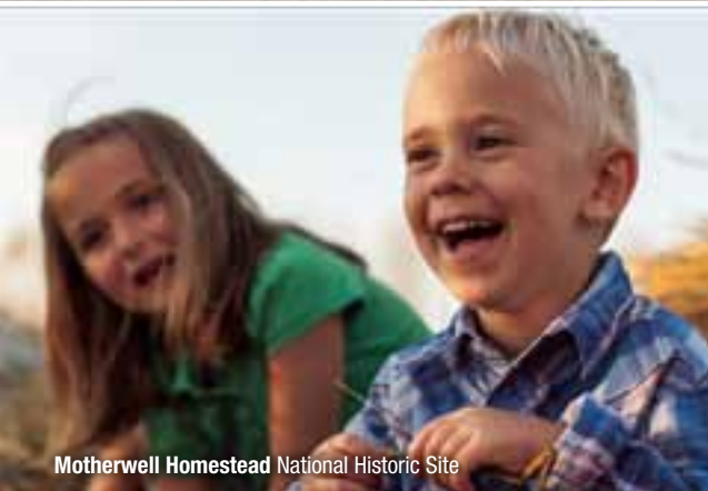
Motherwell Homestead National Historic Site