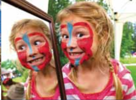
Riding Mountain National Park