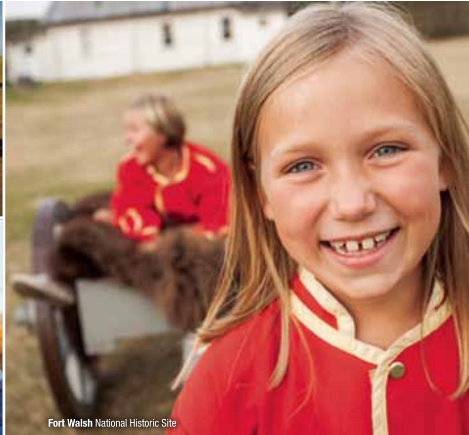
Fort Walsh National Historic Site

■ 1, 2, 3, GO! 2 Fun and exciting activities for the whole family