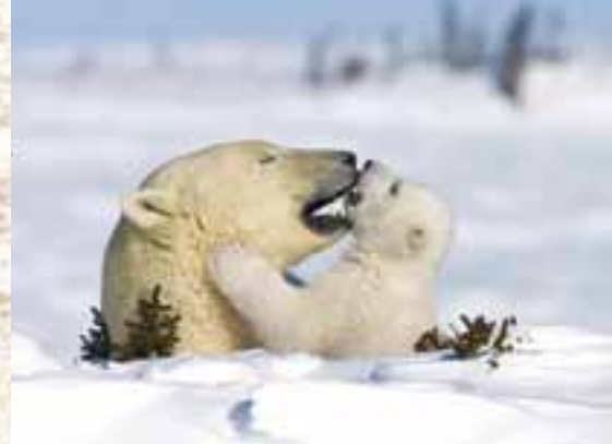
Wapusk National Park