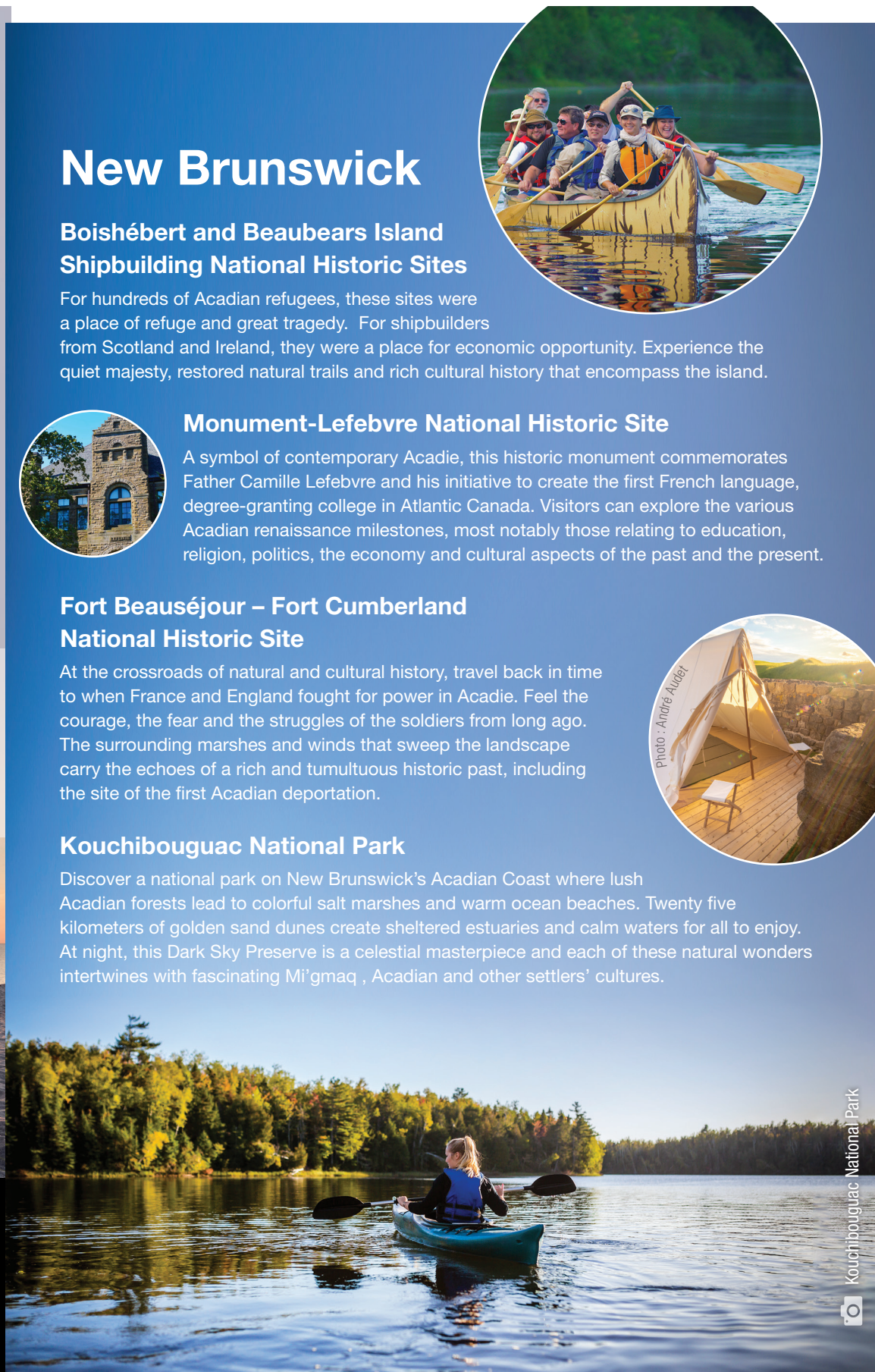
Kouchibouguac National Park