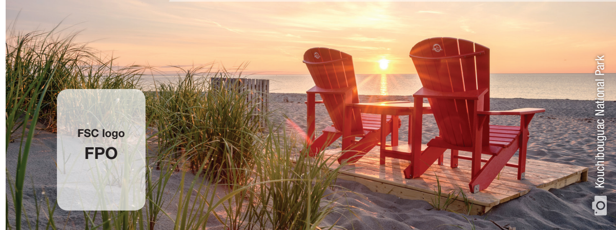
Kouchibouguac National Park

Acadian culture is rich and vibrant. It was built through the years and shaped by sometimes tragic events, showing the strength and resilience of the Acadian people. Today, the Parks Canada Agency protects, honors and shares this rich chapter of Canadian history through several protected places in the Maritime Provinces.