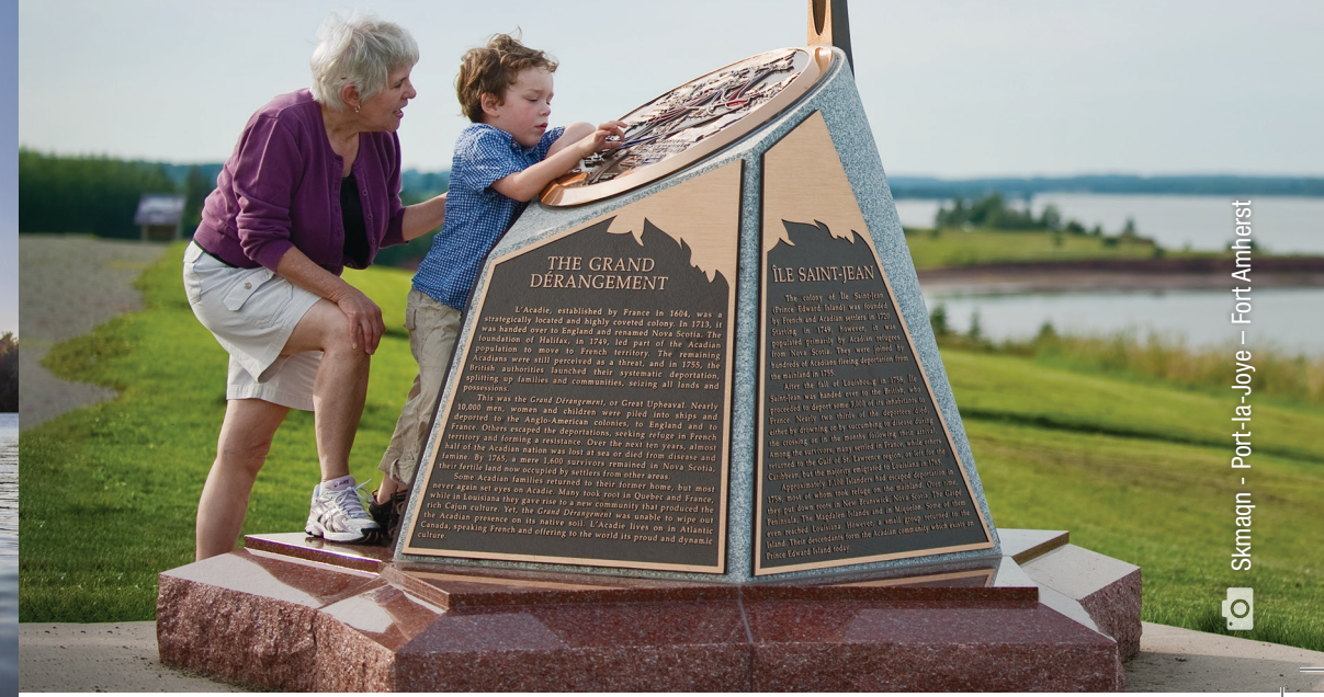
Skmaq – Port-la-Joye – Fort Amherst

Amongst the still visible ruins and with the help of interpretive panels, explore the history of the first permanent European settlement on Prince Edward Island. The grounds provide an excellent view of the countryside and the Charlottetown Harbour.