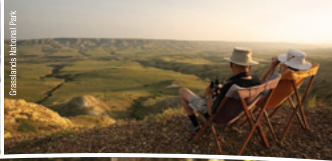
Grasslands National Park