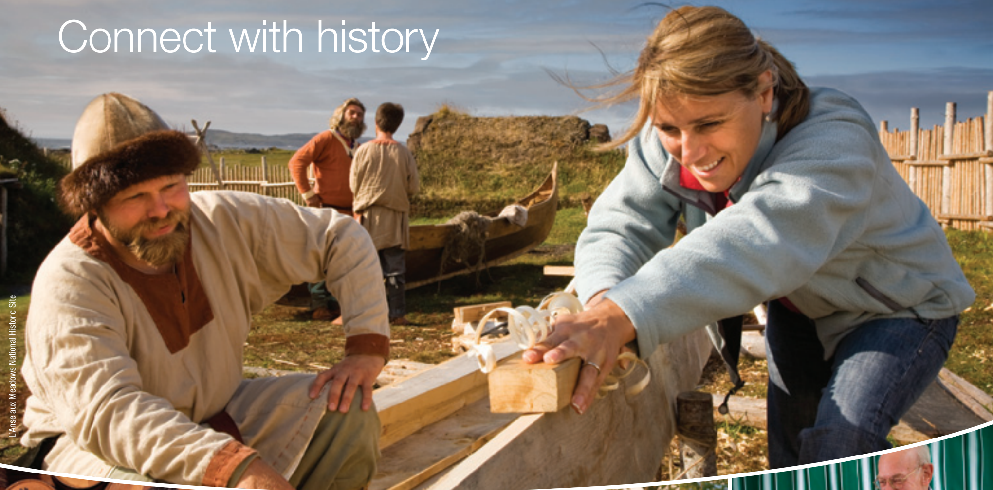
L'Anse aux Meadows National Historic Site