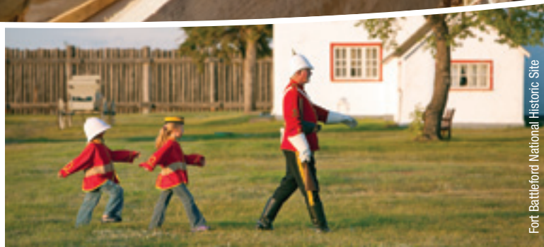
Fort Battleford National Historic Site