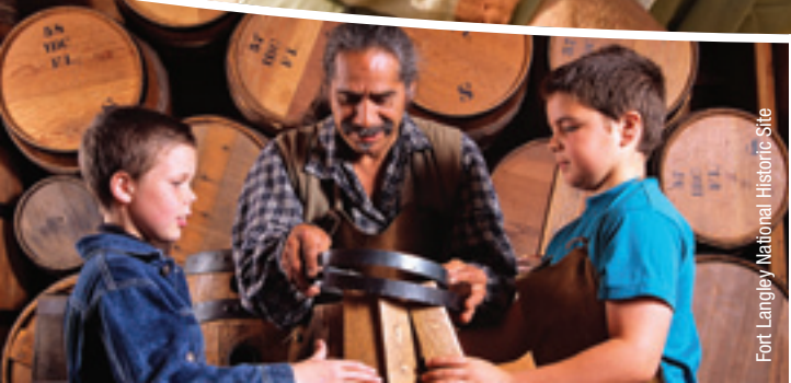
Fort Langelier National Historic Site