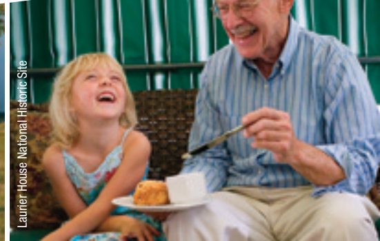
Laurier House National Historic Site