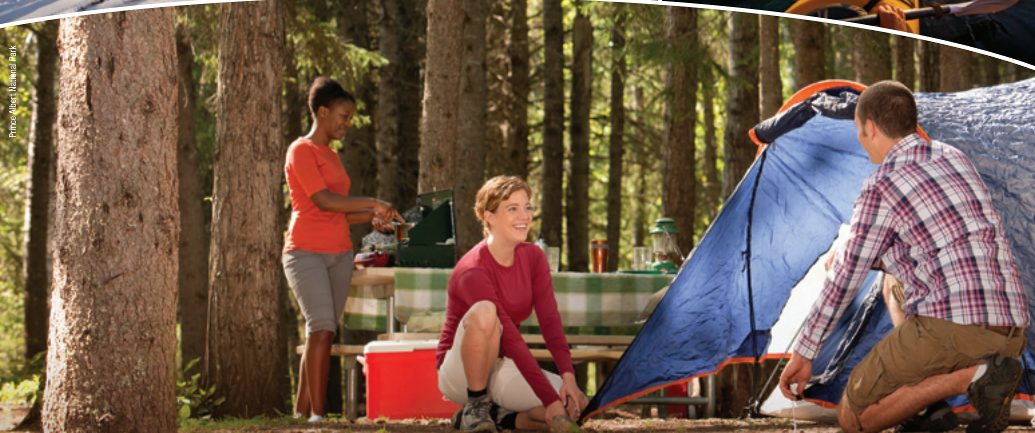
Prince Albert National Park