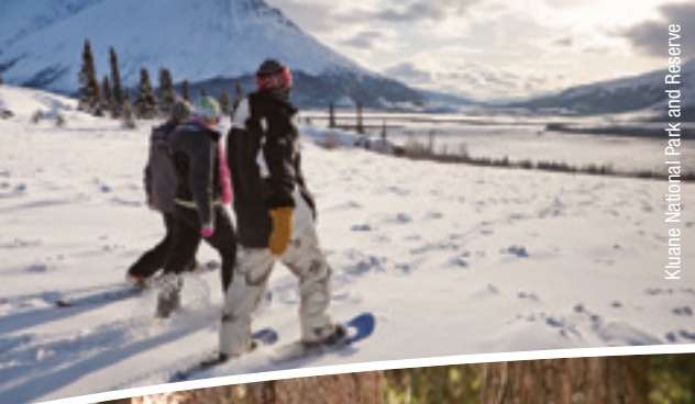
Kluane National Park and Reserve