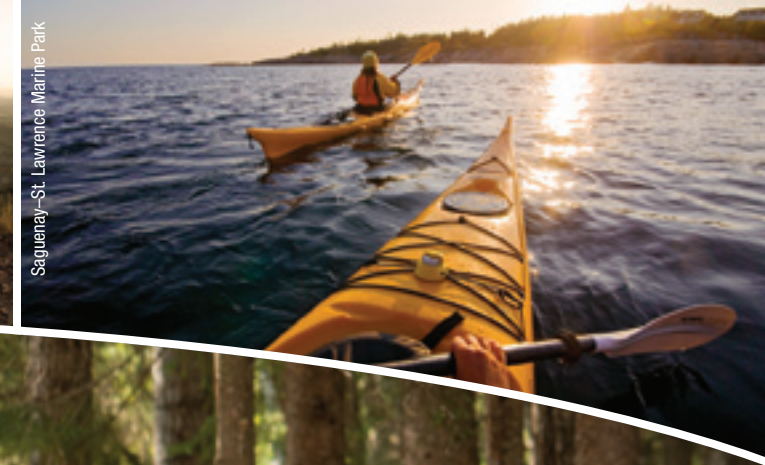
Saguenay-St. Lawrence Marine Park