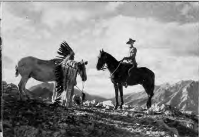
Recalling Historic Days

headquarters of the park. The Administration Building is at the south end of Banff Avenue, facing Cascade Mountain, and contains the office of the park superintendent and the post office. Near the north end of Bow River Bridge on Banff Avenue is the Park Information Bureau where visitors may obtain maps, literature, and information concerning accommodation, travel, and places of interest. Banff is also the main outfitting centre for motor, trail, and hiking trips. As a government townsite, it possesses many interesting features. Its streets are broad and well kept, and its public services include electric light, water and sewer systems, hospitals, churches, schools, banks, theatre, stores, hotels, public baths, and a museum. In addition to garages and service stations, there are several transportation companies and outfitters.