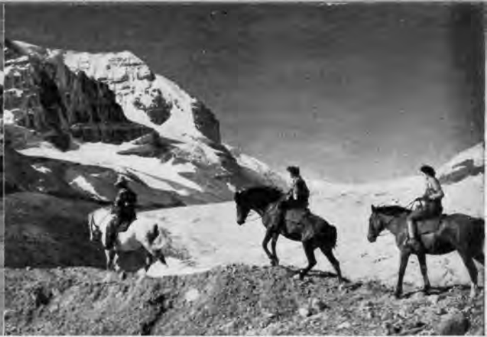
Trail Riders at Athabaska Glacier