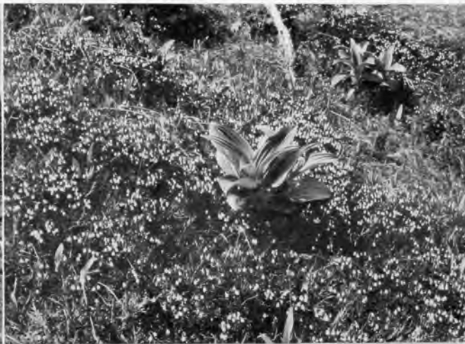
White Heath and Indian Hellebore

A four-mile hike takes the visitor to Lakes Eva and Miller. The trail skirts the Columbia Valley, and passes through alpine meadows literally carpeted with wild flowers. Both lakes are well stocked with cutthroat trout, and at