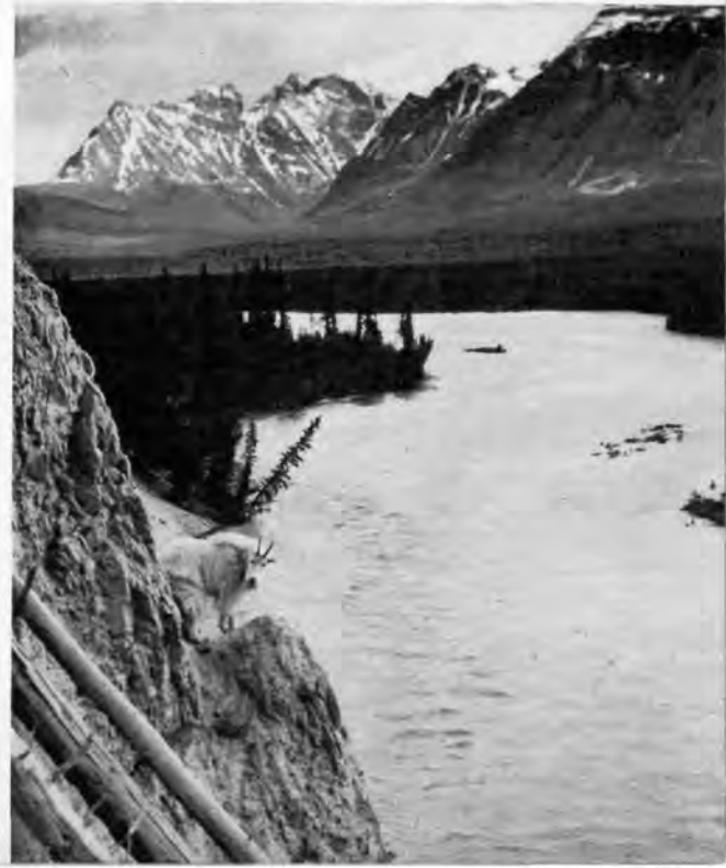
Mountain Goat Above the Historic Athabaska

(mile 16), Baker Creek (mile 28), Dolomite Peaks (mile 59), Bow Lake and Glacier (mile 60), Peyto Lake and Glacier (mile 61), Waterfowl Lakes (mile 75), Mistaya Canyon (mile 83), Panther Falls (mile 110), Sunwapta Falls (mile 150), Honeymoon Lake (mile 152), Horseshoe Lake (mile 165), reached from Athabaska Falls, Astoria River, which drains Amethyst Lakes (mile 176), Portal Creek (mile 179), Whistlers Creek (mile 181), and other attractions on the drive from Banff to Jasper.