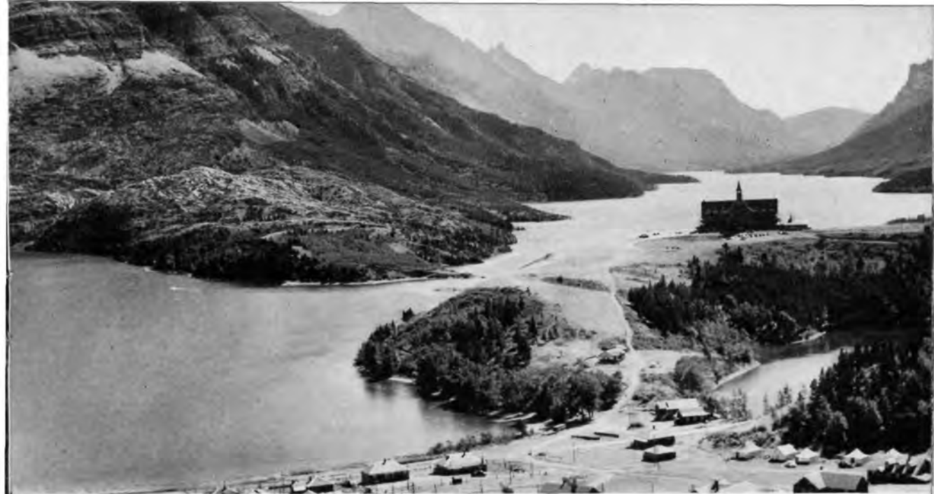
Looking up Waterton Lakes