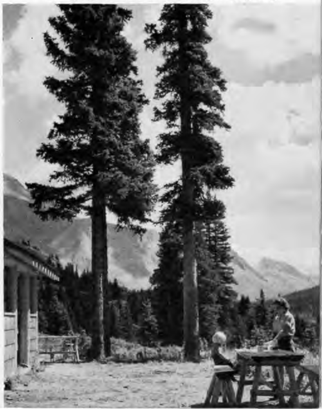
Camping out near the Banff-Jasper Highway

From its junction with the Mount Edith Cavell road the Banff-Jasper Highway runs south to the Columbia Ice-field and on through Sunwapta Pass into Banff National Park. This drive is the finest in the park, and not only provides access to Athabaska and Sunwapta Falls, but affords breath-taking views of the giant peaks that flank the Columbia Ice-field. A short description on this drive, from the opposite direction, will be found in the Banff section of this booklet.