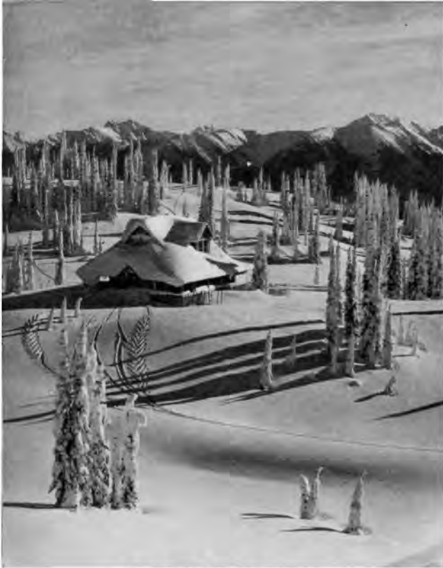
Heather Lodge in Winter

Lake Eva, a shelter, equipped with camp-stove, is available to hikers and fishermen. Jade Lake, an emerald pool in a rugged mountain setting, is also accessible by trail.