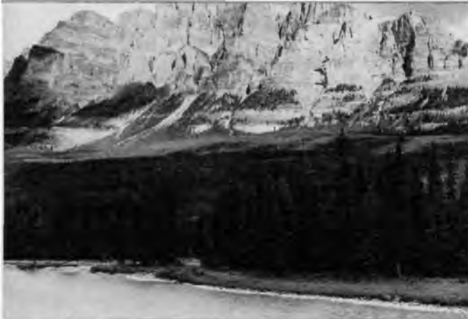
Mount Eisenhower with Bow River in foreground