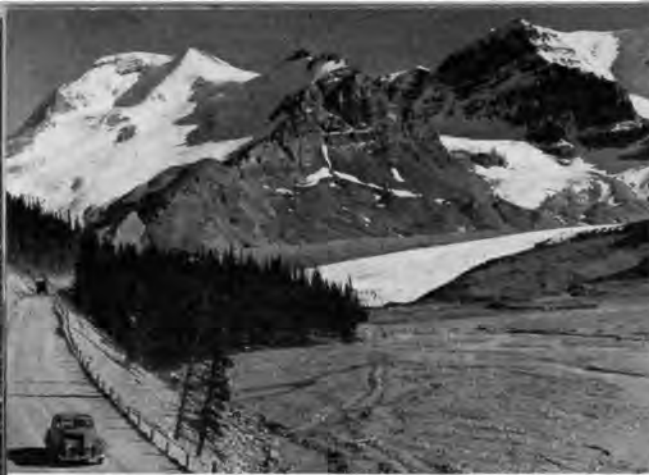
Near Columbia Ice-fields