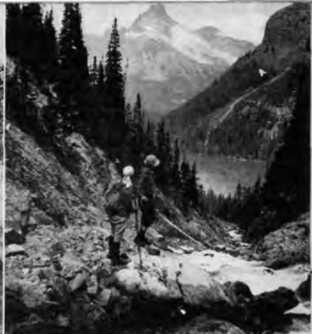
Hikers Near Lake O'Hara

Facing the falls, in a grove of spruce, is Yoho Valley Lodge and adjacent bungalow cabins. The road ends within a short distance of the Lodge, but a trail leads up the valley to Twin Falls and Yoho Glacier, skirting Laughing and Bridal Veil Falls on the way to Twin Falls tea-room. The return may be made over the High-Line Trail, built along the slope of President Range, 1,500 feet above the valley floor.