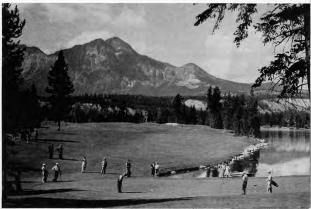
Pyramid Mountain from the Golf Course at Jasper Park Lodge

The golf course at Jasper Park Lodge is one of the finest on the continent. It is situated