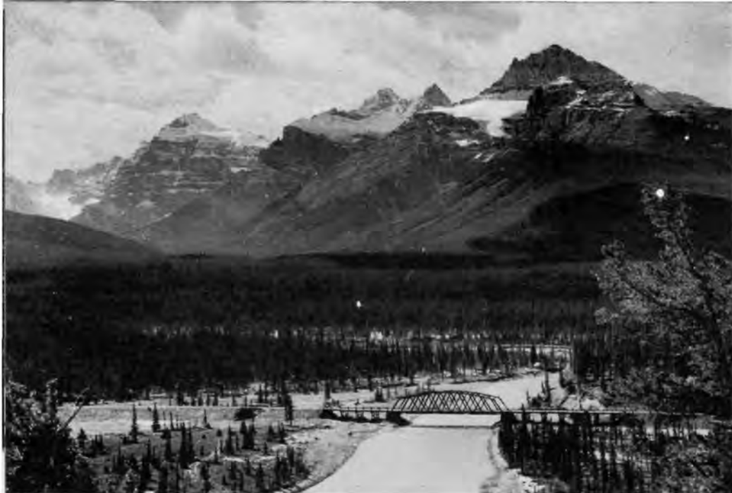
Saskatchewan River Crossing. Below the Confluence of the Howse, Mistaya, and North Saskatchewan Rivers

route leaves the Trans-Canada Highway (No. 1) and turns on to the Banff-Jasper Highway proper. The Bow River is followed to Bow Lake and its source beyond, passing in turn Mount Hector, Hector Lake and Crowfoot Glacier. Leaving Bow Lake, the road crosses the summit of Bow Pass (6,785 feet) and descends into the Mistaya River Valley.