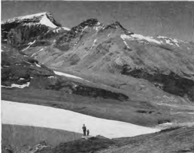
Viewpoint on the Banff-Jasper Highway