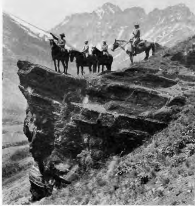
Mount Blakiston from Red Rock Bluff

Within the townsite are a children's playground, athletic field, and public tennis courts.