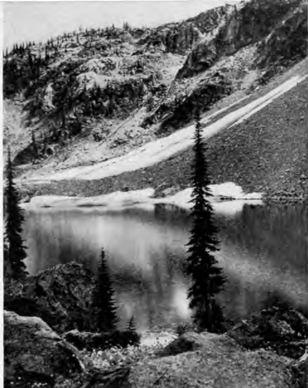
The Lake of Jade

is the town of Revelstoke, occupying a wide, picturesque flat at the junction of the Illecillewaet and Columbia Rivers. Also to the west is Eagle Pass, utilized by the Trans-Canada Highway and the Canadian Pacific Railway in their passage through the mountains to the Pacific Coast.