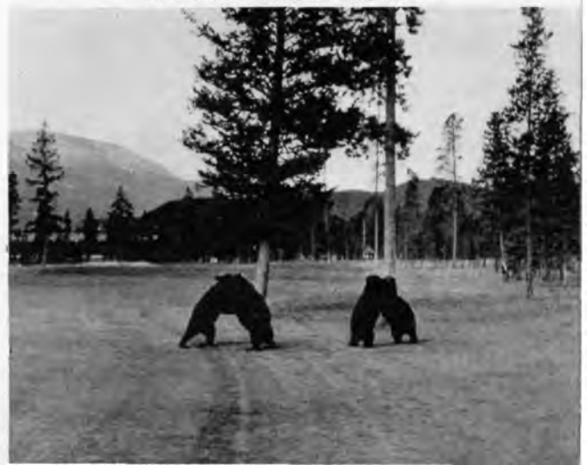
Bear Cubs Playing on Golf Course

The park also may be reached from Edmonton, the capital of Alberta, over Provincial Highway No. 16, which enters the park from the northeast. The distance from Edmonton to the park boundary is 203 miles, and from the boundary to the town of Jasper, 32 miles. Edmonton is on the main route of Trans-Canada Air Lines, and this air service connects with others operating in Canada and the United States.