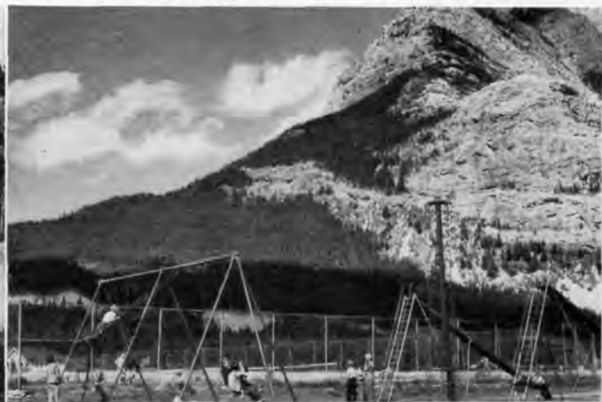
Children's Playground Waterton Park Townsite

The village of Waterton Park is the park townsite and a centre of activities. It occupies