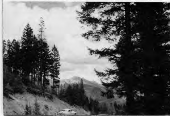
On the Banff-Windermere Highway

ing swimming pools. A tennis court is located near the swimming pools. The local administration of the park is carried out by a superintendent stationed at Radium Hot Springs.