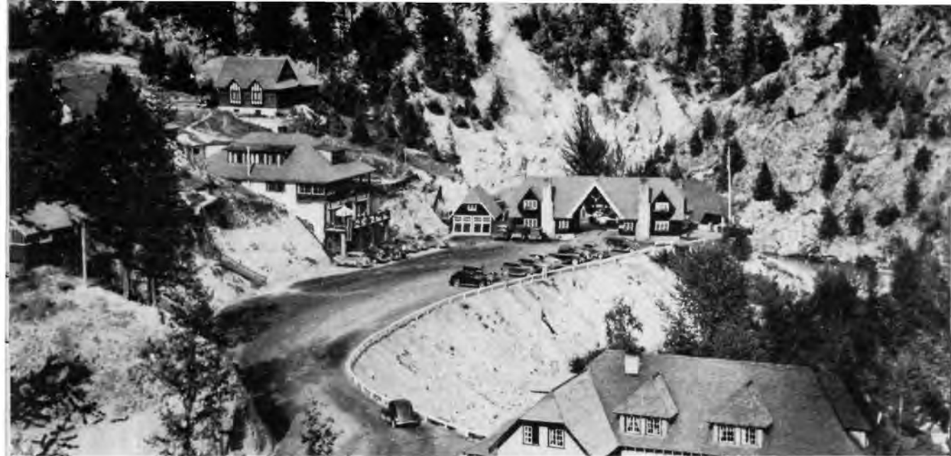
The Park Gateway at Radium Hot Springs