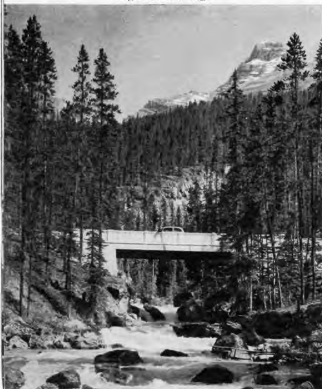
Nigel Creek Bridge

From Athabaska Glacier the road continues north down the Sunwapta River, and, skirting a deep canyon by a series of switchbacks, drops several hundred feet in two miles. Near Sunwapta Falls a short side road provides access to this thundering cataract. A short distance past the falls the road swings into the Athabaska River Valley, and eventually reaches Athabaska Falls.