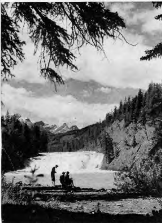
Overlooking Bow Falls at Banff

The town of Banff, situated in the valley of the Bow River, contains the administrative