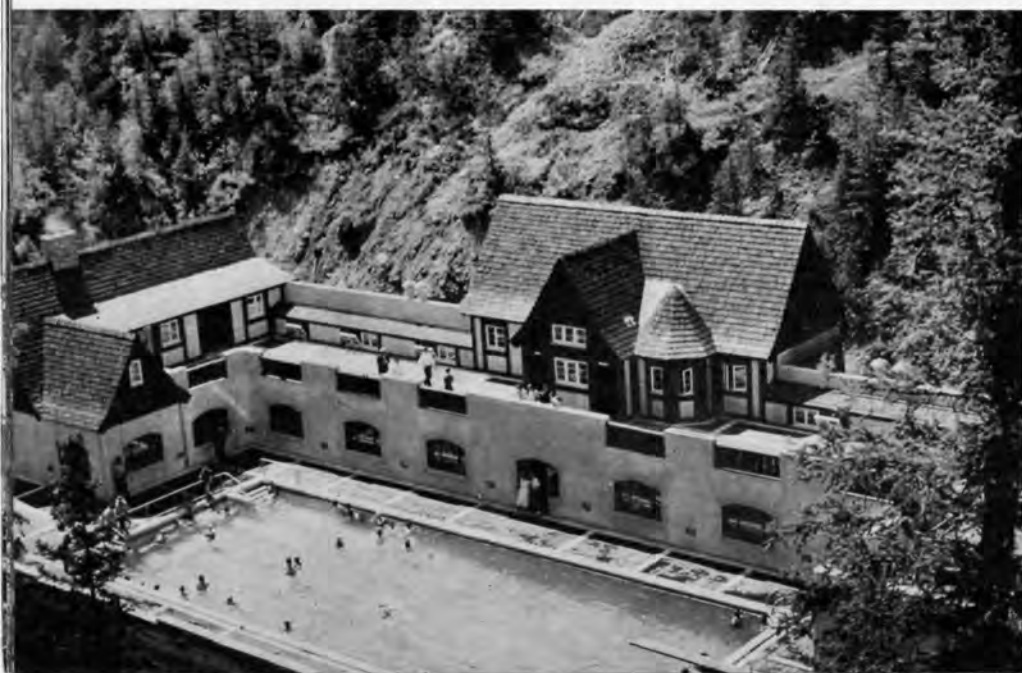
Healthful Recreation at Miette Hot Springs

The trip to the lake may be accomplished in three stages. The first is by motor road to Medicine Lake, a distance of 18 miles. Medicine Lake may be crossed from end to end