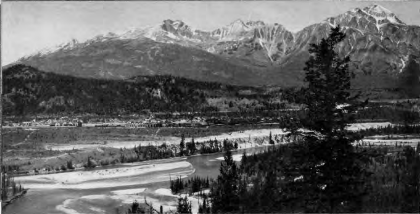
Jasper—A Jewel in the Picturesque Athabaska Valley