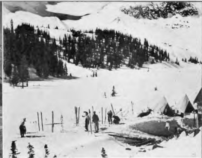
A Ski Camp in Eremite Valley

by motorboat, or skirted by trail. From the eastern end of Medicine Lake a good trail leads along the tumbling Maligne River to Maligne Lake. The return trip may be made over a different route if desired, by way of Shovel Pass and the Sky-line Trail. Chalet and camp accommodation, and boats, are available at Medicine and Maligne Lakes.