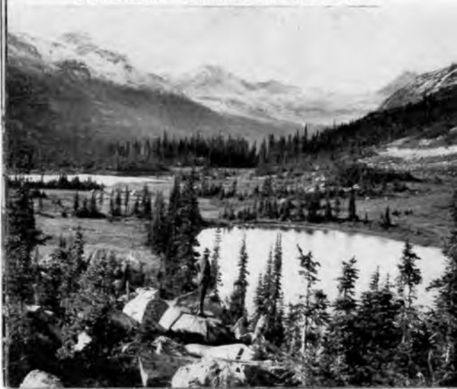
The Historic "Committee's Punch Bowl"

The Athabaska Valley also figured in the struggle between rival companies for control of the traffic in furs within the mountains, which was ended in 1821 by the amalgamation of the North West Company and Hudson's Bay Company under the name of the