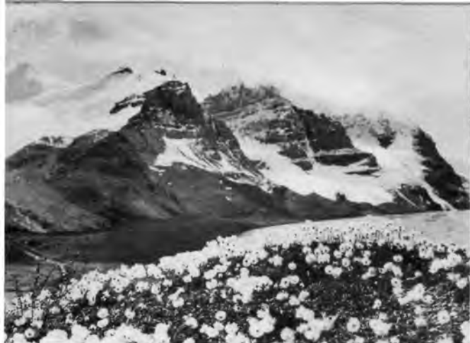
Wild Flowers Bloom Near the Eternal Snows