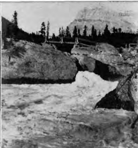
The Natural Bridge