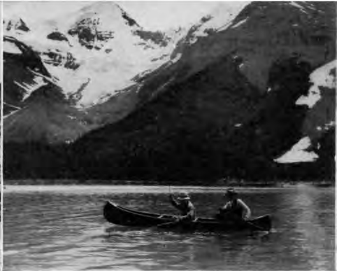
Fishing in Maligne Lake