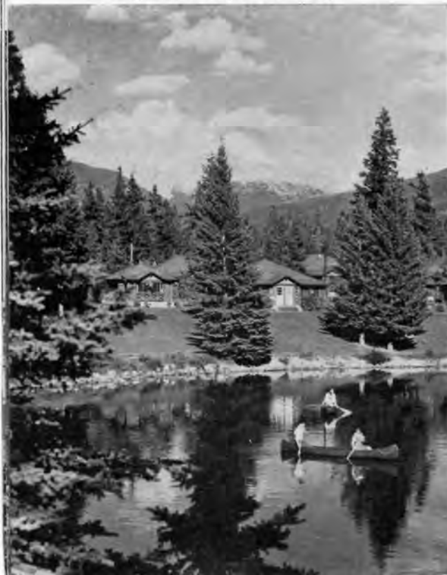
Bungalows at Jasper Park Lodge

and telegraph services are also available. Hotels, bungalow cabins, restaurants, motion picture theatre, churches, hospital, schools, and playgrounds provide the comforts of community life. In addition to garages and service stations, there are several outfitters and transportation companies available to those desiring to make excursions by saddle-pony or motor.