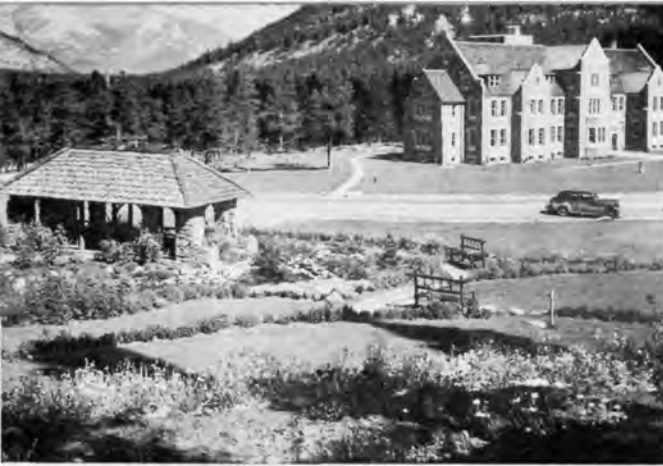
Administration Building from Cascades Rock Garden