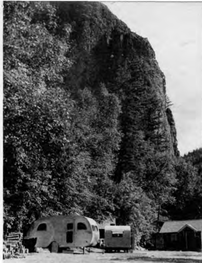
A Trailer Camp Radium Hot Springs

Another natural wonder in the park is Marble Canyon, reached by a short path which leads from the highway about 55 miles east of Radium Hot Springs. This narrow rocky gorge, nearly 2,000 feet long, has been cut through the limestone strata by the waters of Tokumm Creek to a depth of 200 feet. In places are visible layers of white and grey marble from which the canyon derives its