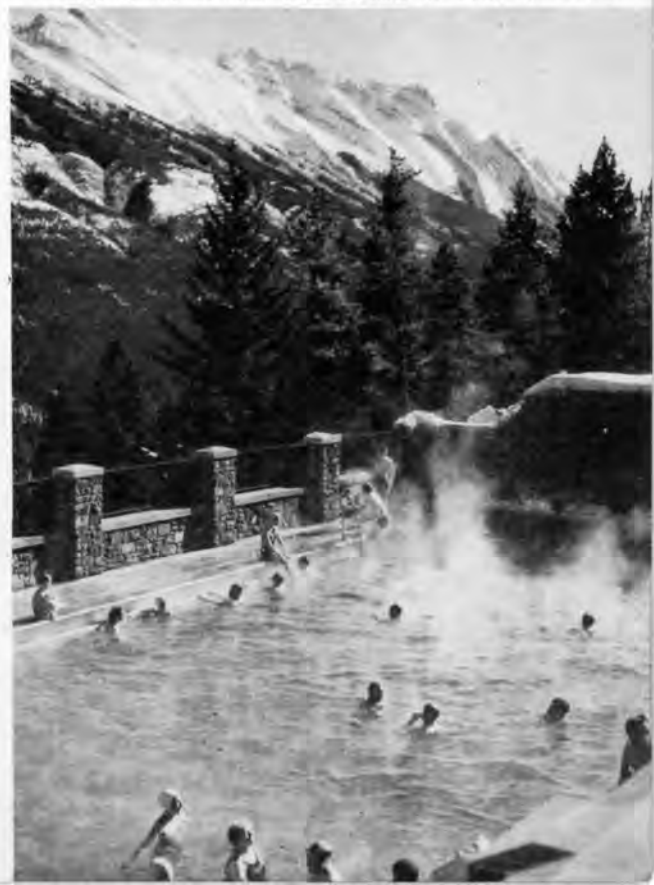
Enjoying the Mineral Hot Springs at Banff in Winter

Near the Bow River Bridge is the Park Museum, with its exhibits of the fauna, flora, and geology of the region. On the banks of Bow River, close to the museum, Central Park forms an ideal place for picnicking. In addition to tables, benches, and outdoor