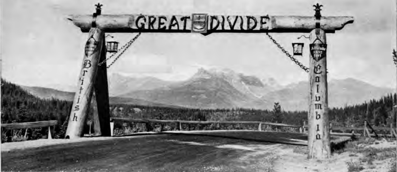
The "Great Divide" of the Rockies in Kicking Horse Pass