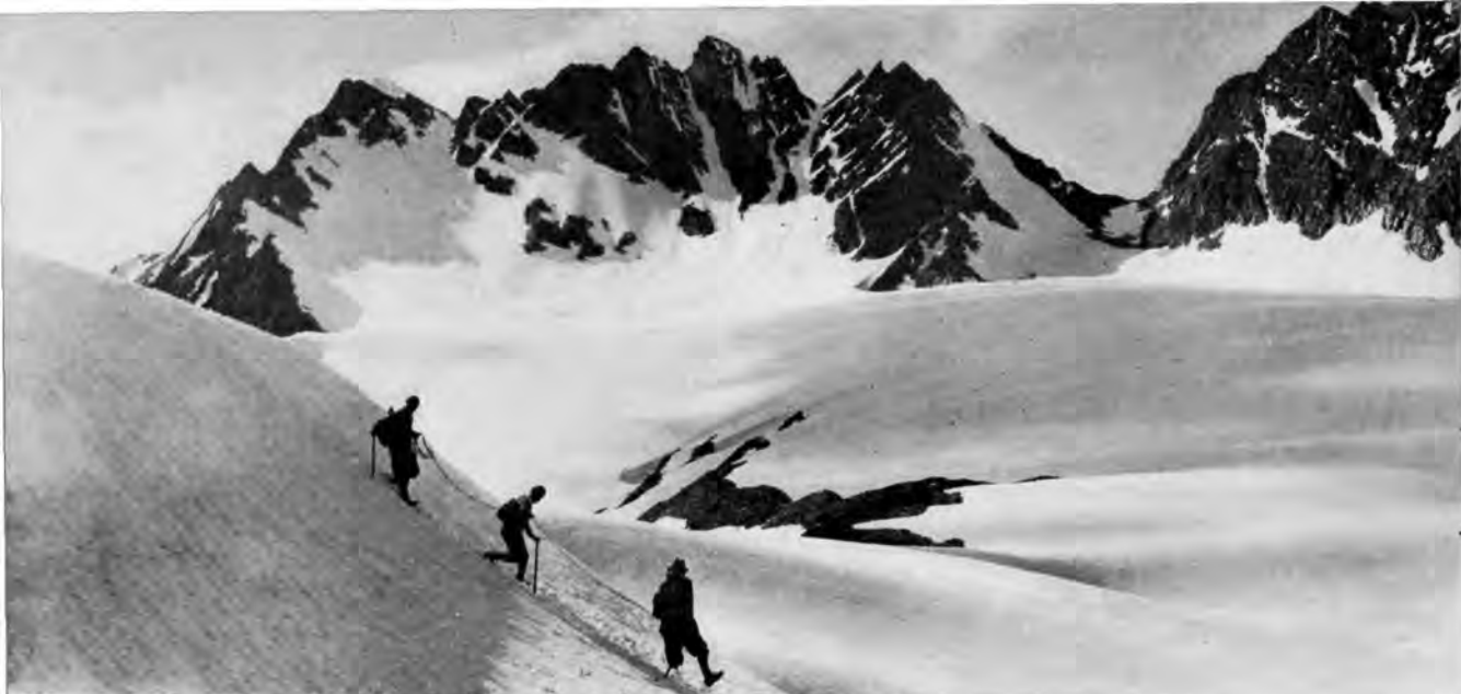
The Swiss Peaks from Tupper Glacier