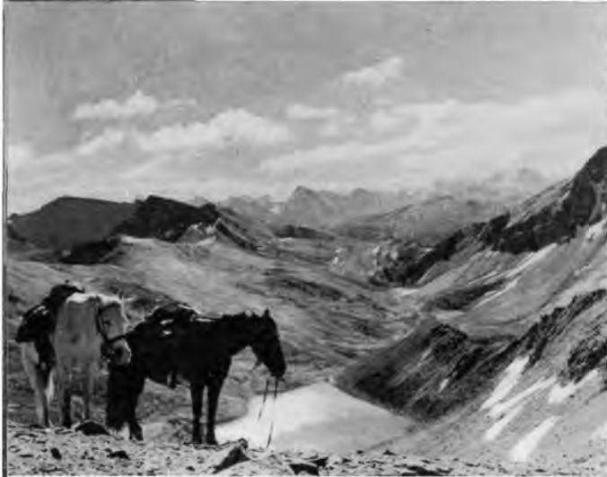
The Sky Line Trail