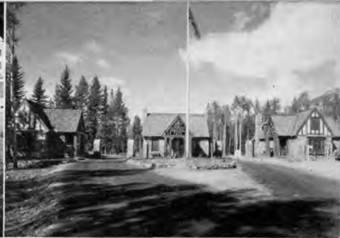
Entrance to Banff National Park from the East