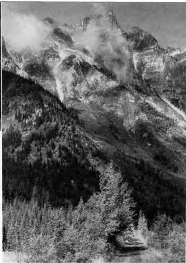
Mount Macdonald from the Rogers Pass Trail

Fishing in Glacier Park is largely confined to streams. These usually have a rapid flow and consequently the fish populations are not large. Dolly Varden and Rocky Mountain white fish are present in most streams, and fishing is best in autumn when the streams are freer of silt.