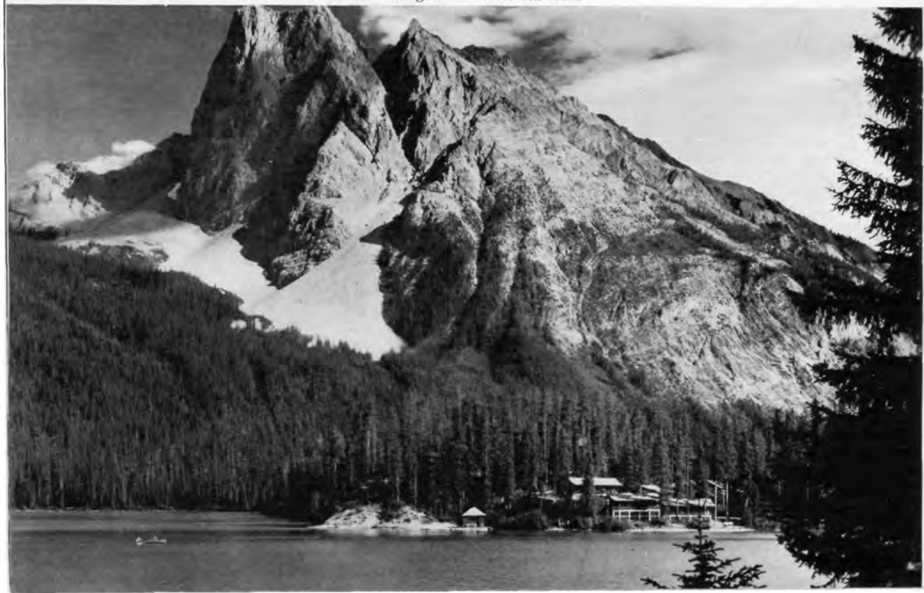
Mount Burgess and Emerald Lake

From Emerald Lake the visitors may ride or hike across Yoho Pass to the Yoho Valley. This five-mile trip skirts Yoho Lake on the summit of the pass, and provides remarkable views of the Yoho Valley.