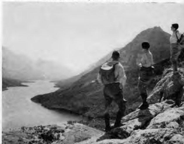
Looking South from Mount Crandell

As a result of legislation enacted by the Governments of Canada and the United States in 1932, Waterton Lakes and Glacier National Parks were proclaimed the Waterton-Glacier International Peace Park. This action was inspired by a desire to commemorate permanently the peace and goodwill which has existed between the peoples of the adjoining countries for more than 100 years. Each section of the Peace Park, however, retains its