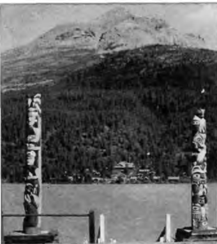
Lake Wapta from Hector Station