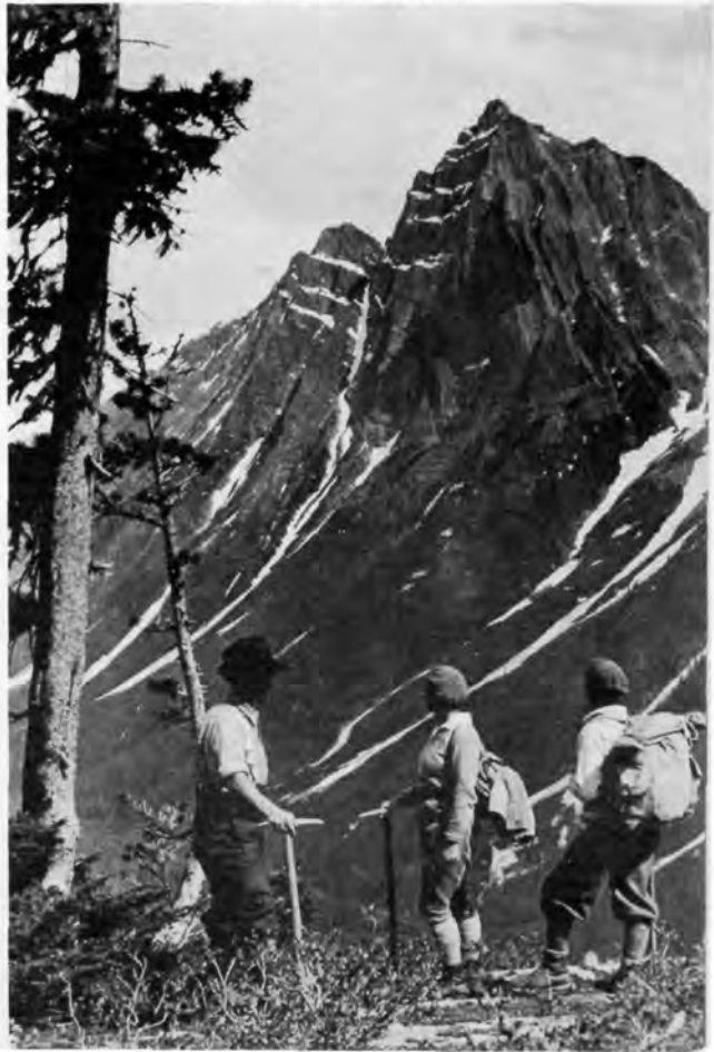
Tackling another peak