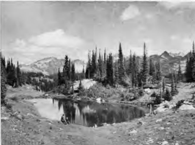
Heather Lake and Clachnacudainn Range