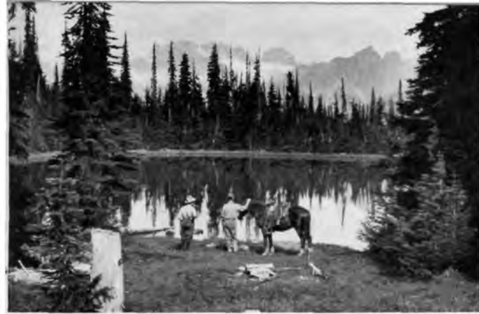
Marion Lake on Mount Abbott

of Mount Abbott, the Rampart, the Dome, and the snowy heights of Castor and Pollux come into view.