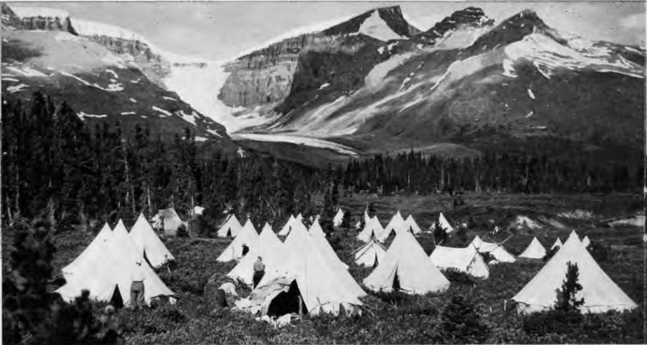
An Alpine Camp in Eremite Valley

at the base of Signal Mountain and skirts the shores of Lac Beauvert. A club-house, a professional, and services of caddies, are at the disposal of visitors.