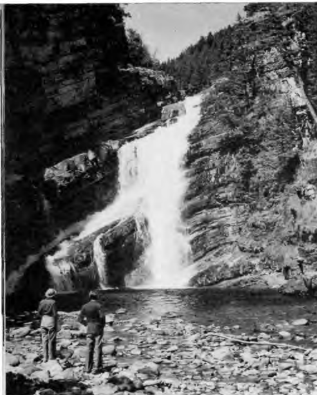
Cameron Creek Falls

individuality and separate administrative rights.