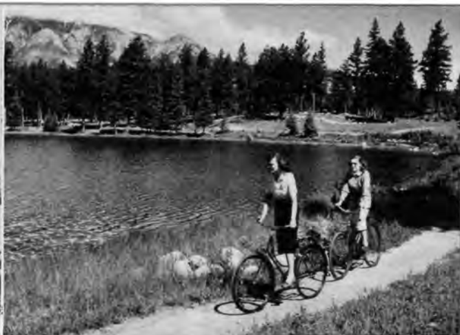
Cyclists enjoy the scenery of Lake Mildred