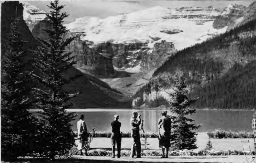
Lake Louise and Victoria Glacier

stoves, there are equipped playgrounds for children. A two-mile ride brings the visitor to the wild animal paddocks, which contain buffalo, elk, big-horn sheep, and mountain goats.