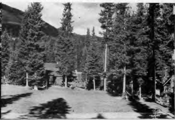
Bungalow Cabins at Vermilion Crossing

Many points of interest in the park are easily accessible from the Banff-Windermere Highway. This road provides a delightful drive of about 71 miles from its junction with Columbia Valley Highway No. 4 to Mount Eisenhower in Banff National Park, where it merges with Highway No. 1.