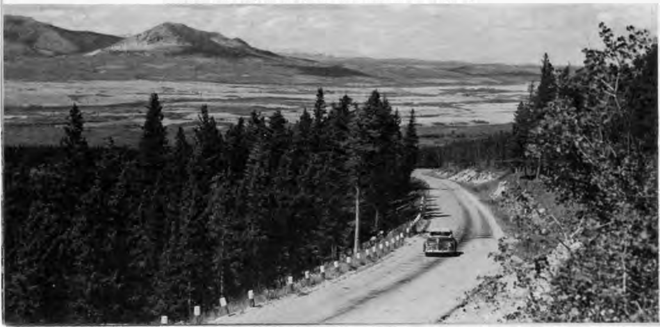
Mount Crandell from Chief Mountain International Highway