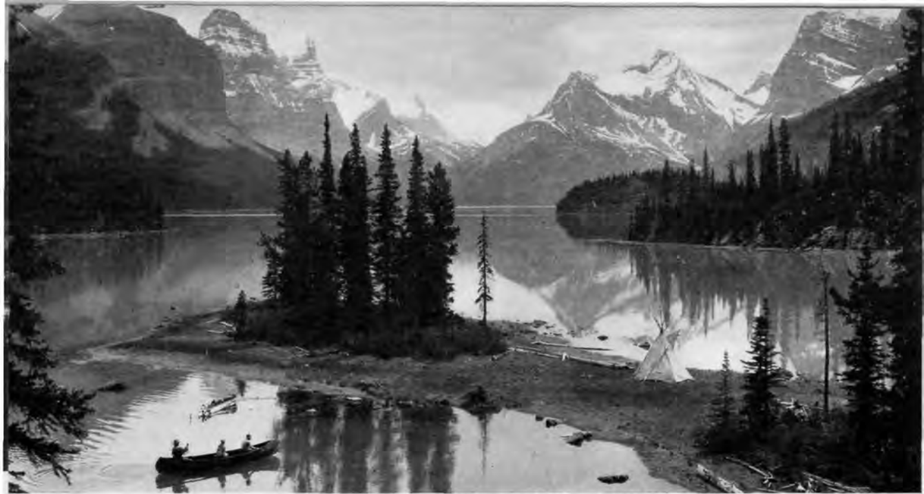
Beautiful Maligne Lake is Surrounded by Mighty Peaks

latter. The park owes its name to Jasper House, a trading post established about 1813 by the North West Company on the Athabaska River.