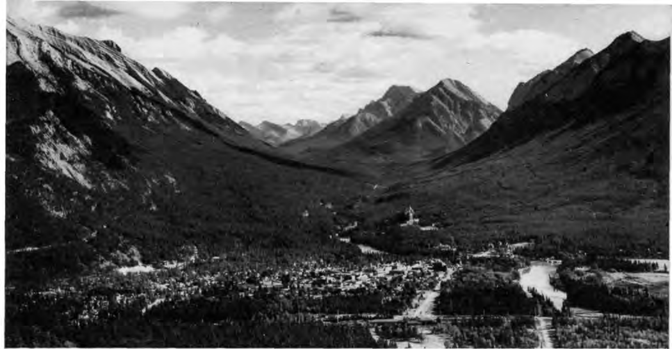
Looking down the Bow River Valley over Banff Townsite