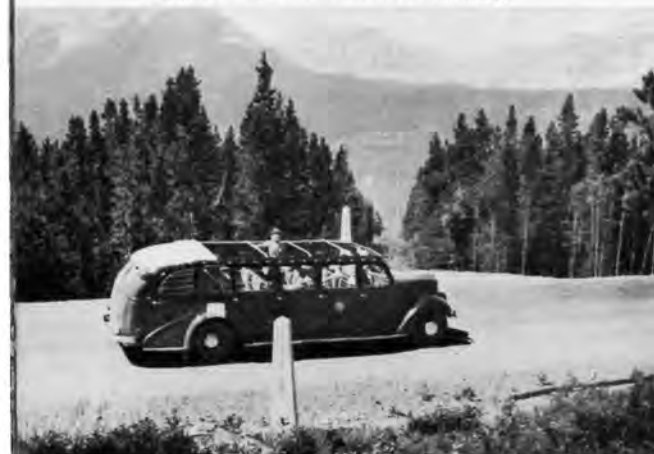
View at the International Boundary

Canada in 1895 set aside a surrounding area of 54 square miles as a national park. Later its boundaries were extended to include the present area. Prominent in the movement to establish the park was "Kootenai" Brown, first white settler in the district, who eventually served as acting superintendent.