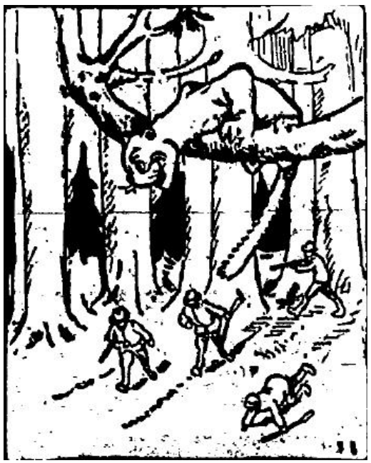
Figure 4.) Cartoon depicting the Stanley Park cougar hunt.