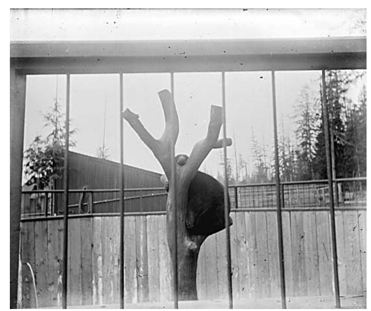
Figure 3.) For many years, the bear pit and the monkey house (shown in the background) were two of the most popular attractions in Stanley Park. Visitors could enjoy the splendour of wilderness in Stanley Park, but at a safe distance in a controlled setting. Source: Major Matthews Photograph Collection. St Pk P288.2N173.2