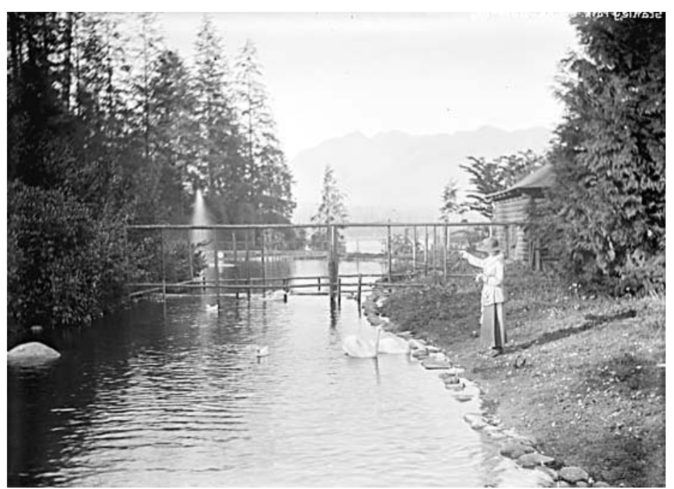
Figure 2.) The ornamental swan ponds were a popular attraction in the early years of Stanley Park drawing many to stop by the shores to feed the birds. However, these picturesque ponds were also the sight of significant carnage as the unwanted wildlife of the park, including crows and racoons, preyed upon the swans and their young.