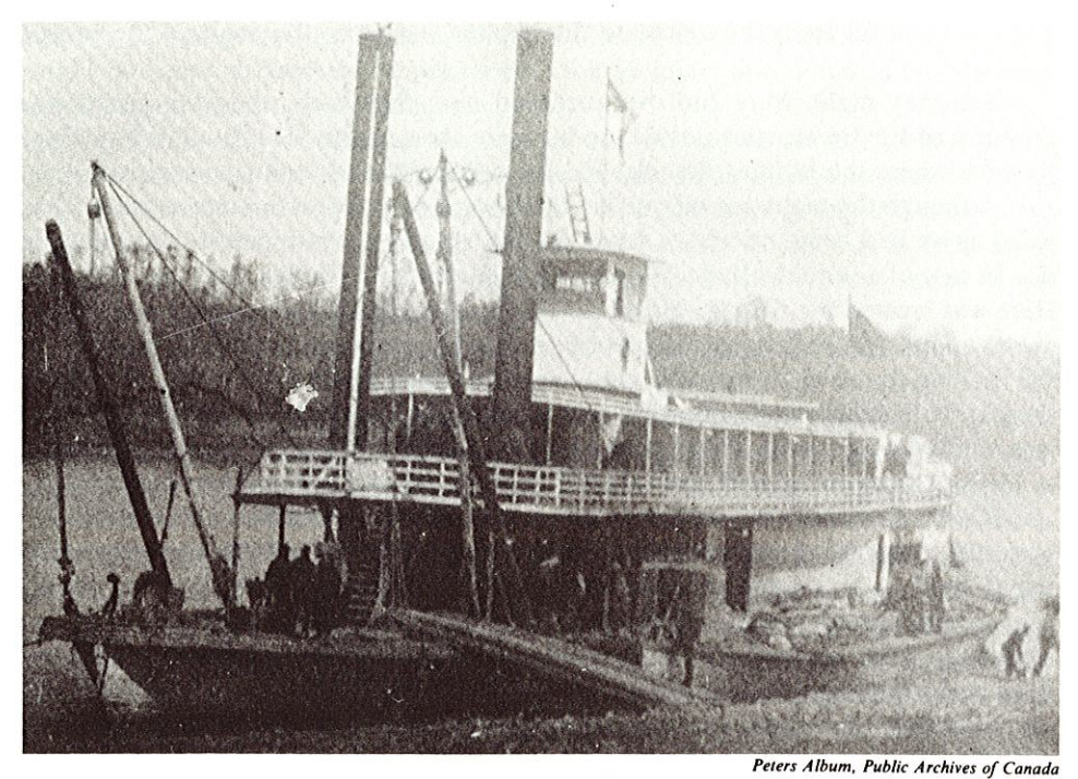
Northcote before Batoche

who, seated on the hurricane deck, passed it on to the Captain in the Wheelhouse. Six feet — four and a half — no bottom — two feet — three feet — one feet. Being so accustomed to call out "feet" after every number it became quite habitual and when it came to one feet they would roar it out in a louder tone, for, of course, it meant grounding. Now a scraping, grating sound of the boat's keel upon the sand and she was fast. Then the spars would be set to work to try and push and raise her off. The engines were put back, the steamer throbbed from stem to stern, the steam hissed and roared in the escape pipe, the sand was stirred up from the bottom of the river until the water grew thick and yellow, and if she was not very hard aground, after a few minutes of this kind of thing she was loose, but if unfortunately, as in the great majority of cases we were high and almost dry on a bar, the tow line was thrown out and the services of the Midland were called into requisition when they generally made short work of it.