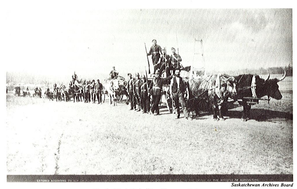
North-West Rebellion Transportation

arrival of troops a band of fifty Indians entered the Town and in a threatening manner demanded of the inhabitants provisions and ammunition, but upon hearing of the approach and proximity of troops they beat a hasty retreat. The storm prevailed all night, the heavens were black with clouds and neither moon or stars were visible. The wind raged, the rain poured and froze as it fell, I must confess a feeling of timidity during my hours of weary sentry go in the night which was from 12 o'clock until 2, the wind was so strong that I was blown from my beat several times and glad was I when the Corporal came around with relief, but gladder still when the grey streaks of dawn were visible in the East.