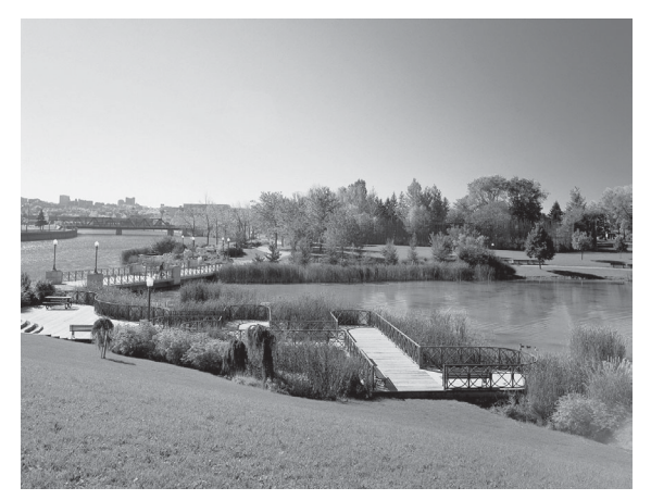
Recalling the confluence Saint-Charles and Lairet Rivers

To guarantee the satisfactory protection and presentation of national historic sites, Parks Canada has developed a Cultural Resource Management Policy . This policy is based on five major management principles: value, public benefit, understanding, respect, and integrity. As a rule, fulfilling the requirements of these principles is sufficient for assuring the commemorative integrity of a national historic site. In practice, the application of this policy signifies that the cultural resources have been identified and evaluated and their