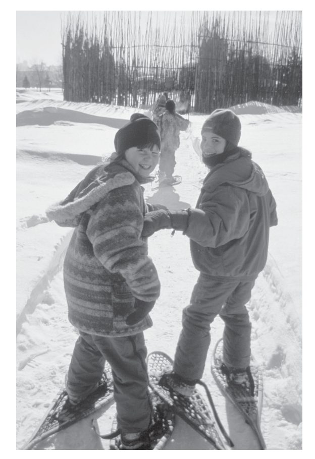
School activity

The playground groups are offered a customized program that is revised each summer. Further, seniors are offered a program centred on the Jesuits and the visit of Pope John-Paul II in 1984. Finally, in addition to its commemorative function, the site is also viewed as filling a use characteristic of an urban park, enabling the surrounding population to walk around, relax and picnic there. Among the members of the surrounding community, a strong feeling of attachment to the historic site can be felt.