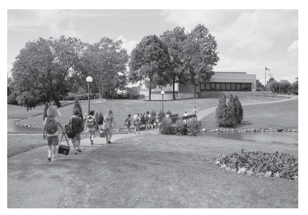
Cartier-Brébeuf National Historic Site

On June 24, 1889, the City of Québec created Cartier-Brébeuf Municipal Park. On this occasion, the Société Saint-Jean-Baptiste unveiled a monument erected by the Cercle catholique de Québec. The moment was designed to commemorate the winteringover of Jacques Cartier and his shipmates on this site in 1535-1536, and the establishment in 1625 of the first residence of the Jesuit missionaries in Québec City.