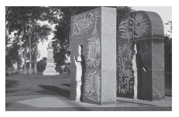
Monument to Donnacona and Jacques Cartier