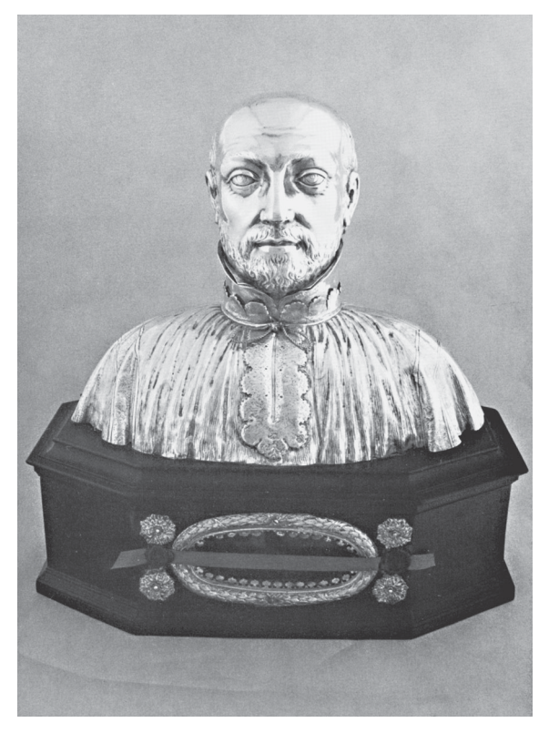
Reliquary of Father Jean de Brébeuf

began with the landing, in mid-June 1625, of five Jesuits at Québec City. Lodged for slightly more than two years by the Récollet Fathers, the newcomers built a modest residence on a portion of the land granted to them by the viceroy of New France. They dedicated its chapel to Notre-Dame-des-Anges. They also built a second building and sowed some crops. During this time, Father Jean de Brébeuf undertook his first stays among the Hurons. When Québec City was captured by the Kirke Brothers in 1629, the members of the Society of Jesus were expelled from the country. When they returned in 1632, they had to repair their residence and rebuild one section of the other building burnt by the invaders. They also erected a stake fence around the yard.