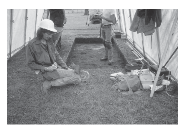
Archaeological excavations

Given the obsolescence of the Cartier-Brébeuf National Historic Site's reception and interpretation infrastructures, the primary issues to manage involve the knowledge, protection and presentation of cultural resources. Management measures have been proposed to ensure the commemorative integrity of these resources and the public safety. The implementation of these measures will contribute to strengthening the historic character and spirit of the place and, as a result, will have a positive impact on the quality of visitors' experience.