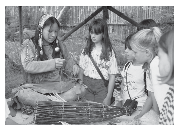
Costumed interpretation activity at the longhouse

Opened to the public in 1972, the interpretation centre was built at the top of the bank lining the northern shore of the pond. It includes a visitor information desk and souvenir counter, a modest exhibit (50 m2 including the visitor information area) dating from the