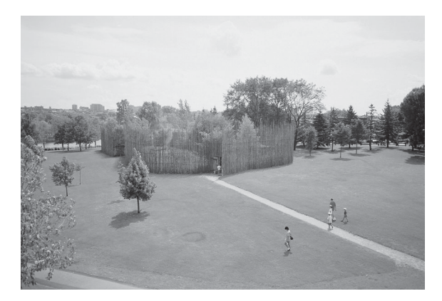
Longhouse palisade

and its high-powered tourism market. While Cartier-Brébeuf is part of a tourism market having sizeable drawing power, it does not, at this time, have the characteristics required to become a must-see site for area visitors. be they Quebecers, Canadians, or foreigners. Nonetheless, it could become a place of pilgrimage that all Canadians will want to spend time at upon arriving in Québec City. By repositioning Cartier-Brébeuf's offering so as to target visitors keen to make contact with the cradle of French civilization in the Americas, the national historic site stands to take a significant share of the potential Greater Québec City Area market, which totals more than 5.5 million tourists<sup>9</sup> when the domestic, American and other international segments are combined.