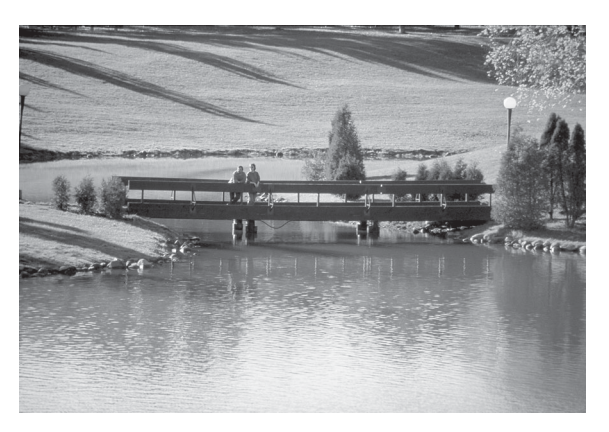
Recalling the presence of the Lairet River

The components that characterize the Cartier-Brébeuf National Historic Site landscape are the meeting point of the Lairet and Saint-Charles Rivers and the uneven slope on either side of the artificial pond. While the landscape has been significantly altered since Cartier's time, these components are still visible on site today.