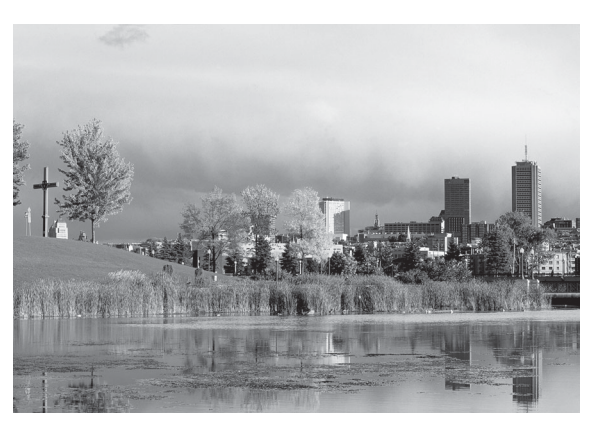
Panoramic view of Québec's Upper Town

The historic site is also rich in various other heritage values. In the southeast sector of the site, there is a cross erected in 1888 that recalls the landing of Jacques Cartier at this location. It was blessed by Pope John Paul II during his visit to Canada in September 1984. There is a granite monument unveiled during the Saint-Jean-Baptiste day celebration