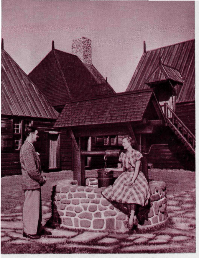
THE COURTYARD, PORT ROYAL HABITATION.