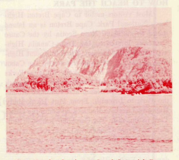
Cape Smoky dominates South Ingonish Bay.

Dogs and cats may accompany visitors into the Park. For the protection of Park animals however, dogs must be kept on leash.