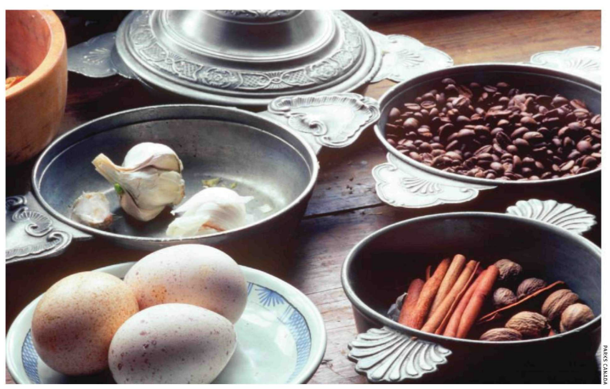
Left: Parks Canada has entered the world of food tourism. Visitors to some National Historic Sites can even take lessons in Canadian heritage cooking. A Parks Canada food app launched in 2011 provides up to sixty recipes for everything from bannock to Acadian bouilli.

Individual if grand Italianate homes with "John A. slept here" cachet were becoming a minority. Instead, new sites might be complex groupings of buildings, such as twentieth-century industrial plants — where the historic sites system, admittedly, had some catching up to do. Examples include the Gulf of Georgia Cannery in Richmond, B.C., the Medalta Potteries in Medicine Hat, Alberta, and the Gooderham and Worts Distillery in Toronto. The new concept of national historic district seemed particularly suited to Atlantic communities, such as Lunenburg, Nova Scotia, or colourful Water Street in St. John's, where colonial grids had been overlaid with two centuries of architectural styles and urban activities. Statements of significance now