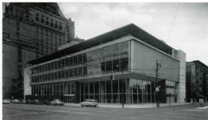
Vancouver Public Library. Semmens and Simpson, 1956-57. Clad in a glass and aluminum curtain wall, the Library's innovative design includes wide column spacing to allow for flexibility and future expansion.

wooden post and beam construction, integrated interior and exterior spaces, and extensive use of landscaping for residential buildings. One of the best examples of West Coast Regional design is the Copp House (Sharp, Thompson, Berwick and Pratt, 1951), with long horizontal wings that integrate the building into the landscape of its sloping site. The Copp House received a Silver Massey Medal in 1952. The Massey Foundation, established by (then) Governor-General Vincent Massey, awarded medals for significant contributions to Canadian architecture. Massey Medals were awarded from 1951 to 1971 to the highest quality of architecture at a given time.