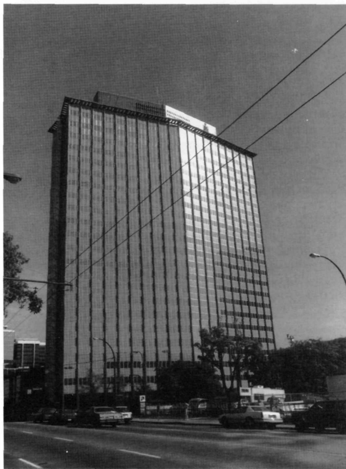
B. C. Hydro Building. Thompson, Berwick and Pratt, 1955-57. The distinctive lozenge shaped building represents a West Coast interpretation of the International Style.

The Vancouver Heritage Advisory Committee, a Council-appointed body comprised of architects, heritage advocates, heritage consultants and lay people, set about to address the problems of protecting the recent past. The first task was to raise public awareness of the architecture of this period. In a young city, it is often hard to generate