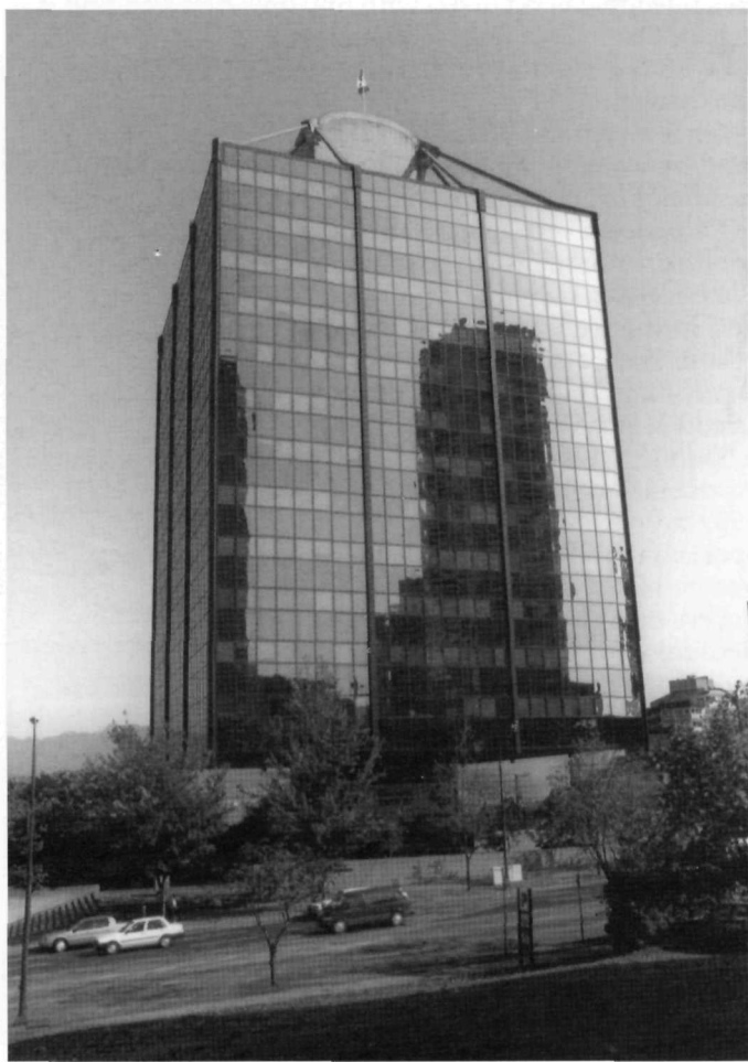
West Coast Transmission Building. Rhone and Iredale with Bogue Babicki, Engineer, 1968-69. One of the first buildings in the world to employ suspension bridge techniques for structural support: a central concrete service core serves as the main structural support; the floors are suspended by thin, continuous steel cables hung from the core. The design also allows for a column-free parking garage and open plaza areas at the building's base.

It is anticipated that most of the 100 high priority Recent Landmarks will be added to the Vancouver Heritage Inventory in the coming months. This will allow the VHI, a record of the city's architectural history, to reflect in a comprehensive way the city's heritage. Without this period of design, we would be left with the