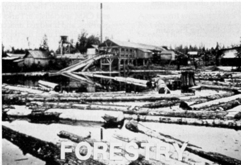
The McLean Mill in Port Alberni, B.C., in the 1930s.

The McLean Mill is the first major initiative to be undertaken under this program. The mill is located near Port Alberni, on the west coast of British Columbia. Port Alberni has historically been associated with the lumbering and pulp and paper industry. The mill was built in the period 1920-1940, when the British Columbia forest products industry was in full swing. It was