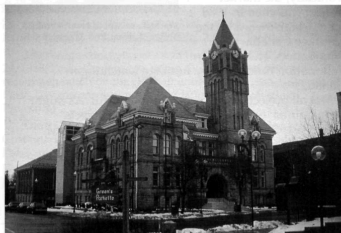
The administration facility (far right) added to the St. Thomas, Ontario, City Hall was designed in 1988.