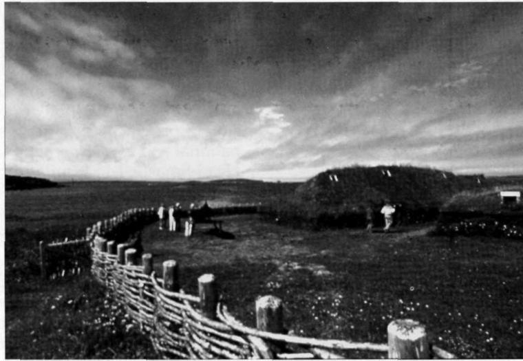
The reconstructed buildings at L'Anse aux Meadows, an early-11th-century Viking site is both a World Heritage Site and part of the system of national historic sites managed by Parks Canada.

A chronic problem, as well, in gaining provincial approval for ARC initiatives was the lack of an opera-