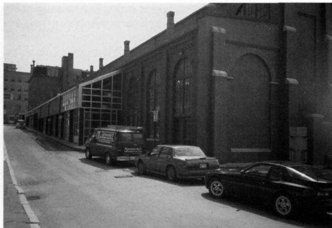
The Saint John Market's economic feasibility was ensured when glass enclosures were erected to provide additional sales space in the building. The HSMBC-designated portion of the structure was the interior, not the exterior.

tional budget. This meant that joint federal-provincial facilities could be planned and built by virtue of federal capital funding, but that operating and maintaining them was the responsibility of the provinces or other partners. 6 This precondition led to the collapse of many negotiations, as operational resources are usually the most difficult for cash-strapped governments to find. Finally, for the Atlantic Provinces, the 50/50 formula for federal cost-sharing proved quite unattractive, particularly when the federal portion for other programs was as much as 90% of the total cost. 7