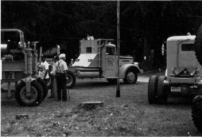
Some of the equipment that has been painstakingly restored by Port Alberni volunteers for display at the mill.

invited Parks Canada and the province to co-operate in a multi-agency development scheme.