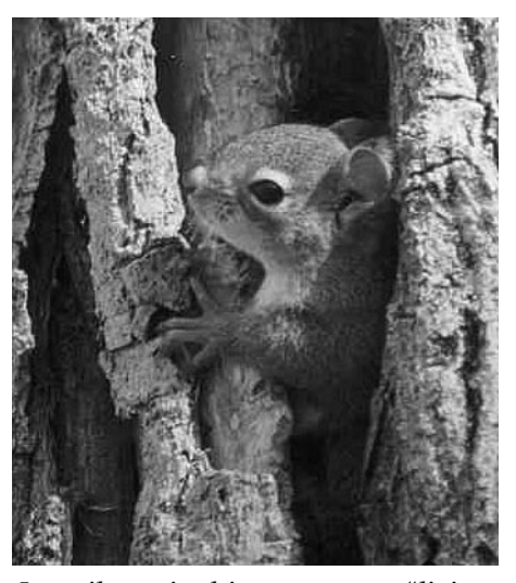
Juvenile squirrel in aspen tree, "living on the edge."

So how then do squirrels make a living in the Aspen Parkland? Do we find them only around the small amounts of spruce in people's yards, or do we find them in