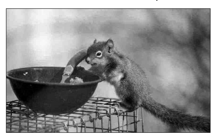
Hey, that's MY breakfast!

We've made some interesting discoveries so far. In locations without white spruce, squirrels are only found in areas with abundant beaked hazelnut, a shrub fairly common throughout the Beaverhills. Beaked hazel shrubs produce edible and nutritious hazelnuts in mid-late summer.