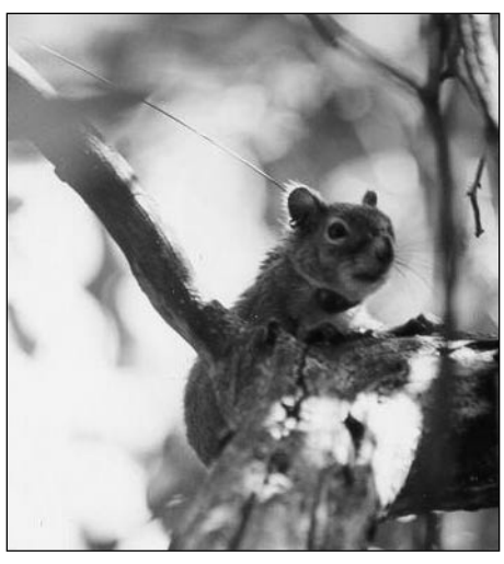
Radio-collared squirrel (listening to NUTS-FM??)

management activity. I expect that as a result of the reduction in ungulate browsing, the hazel will be able to grow more, leading to increased nut production and potentially an increase in the squirrel and other small wildlife pop-