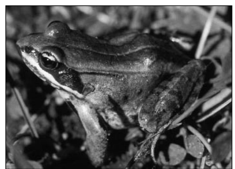
Wood frog chorus – a common sound of spring in the Aspen Parkland.

Now don't get me wrong, I love it here in 'knob and kettle country' on the doorstep of Elk Island National Park and the Cooking Lake Blackfoot Provincial Recreation Area. Consider also that the Canadian spring has it's own charms that I wouldn't miss for the world. Where else would we await those first warm rays in April with such anticipation? Where else would we venture out in shirtsleeves even though there were six inches of snow on the ground? (Perhaps we English are mad after all?) And where else would you be able to watch the brown 'cold-scorched' earth turn such a won-