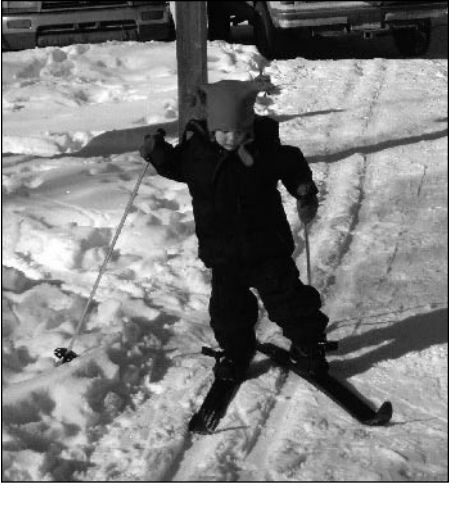
This young skier definitely shows this was a true "family ski day".

While sunshine is a great cure for winter cabin fever, the best results come when enjoyed with warm drink and food. FEIS board members and volunteers kept a steady supply of hotdogs and hot chocolate ready at the cook shelter for breaks