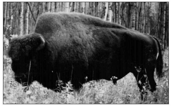
Wood Bison numbers should be back up to around 313 head in Spring 2004.

The wood bison roundup in early January 2004 accounted for 364 wood bison. This was the most successful roundup in recent decades with only 5 bison left free-roaming in the Park. A total of 113 bison of various ages and sexes were selected for removal, with 15 of these des-