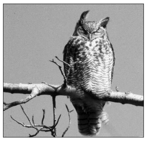
This is NOT a Great Grey Owl, but rather a Great Horned Owl, another common sighting in the Beaver Hills area!

After hiking the Hayburger trail, I went back to the count headquarters where other participants were sitting around totaling up the birds they had seen. telling each