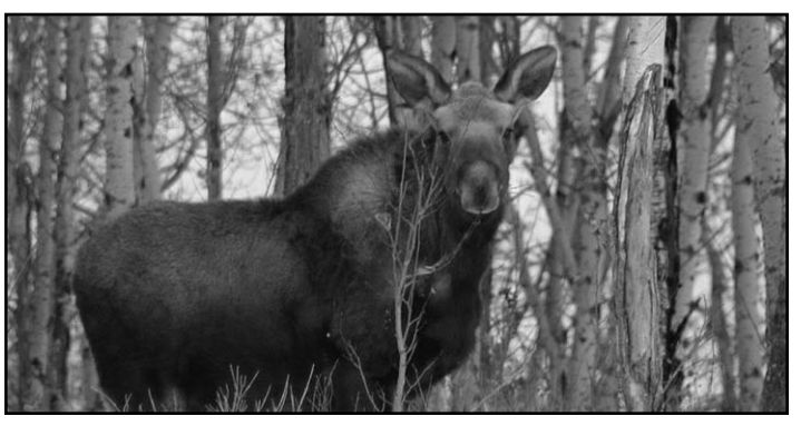
A moment in time – always have the camera ready!

Flowers: I like these because they don't run away. They may blow around, but they don't run! Think of lighting and angle, for example, using back lighting, and an unusual angle like lying on your belly. And don't be afraid to get close.