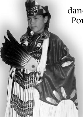
their colorful costumes were a definite hit at the Aboriginal Day Celebrations.