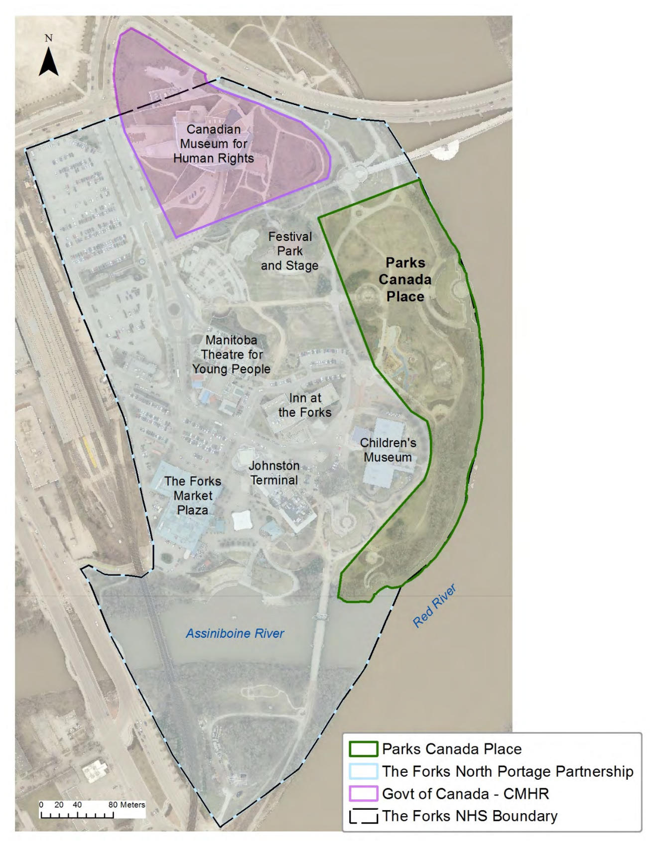
Figure 1 The Forks NHS Property Owners/Administrators. Parks Canada 2017.