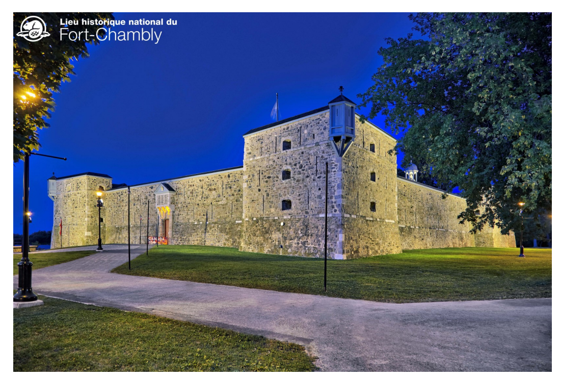
Fort Chambly National Historic Site

Annual update of the 2018 Management Plan — 2019 Season