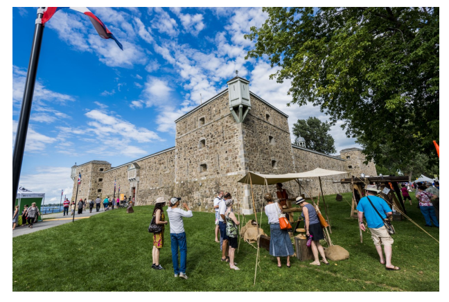
The Feast of Saint-Louis — August 17 & 18, 2019

Following this major crisis, Parks Canada will resume implementing the objectives identified in the 2019 Management Plan, notably continuing to actively collaborate with stakeholders, First Nations and partners in addition to updating or renewing activities and programs for individual visitors or groups.