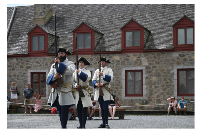
1704 Military Exercise