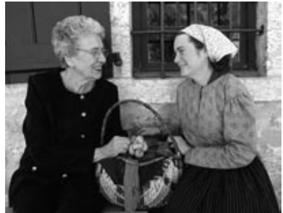
Visitor with interpreter

as an historic site, visitation grew with each new building’s restoration and the development of interpretation and other new programming. Visits to Lower Fort Garry peaked in 1973 with more than 300,000 visitors. However, by 2006, attendance stabilized at around 35-40,000.