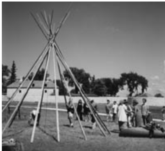
Setting up a tepee