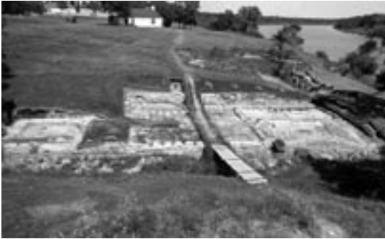
Grist Mill archaeological excavations 1967