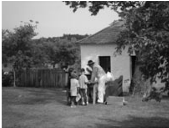
Parks Canada volunteer with visitors

west from Manitoba in 1874 to secure the peace for future western Canadians.