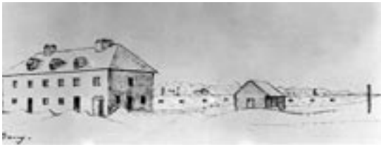
George F. Finlay sketch of Retail Store/Fur Loft 1847 Glenbow Museum Archives

A severe flood in 1826 forced George Simpson, the Governor of the District, to direct that a new fort be built on a height of land to the north below the rapids at St. Andrews. Construction began in 1831, using locally quarried limestone. By 1838, the "Big House," a sales shop, and a warehouse were completed. However, the majority of