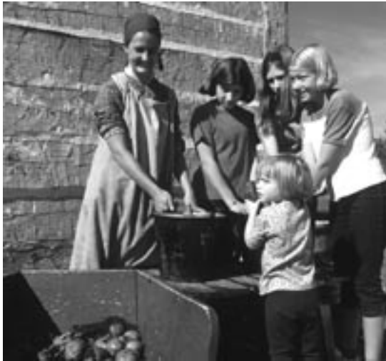
Children's Day Participants

“Parks Canada aims to offer memorable experiences to help foster a shared sense of responsibility for environmentally and culturally sound actions that will extend beyond park and site boundaries and influence the values of Canadians as a whole. Experiences gained through visits to national parks, national historic sites and national marine conservation areas provide visitors with a clear and strong sense of Canada, adding to the well-being and health of all Canadians.”