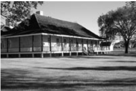
The Big House