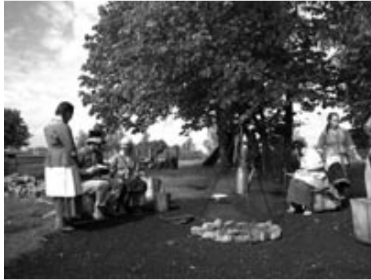
The Aboriginal Encampment.

Parks Canada cannot address the two broad issues discussed above by working alone. Lower Fort Garry has started to be more proactive in seeking partners with mutual interests. However, to increase visitation, broaden the fort's offsite presence, and maximize use of resources, Lower Fort Garry will need to foster opportunities to partner and collaborate. The site will need to work with individuals, other levels of government, educational organizations, the Lower Fort Garry Volunteer Association, community groups, First Nations, Métis, tourism operators, and destination marketing organizations. It is Parks Canada's goal that our partners will build a deep and sustained personal commitment to the site through their involvement.