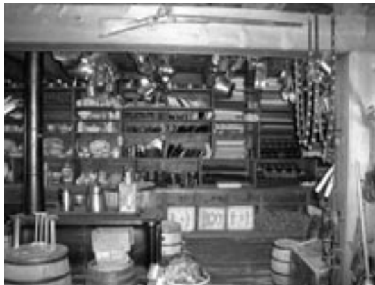
Historic objects in the Sales Shop

Lower Fort Garry also has an extensive collection of representative artefacts housed at the site and at the Western and Northern Service Centre. The richness and quantity of the artefacts makes them an important fur trade collection and a valuable part of the Lower Fort Garry story.