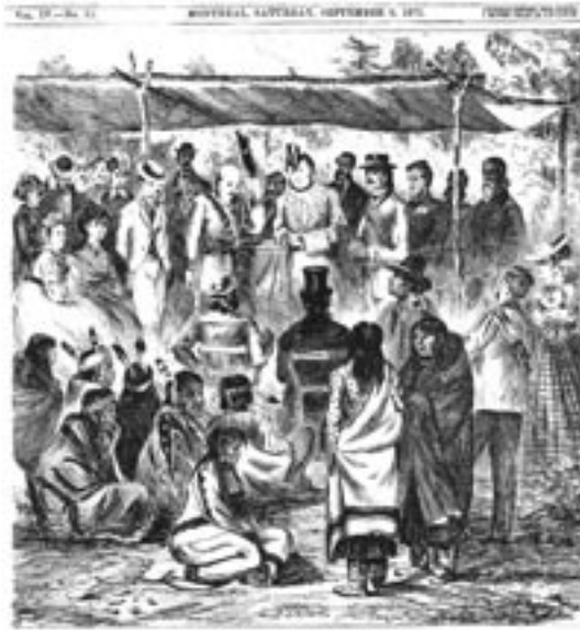
Harper's Weekly illustration of the Treaty One negotiations

In response to the transfer of HBC territory to the new Federal Crown, American expansion into the West and criminal acts committed by American traders in Canadian territory, the Dominion Government, in 1873, authorized the formation of the North-West Mounted Police. Three hastily formed, and as yet untrained, contingents of North-West Mounted police arrived in Winnipeg in the fall of 1873. The winter was spent at Lower Fort Garry drilling and learning the required policing skills. In the spring of 1874, the contingent moved west to establish Canadian law on the western prairie.