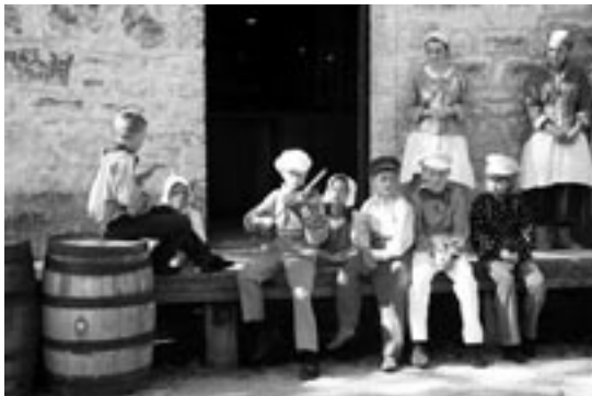
Children's Day participants