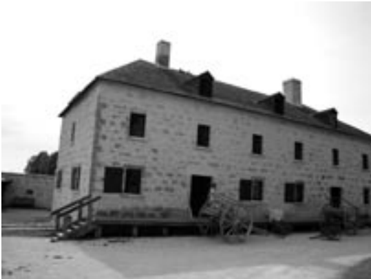
The Salesshop/Fur Loft

The extensive range of buildings and structures at Lower Fort Garry are maintained according to conservation standards and guidelines. They include: