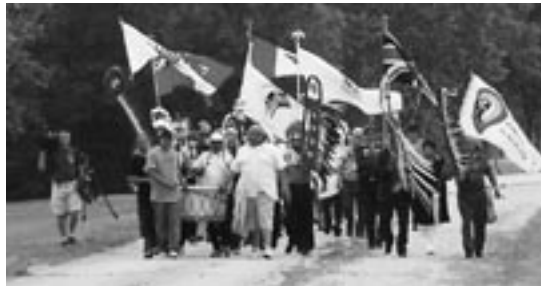
Grand entry at a meeting sponsored by the Southern Chiefs Organization

at the individual level. Individuals have the opportunity to join the 100 existing Parks Canada volunteers or the long-standing cooperating association, the Lower Fort Garry Volunteer Association.