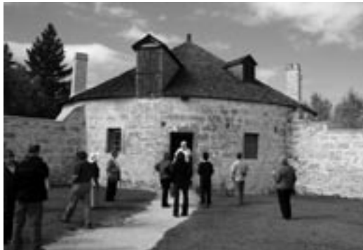
Visitors with interpreters

Local and Regional Residents: These visitors are mainly from the Winnipeg region, arriving in family groups, by private vehicle and tend to arrive on weekends and holidays, and frequently include visiting friends and family. They are an important target for special events and new programs meant to encourage repeat visitation. Children from the local area make up the majority of summer and spring break day camp participants.