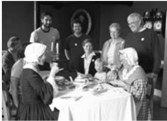
Visitors at the Big House

“Commemorative Intent” describes the specific reason a place is designated as nationally significant. Commemorative intent is drawn from the recommendations of the Historic Sites and Monuments Board of Canada (HSMBC), which are approved by the Minister responsible for Parks Canada.