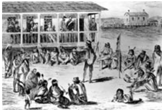
Illustration of Treaty One Negotiations at Lower Fort Garry

By the 1860s and 1870s, the trade traffic on American routes increased and Lower Fort Garry became a depot and supply point for interior destinations. Canadian brigades were now organized and provisioned at Lower Fort Garry rather than at Norway House or York Factory. By 1872, steamboats operating on the Red, Saskatchewan and Assiniboine Rivers replaced the Red River cart trains that had travelled from St Paul, Minnesota to Fort Garry and then across the prairies. In the 1880s, the Canadian Pacific