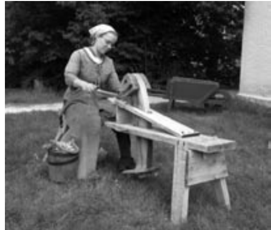
Demonstrating the use of a draw knife

Most of the standing structures associated with Lower Fort Garry underwent substantial modification during the use by the Manitoba Motor Club between 1913-1951, including the removal of those no longer deemed necessary. Beginning in 1963, the site saw a period of major restoration, development and reconstruction. This work focused primarily on the structures and facility development, and was accompanied by a large-scale archaeological program. Recent infrastructure investment, although on a more limited scale and reflective of current cultural resource management practices, has continued this process of site conservation in