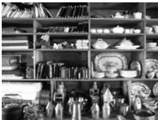
Historic Objects in the Salesshop