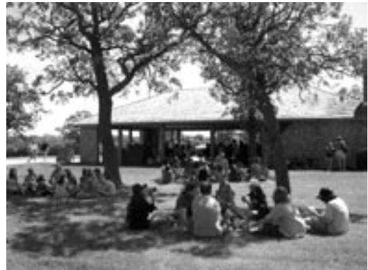
A Picnic at Lower Fort Garry

Aboriginal People: For Aboriginal people, Lower Fort Garry has personal relevance – it was the place where Treaty Number One was made. It was a home and workplace for many First Nations and the Métis peoples. They are personally connected to the stories and history and have an important role in connecting and sharing it with Canadians.