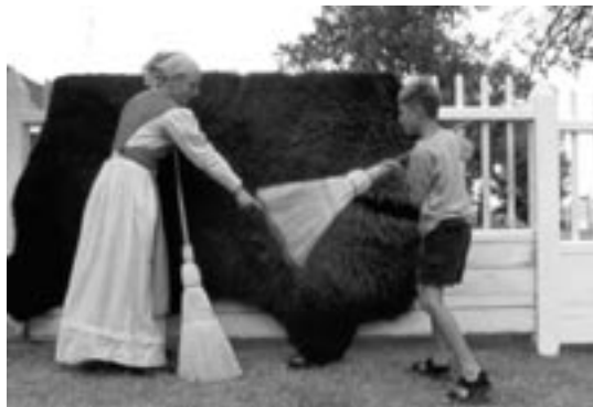
Visitors at Lower Fort Garry

Actions taken by Parks Canada over the course of the past number of years have set the stage for developing meaningful and rich visitor experiences at Lower Fort Garry. In many respects, the groundwork has been laid, key investments are in place and new ideas are emerging and being tested. These efforts are starting to yield results. More importantly, they are fostering a culture of innovation, collaboration, and a strong service orientation. However, there is a strong need to maintain the momentum and continue to build a dynamic package of program, services and facilities that offer rich and meaningful visitor experiences.