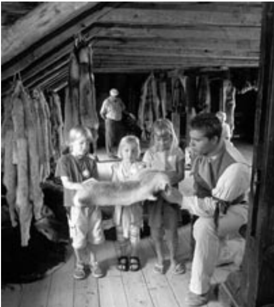
Interpreter with Children in the Fur Loft

They will tell stories that are vivid and compelling, stories with the breadth and depth of Canada itself. The programs will be carefully designed to engage people through their emotions and senses. This will ensure that people leave the site with a clear and enduring belief that this place is much more than a distant relic of the past because it has personal relevance to them today.