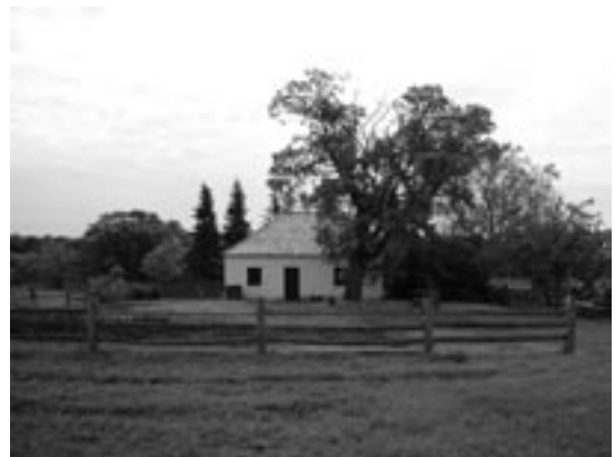
The Guest (Ross) Cottage