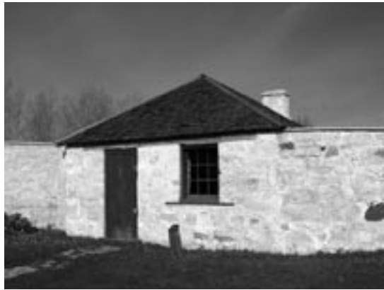
The North West Bastion and Bakehouse