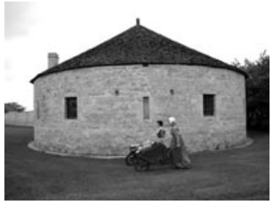
The South West Bastion