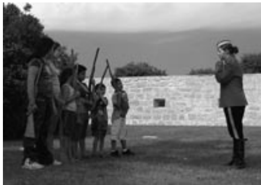
Visitors learning North-West Mounted Police drills

“Commemorative Intent” describes the specific reason a place is designated as nationally significant. Commemorative intent is drawn from the recommendations of the Historic Sites and Monuments Board of Canada (HSMBC), which are approved by the Minister responsible for Parks Canada.