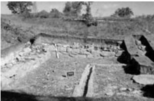
Retaining wall and drain comprising part of the brewery complex

Since 1962 archaeological investigations and research have identified components to 25 structures and approximately 105 cultural features and/or activity areas. Most of these are Level 1 cultural resources. 1 They include resources directly associated with the interior of the fort such as house features, privies and cookhouses. North of the bastions and walls are several archaeological features associated with the agricultural complex. These areas once held gardens and barns for oxen, horse and cattle. Along Monkman Creek are the remains of the Industrial Complex and features associated with shipping and boating. South of Monkman Creek are remains of the Miller's House and pre-contact aboriginal encampments. Historic documentation suggests there are at least another 83 unverified structures or activity areas, reinforcing the need for