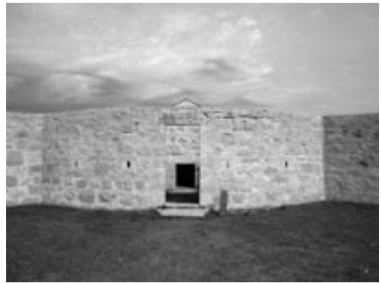
The North East Bastion/Powder Magazine