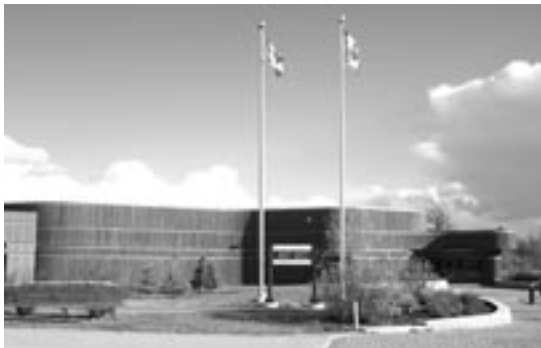
The Visitor Reception Centre

With the redevelopment, the VRC can now offer program options and serve different markets. Complementing this capital investment, the site has staffed a business affairs officer to market the site and its facilities and to manage the growing suite of special events and third party use.