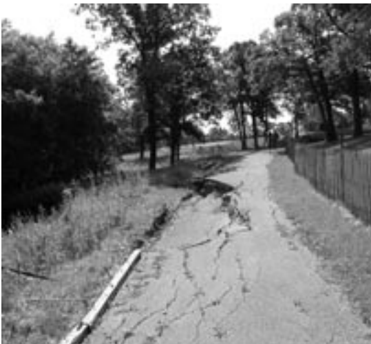
Monkman Creek bank failure

The development of an archaeological resource inventory and a cumulative impact analysis in 2002 summarized four decades of past archaeological work and site interventions and has become a valuable tool for cultural resource management. For example, a major initiative undertaken in 2006 to stabilize Monkman Creek used key data from this document. Engineers factored historic engineering works, such as retaining walls, into the project design. The result was an integrated environmental, landscaping and engineering approach to creek bank stabilization that ensured cultural resources were the primary design consideration.