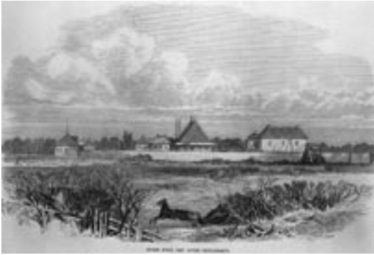
Stone Fort, Red River Settlement.