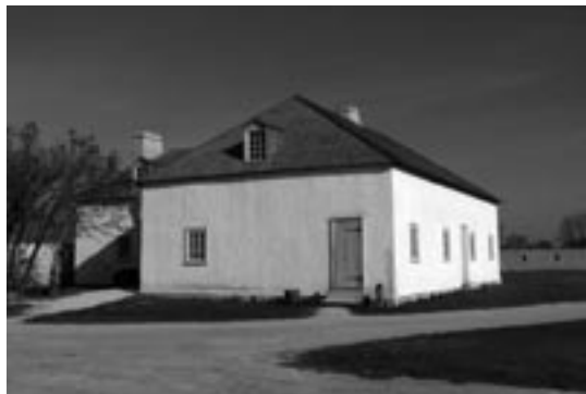
The Men's House