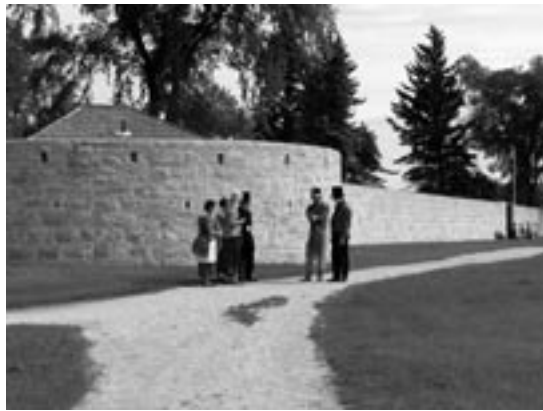
The South East Bastion