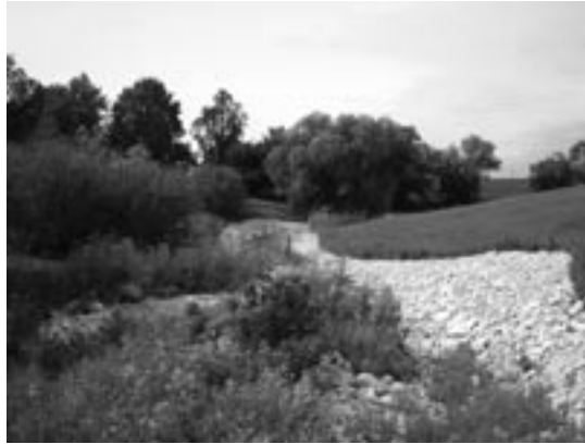
Monkman Creek after bank stabilization project