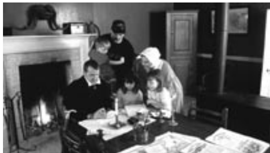
Big House interior

The making of Treaty Number One is of special significance at Lower Fort Garry. Annually, on the anniversary of the treaty signing, Lower Fort Garry provides special theme-based programs. This commemoration presents a number of challenges - presenting multiple perspectives on the meaning of the treaty in a respectful fashion, recognizing the modern dynamic context for treaty relationships between the Crown and First Nations and respecting the role of other Federal Government agencies in ongoing deliberations around treaties, treaty rights and obligations.