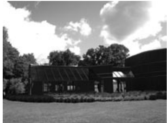
Solar panels at the Visitor Reception Centre Patio

In recent years, Parks Canada has recognized that much of its infrastructure is reaching the end of its life. However, replacing infrastructure with the same technology may not represent the best use of scarce resources. The recent recapitalization of the Lower Fort Garry's Visitor Reception Centre underlines the need for investments to meet multiple objectives in order to maximize return on the expenditure of public funds. That project incorporated the needs and expectations of current and future visitors, invested in new energy savings technologies to reduce operating costs, and incorporated design features that encourage greater partnership opportunities.