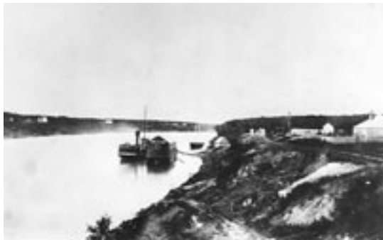
The Steamer Colville tied to the floating warehouse at Lower Fort Garry 1879

In response to the transfer of HBC territory to the new Federal Crown, American expansion into the West and criminal acts committed by American traders in Canadian territory, the Dominion Government, in 1873, authorized the formation of the North-West Mounted Police. Three hastily formed, and as yet untrained, contingents of North-West Mounted police arrived in Winnipeg in the fall of 1873. The winter was spent at Lower Fort Garry drilling and learning the required policing skills. In the spring of 1874, the contingent moved west to establish Canadian law on the western prairie.