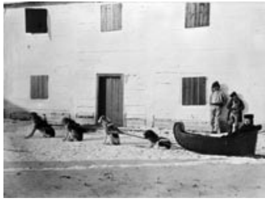
A dog team at a fur trade post

By the 1860s and 1870s, the volume of goods travelling over American routes increased and Lower Fort Garry became a depot and supply point for northern destinations. Brigades were now organized and provisioned at Lower Fort Garry rather than at Norway House or York Factory. By 1872, steamboats operating on the Red, Saskatchewan and Assiniboine Rivers replaced the Red River cart trains that travelled up from the south. With the arrival of the Canadian Pacific Railway in the 1880s near Upper Fort Garry, the steamboat routes became redundant.