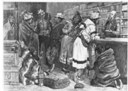
Frederick Remington's interpretation of a HBC Store

In the local region, the store at Lower Fort Garry was the source of trade goods for the surrounding parishes of St. Andrews, St. Clements, and St. Peters. The fort was a major purchaser of excess local produce. In addition, the farm, industrial complex and adjacent fishery employed many regional residents.