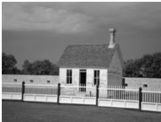
The Doctor's Office