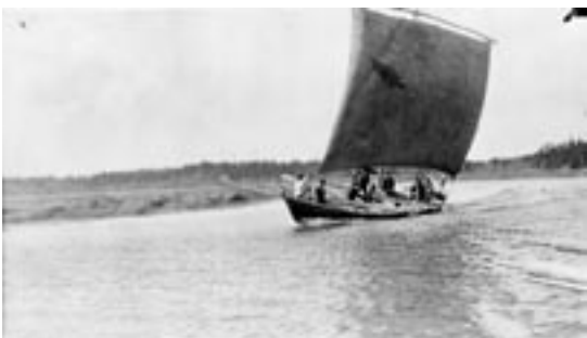
York Boat under sail

Lower Fort Garry evolved into a transshipment centre, a provisioning centre and assembly point for the regional fur brigades that travelled the Red River-Portage La Loche-York Factory trade route. Lower Fort Garry's warehouses stored the local furs, trade goods and supplies and provided pemmican and agricultural produce to sustain the tripmen.