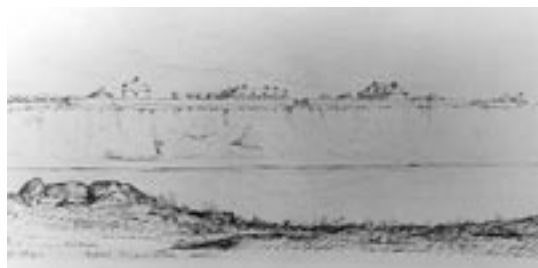
George F. Finlay sketch of Lower Fort Garry 1847

By the 1860s and 1870s, the volume of goods travelling over American routes increased and Lower Fort Garry became a depot and supply point for northern destinations. Brigades were now organized and provisioned at Lower Fort Garry rather than at Norway House or York Factory. By 1872, steamboats operating on the Red, Saskatchewan and Assiniboine Rivers replaced the Red River cart trains that travelled up from the south. With the arrival of the Canadian Pacific Railway in the 1880s near Upper Fort Garry, the steamboat routes became redundant.