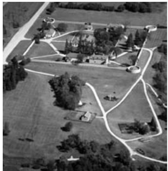
Lower Fort Garry

brought firewood to heat the barracks or gone to church services with the new recruits of the recently formed North-West Mounted Police.