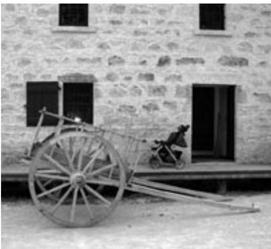
A Red River Cart

Lower Fort Garry is one of the finest collections of early stone buildings in Western Canada. Fur trade forts were typically made of wood and very few remain, but Lower Fort Garry's stone construction is one of the reasons it still exists.