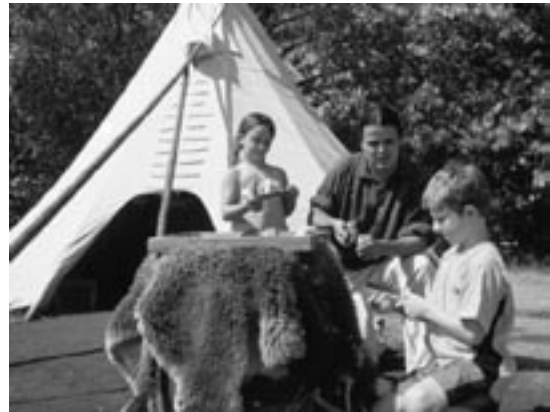
Interpreter with children

Lower Fort Garry’s role has been one of commemoration, presentation and education. To many First Nations people, the commemoration of the making of Treaty One has spiritual significance. To other Canadians, it is important to build an understanding that we are all part of the treaty. Operationally, it requires Parks Canada to carefully consider options to current programming to meet the needs of all visitors, and to address the issues created by our entrance fees on this annual special anniversary.