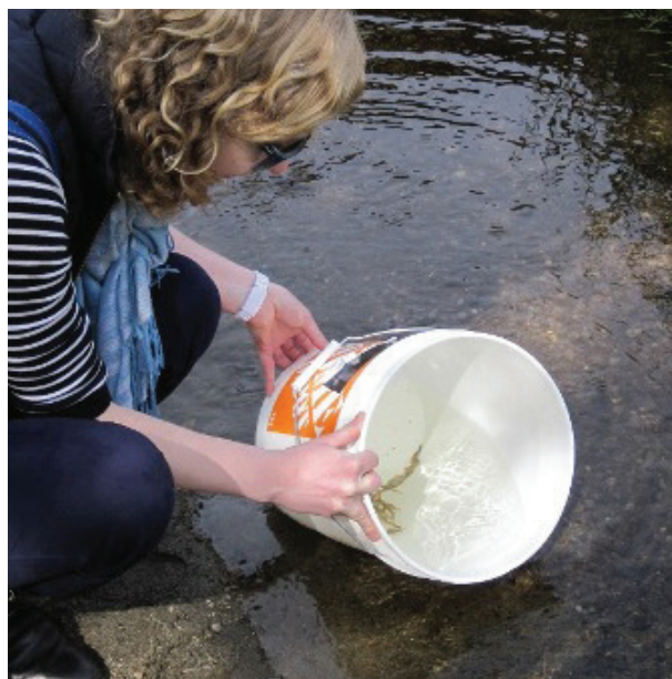
Last year's salmon fry release