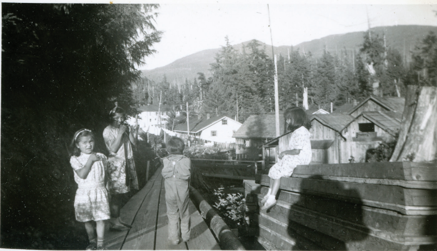
The First Nations village closest to Namu. There were no roads – only trails and boardwalks. G2014.007.038