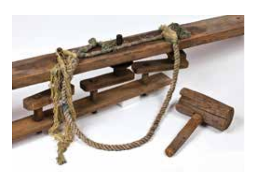
Rope making machine