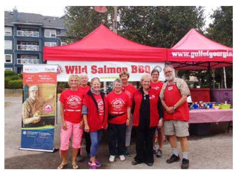
Some of the fantastic Cannery Crew volunteers who helped with the Salmon BBQ at the Richmond Maritime Festival.

Proceeds from both events will help support next year's "Salmon and Cod" project in celebration of Canada's 150th birthday.