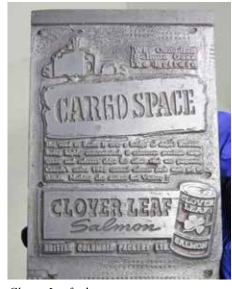
Clover Leaf ad stamp