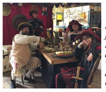
Left: The jolly Shady Isle Pirates at Pirate Weekend at the Cannery.