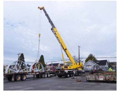
The Triumph Ice Machine is lifted by crane into its new location.

Displaying this machine here not only helps to draw attention to our site from passersby, it also allows us to provide people with a better understanding of this machine and how refrigeration revolutionized the fishing industry.