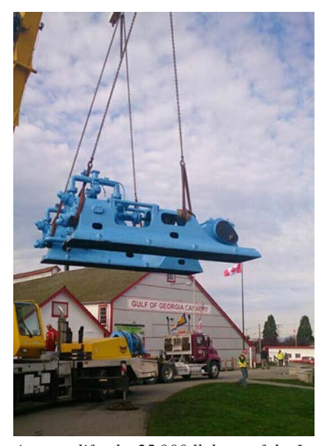
A crane lifts the 25,000 lb base of the Ice Machine onto a flatbed truck

The Triumph Ice Machine has a new home! That's right – this poor, often misunderstood artifact that sat in pieces slowly rusting away in the chicken-coop-like shelter behind the Stinkeroo for many years has been fixed up and installed in the north-west corner of our parking lot.