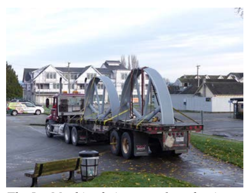
The Ice Machine being transferred to its new location.

Displaying this machine here not only helps to draw attention to our site from passersby, it also allows us to provide people with a better understanding of this machine and how refrigeration revolutionized the fishing industry.