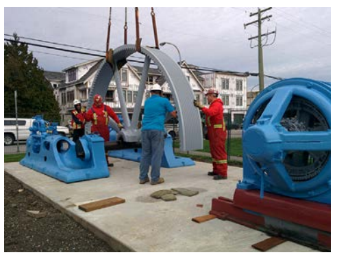
One-half of the flywheel is set in place in the Ice Machine's new location in the parking lot.

This Triumph Ice Machine is one of two ammonia compressor units that were installed at the Canadian Fishing Company's Home Plant in Vancouver in 1910.