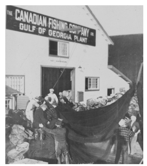
Workers bring in a large seine net at the Gulf of Georgia Cannery in the 1940's.