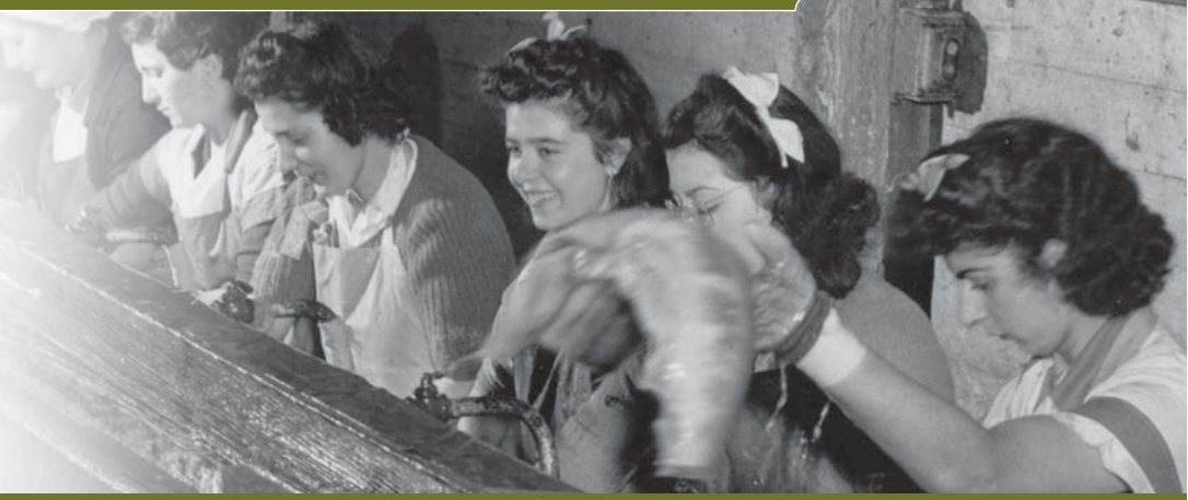
SUMMER ISSUE | VOLUME 22, NO. 2 JUNE 2017