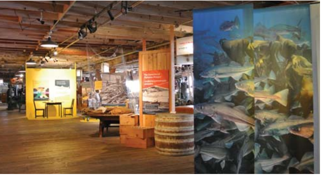
"The Pull of the Net" exhibit opened May 6th

September 23rd Fisher Poets Afternoon: A crew of current and retired commercial fishers will share