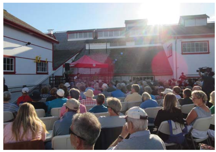
"Cannery Row" on the Tank Deck in summer 2016.

Join us for another season of Music at the Cannery! This year, we are bringing back past favourites of our series and adding new and exciting musicians to our lineup.