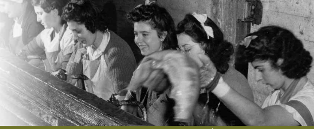
FALL ISSUE | VOLUME 22, NO. 3 SEPTEMBER 2017