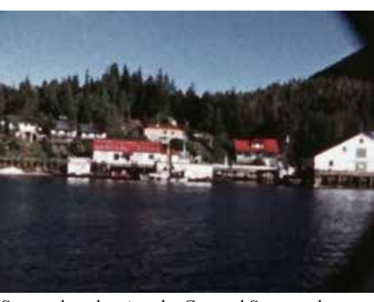
Screenshot showing the General Store and surrounding buildings at BC Packers Bella Bella plant.

we had not been able to view them. However, thanks to a bit of extra funds, we have finally been able to digitize these valuable records of the industry and share them with you.