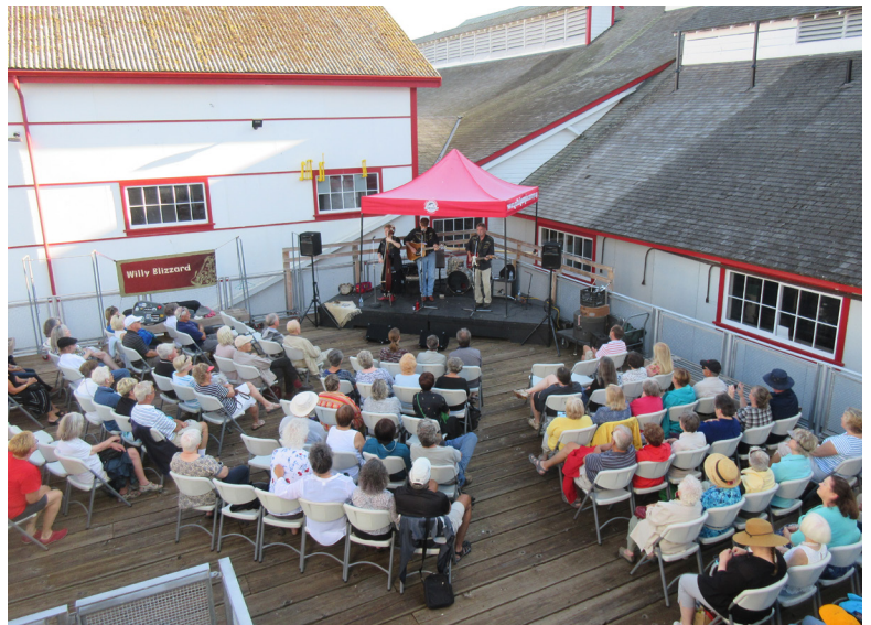
Performances will be held rain or shine, outdoors on typical sunny Steveston evenings, and indoors if rain.

Each concert will begin at 7pm, with doors open at 6:30pm. Tickets are $7, available at the door. Be sure to arrive early to secure your seat!