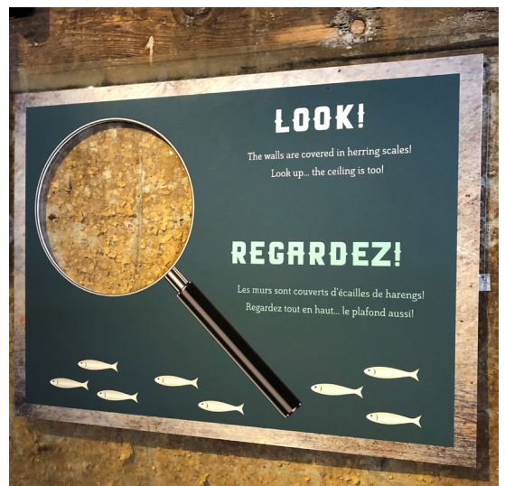
A fun, new addition to the exhibit is this panel bringing attention to the herring scales still attached to the plant's walls and ceiling.