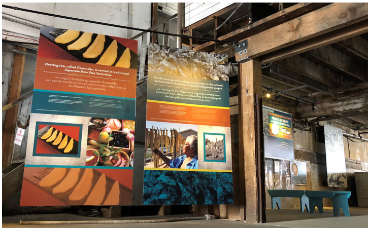
Large, bright new panels are now displayed in the entryway to the Herring Reduction Plant, featuring a description of BC's herring fishery timeline, and some of the products of the fishery.