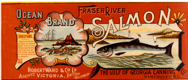
Ocean Brand Salmon label, produced for the Gulf of Georgia Canning Co. during the first year of operation in 1894, G2001.038red.

Did you know - 2019 will mark the 125-year "Canniversary" of the building of the Gulf of Georgia Cannery, built in 1894. Keep an eye on our website, this newsletter, and our social media throughout 2019 to see how we will be celebrating this important Cannery milestone!