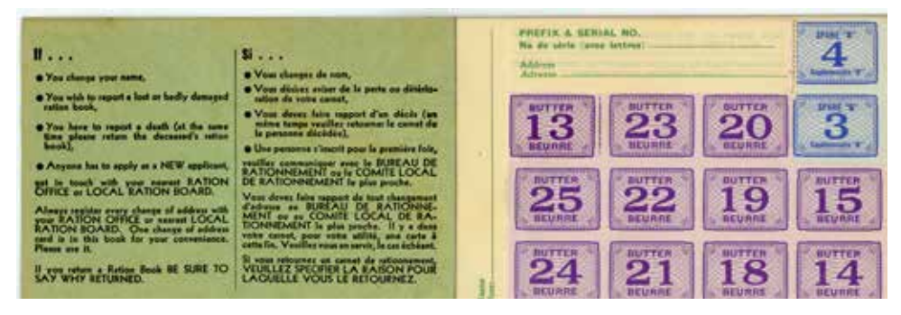
Inside Ration Book 2 – showing some coupons for butter.