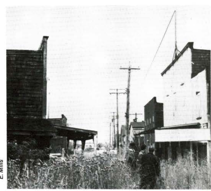
Figure 8. Former Chinese shops on Steveston dike as seen in 1974. This group was demolished several years ago.

All three structures are slated for demolition as part of the current program to upgrade fleet facilities in the area. While this program is simply the latest phase in the continual process of change to meet the needs of the fishing industry, it promises a major physical transformation for the Steveston waterfront, including construction of new moorage ponds and extensive commercial and residential development on property adjacent to Cannery Row. The first major