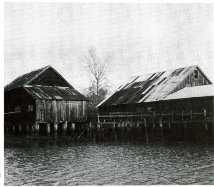
Figure 9. Japanese fishermen's house (left) and Chinese Bunkhouse (right) surviving remnants of the former dike community, 1984.

casualties will be the smaller subsidiary buildings erected by early Japanese and Chinese workers. While the survival of the Gulf of Georgia cannery seems assured, the long-term prospects for other early canneries is less certain. It is with a sense of urgency that Parks Canada historians are attempting to document the histories of these buildings and their former occupants through interviews with long-time members of the Steveston fishing community who have witnessed the evolution of the waterfront over the past five decades.