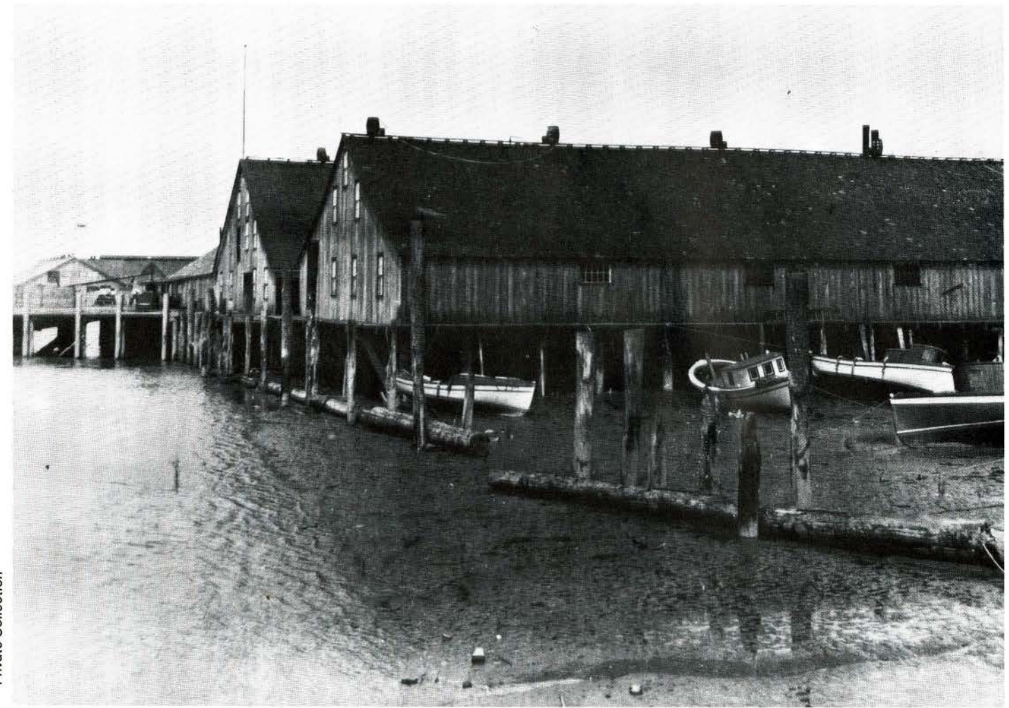
Figure 7. The Britannia Cannery and its adjacent net loft, as they appeared before 1918. The net loft was destroyed by fire in 1918, and the Britannia was later converted into a boat building facility.

Further upstream is the 1895, Colonial Cannery which also closed in 1917, but was subsequently converted into a saltery, and later into a net loft. This building was incorporated into the large Paramount Cannery complex during the 1950s, but remainted structurally intact.