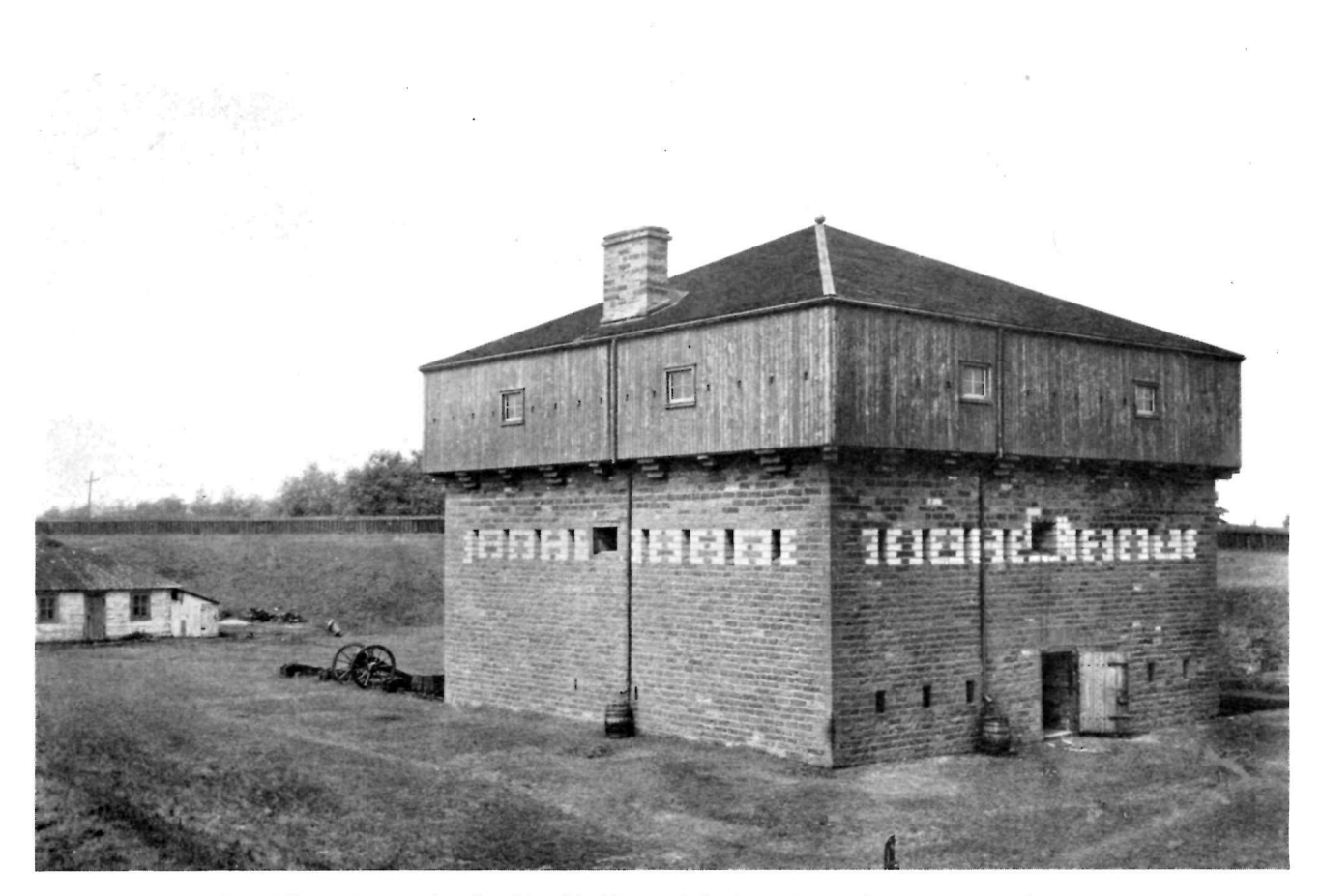
Fort Wellington, Prescott, Ontario.-The original fort was built of wood, in 1813; it was reconstructed in 1837-38.