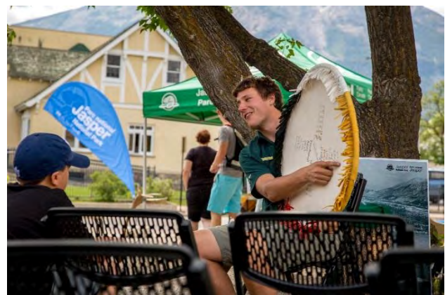
The Medicine Wheel Program was one of many interpretive programs offered at Jasper's Heritage Fire Hall.