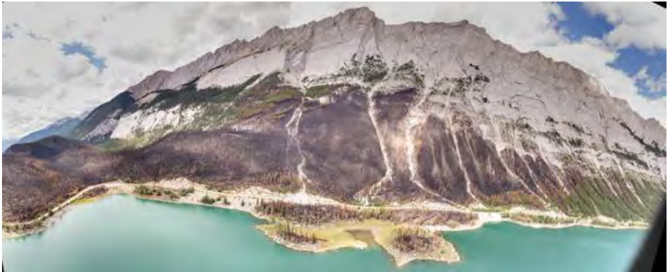
The landscape at Medicine Lake has changed dramatically following the Excelsior Fire.