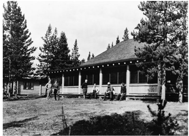
The Maligne Lake Chalet's peeled log construction and exposed log detailing is characteristic of early park architecture.

A new National Historic Site, the Maligne Lake Chalet and Guest House, was designated by the Historic Sites and Monuments Board of Canada in March 2015. Constructed between 1935 and 1942, these buildings are all that remain of well-known outfitter and guide Fred Brewster's camp on the shores of Maligne Lake. They illustrate the prominent role played by outfitters, guides, and railways in the development of tourism in the mountain national parks.