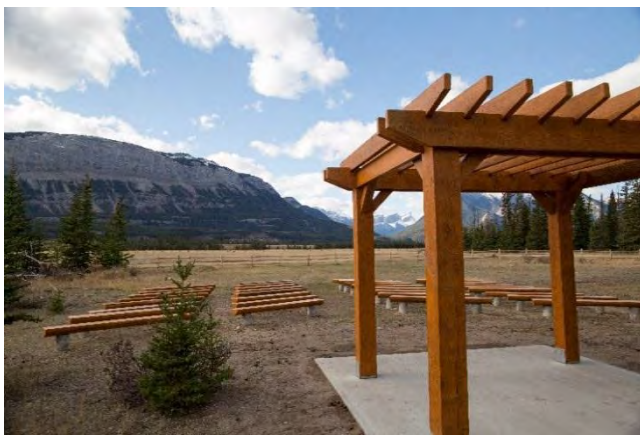
Upgrades to picnicking and special event sites at Pyramid Beach and Island and the Athabasca Day Use Area have been well-received.