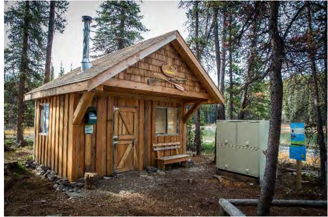
Hidden Cove Campground was fully booked this summer.

Some projects are currently underway and others will be carried out over the next three to five years. As part of the implementation of this program, work will be required to communicate delays and access changes to visitors and residents, carry out environmental impact analyses and project surveillance, review technical plans and designs, and address other project requirements (e.g. prepare a long-term gravel extraction plan for paving and other roadway maintenance).