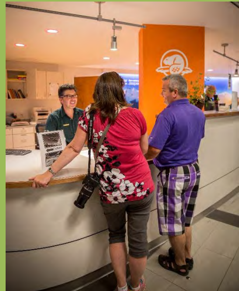
Parks Canada's information desk at the Icefield Centre re-opened this spring following renovations.

The 107 km of highway paving completed in 2015, represents the first phase of a multi-year infrastructure renewal plan for the Parkway that is already enhancing visitor experiences.