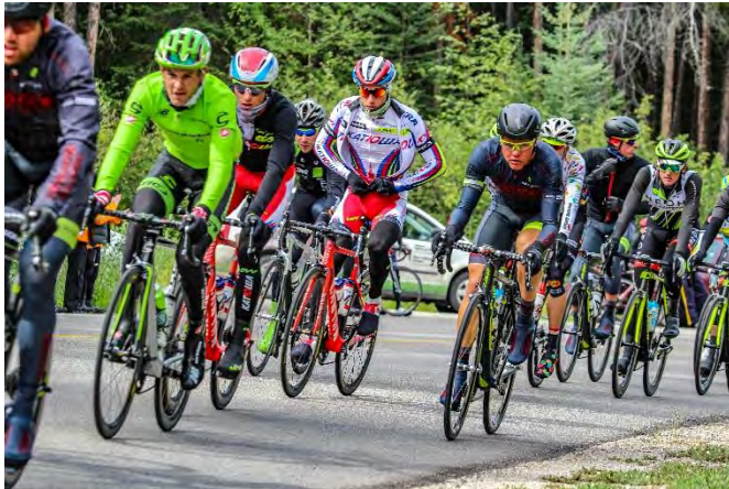
The Tour of Alberta in progress.

The increasing popularity of road cycling has prompted new product development (e.g. a new road cycling brochure) and three new events.