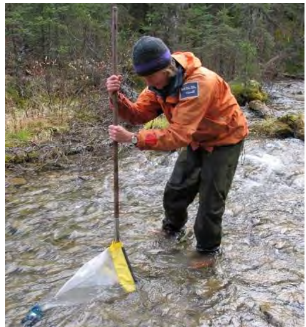
Kick-sampling is used to stir up the rocky stream bottom, so that aquatic invertebrates are carried downstream into a waiting net.

We report on our monitoring results in the State of the Park Assessment every 10 years. This assessment informs park management planning activities. The next assessment is planned for 2018.