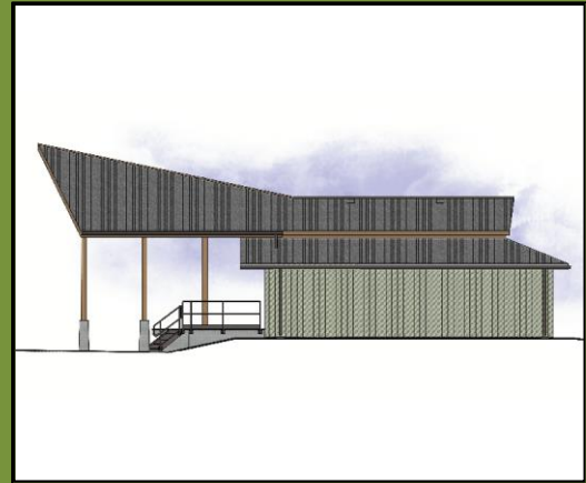
A side profile of the new amphitheatre Parks Canada is building at Whistlers Campground, ready for the 2017 camping season.

In late August, Parks Canada commenced construction of a new amphitheatre in Whistlers Campground to replace the original theatre that was built in 1969. Jasper National Park's interpretation team has been performing interactive programming at the Whistlers Campground amphitheatre for many years. Although well-loved and heavily used, the old amphitheatre provided limited storage space and indoor programming space, and was at the end of its expected life span. In the fall, the building was removed due to the poor condition of its foundation, and construction commenced on the new theatre, which will be nearly twice the size of the original one. The new amphitheatre will be fully operational for the 2017 camping season and ready for Canada's 150 th anniversary celebrations.