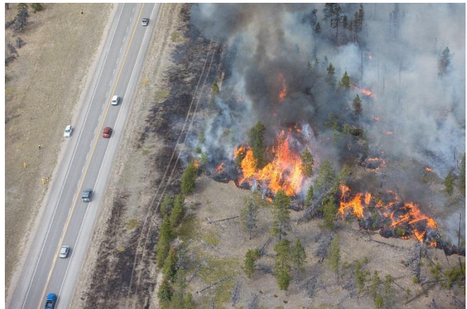
The April 17 2016 prescribed burn at Jackladder Complex, 14 kilometres north of Jasper along Highway 16.

Further to the 111 hectare prescribed burn in the Jackladder Complex in 2015, Parks Canada carried out a second prescribed burn of 102 hectares in April with the objective to restore the open grasslands that were historically present in the area.