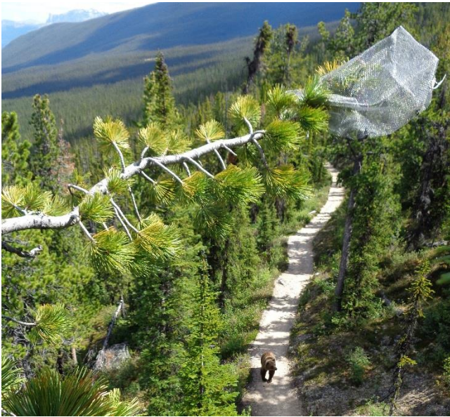
A curious onlooker inspects the caging of whitebark pine cones along the Astoria Trail.

Over the course of 2016, Parks Canada continued to take action to restore whitebark pine in Jasper National Park. Six hundred seedlings from whitebark pine seeds collected in the park celebrated their 1 st birthday in the nursery and will be ready for planting in Fall 2017. Parks Canada continued to cage whitebark pine cones from trees that appear to be resistant to white pine blister rust disease.