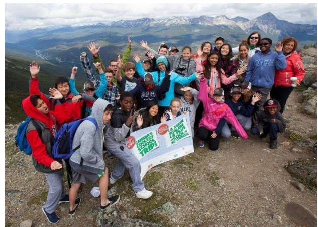
Canada’s Coolest School Trip winners celebrate on top of the Rocky Mountains.

Numerous urban outreach events were held this year using the new “What’s The Connection?” mobile exhibit to reach audiences at the Telus World of Science in Vancouver and Edmonton and at the Calgary Zoo about the importance of caribou, whitebark pine and fire management.