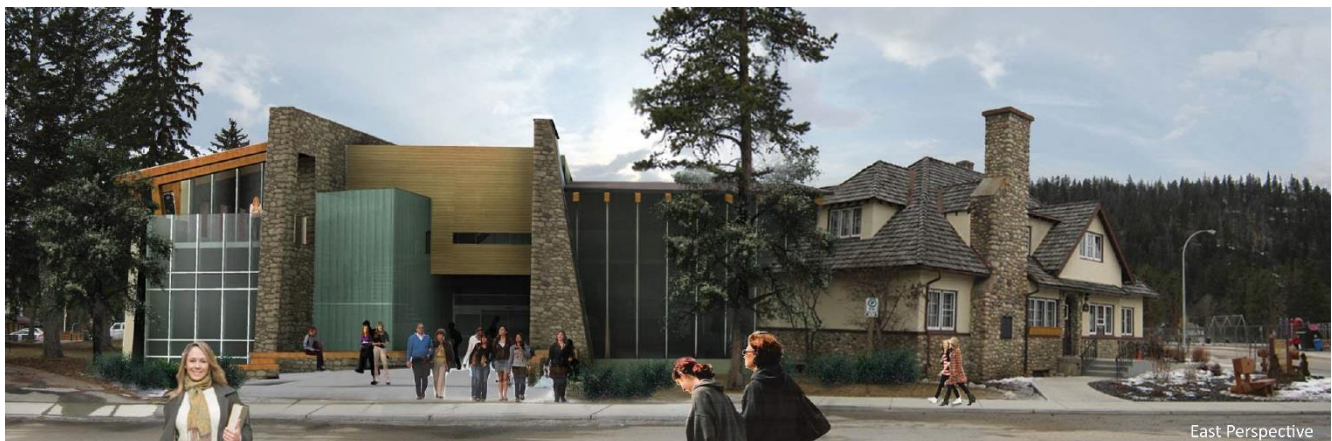
The new Jasper Library and Cultural Centre provides a dynamic space for arts and culture in the community.