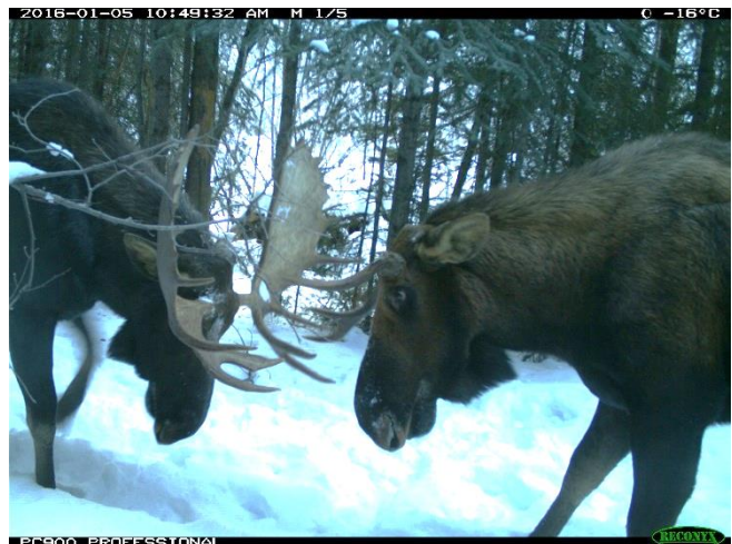
Two adult male moose are captured interacting in front of a remote camera installed at Whirlpool Valley.