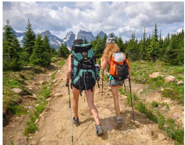
The Tonquin Valley offers expansive forests, a variety of wildlife, stunning alpine valleys and towering peaks.

From street theatre to guided walks, interpreters delivered many programs in support of the park's species at risk commitments. The "Sweet Nutcracker" street theatre raised awareness of whitebark pine with over 50 summertime performances at the Heritage Fire Hall. The Fire Hall was also home to a Species at Risk display. During the fall, Park