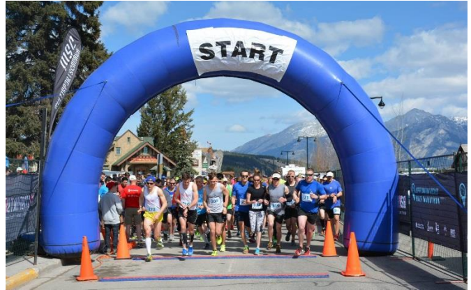
On your mark, get set, go! The Jasper Canadian Rockies Half Marathon also hosted 5km, 10km and Family Fun runs.

Parks Canada continued to offer a wide range of engaging and educational interpretive activities in the park over the year, including the diverse