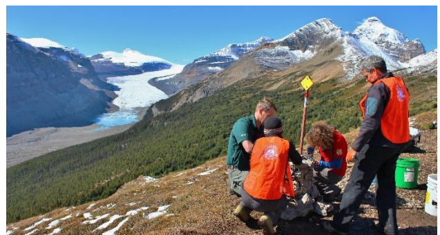
Banff and Jasper volunteers undertake trail maintenance at Parker Ridge, Banff National Park.