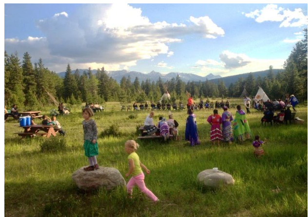
The Indigenous Cultural Area provides a natural setting for Indigenous communities with historic ties to the park to learn, reconnect and share stories.

Progress was made on the restoration of the Jasper Indigenous Cultural Area, located on the Maligne River, with the removal of buildings and concrete ponds associated with the former fish hatchery headquarters located on the property. We are continuing final restoration of this site and working with our Indigenous partners to identify how this site will support reconnection and traditional practices in Jasper National Park.