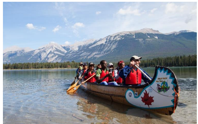
The August 2016 Learn to Camp Program provided participants with an incredible three days of camping, story-telling, hiking at Pyramid Island, and paddling Lake Edith in a voyageur canoe.