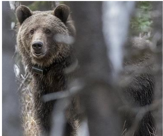
Parks Canada will use the grizzly bear data for land use planning and to help manage human-wildlife conflict.

While some conditions for caribou survival and recovery are improving, with winter wolf access to caribou habitat reduced as a result of delayed access provisions and low wolf density, all herds remain relatively small. Monitoring of caribou populations in Jasper National Park suggests that caribou herd numbers are similar to last year. Through the results of DNA analyses and visual surveys, the Tonquin herd is estimated at 30-34 individuals, the Brazeau herd at 10-15 individuals, and the Maligne herd at 3 individuals.