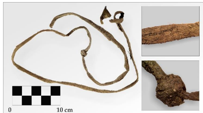
An approximately 270 year old leather strap was discovered in 2015 during snowpatch archaeological investigations, likely dropped by a caribou hunter.

Archaeologists examined melting snowpatches that are used by caribou to find items that may have been dropped by caribou hunters. Based on a fruitful investigation in Summer 2015, which revealed an approximately 270 year old leather strap. Four locations were examined in August 2016; no items were recovered.