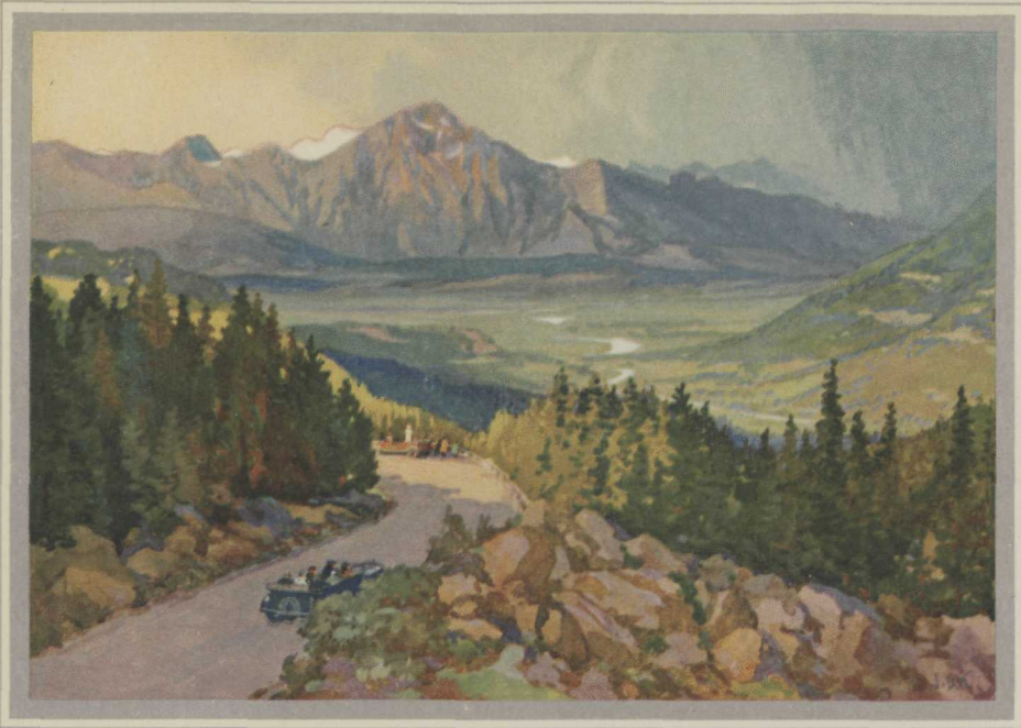
PYRAMID RANGE FROM THE DRIVE