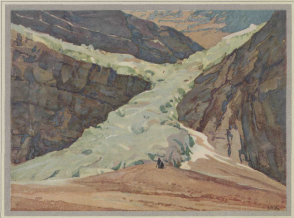
ANGEL GLACIER, MOUNT EDITH CAVELL