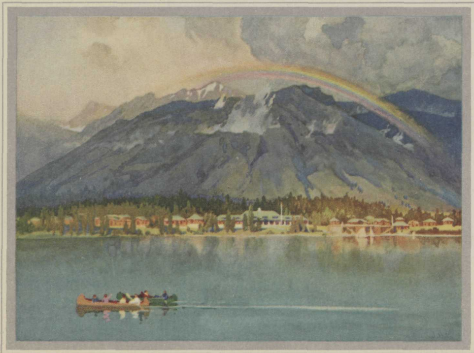
JASPER PARK LODGE AND OLD MAN MT.