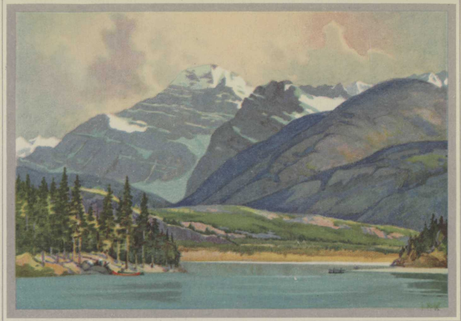
MT. EDITH CAVELL FROM JASPER PARK LODGE