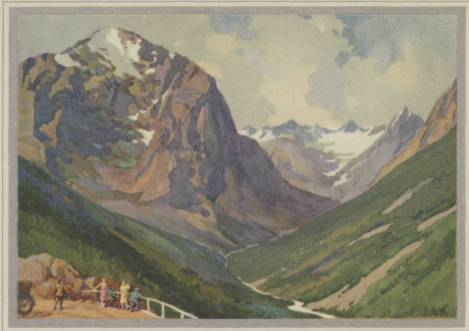
THRONE MT. AND GLACIERS FROM DRIVE