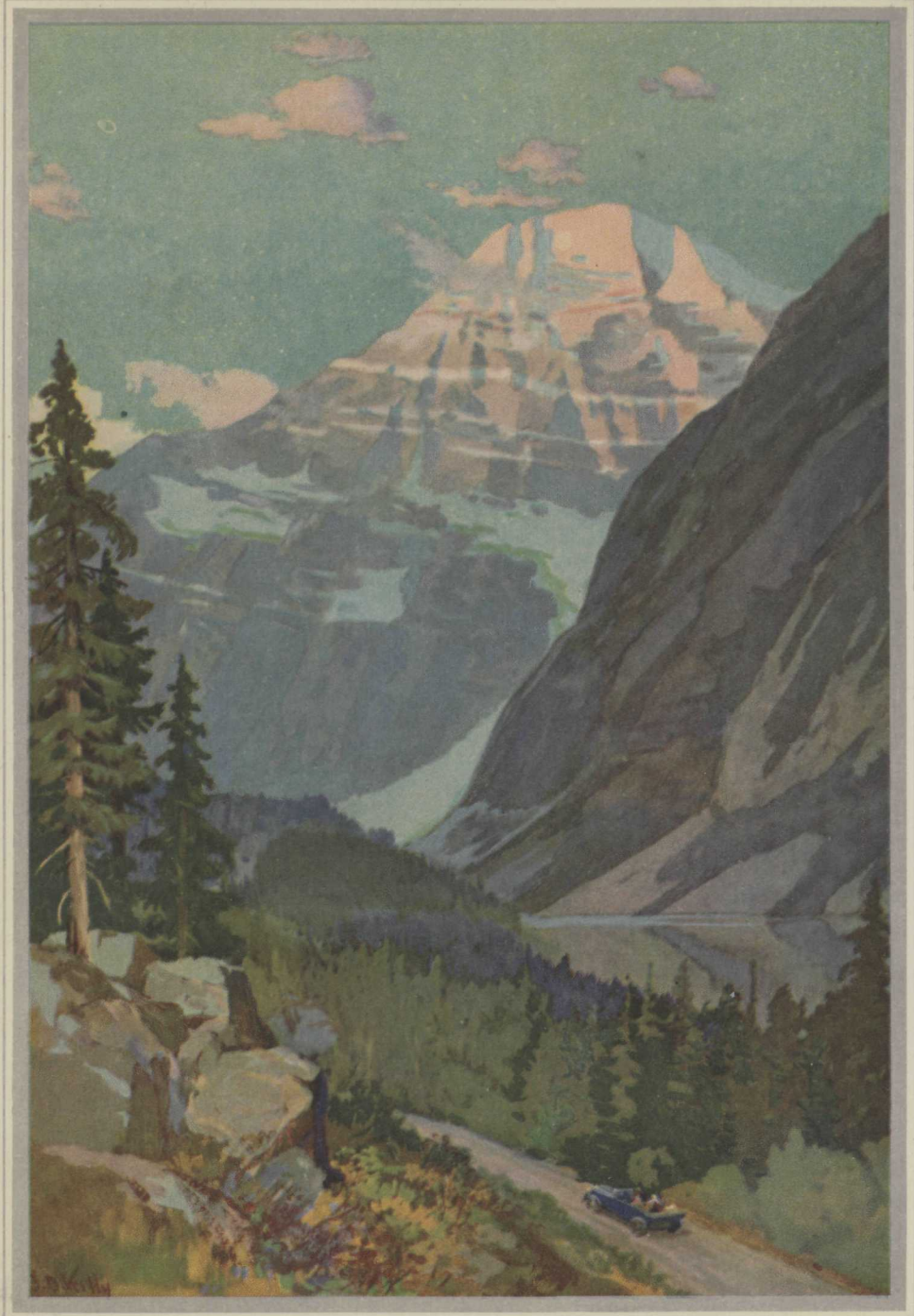
MOUNT EDITH CAVELL, ALTITUDE 11,033 FEET, QUEEN OF THE ROCKIES