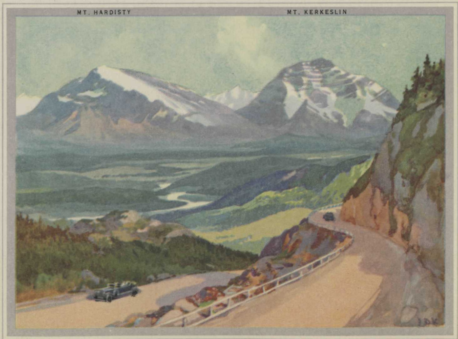
ATHABASKA VALLEY FROM THE DRIVE