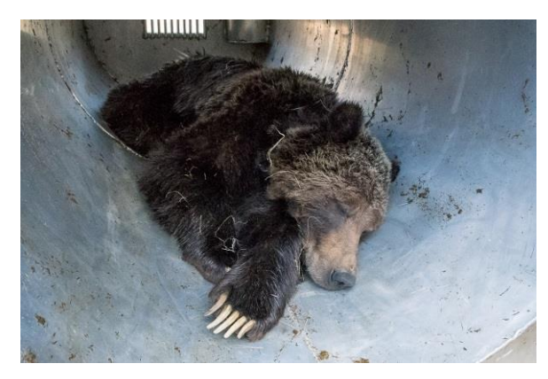
Figure 1. Sedated grizzly bear in a culvert trap. This bear was awaiting release in a safe location.

Trapping was mostly by culvert trapping, but some bears were darted and drugged from helicopters. One bear was free range darted under unusual conditions (i.e. no chance of people appearing, or potential for harm to the bear). The immobilization drugs used were a combination of medetomidine and telozol (MZT). Atepamezole was used as an antagonist. Trapping procedures satisfied both national park and Alberta safe handling protocols.