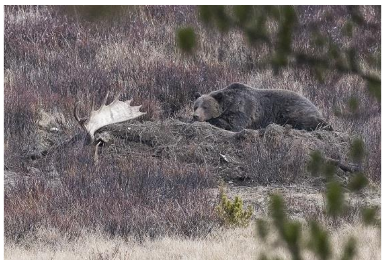
2016 Progress Report