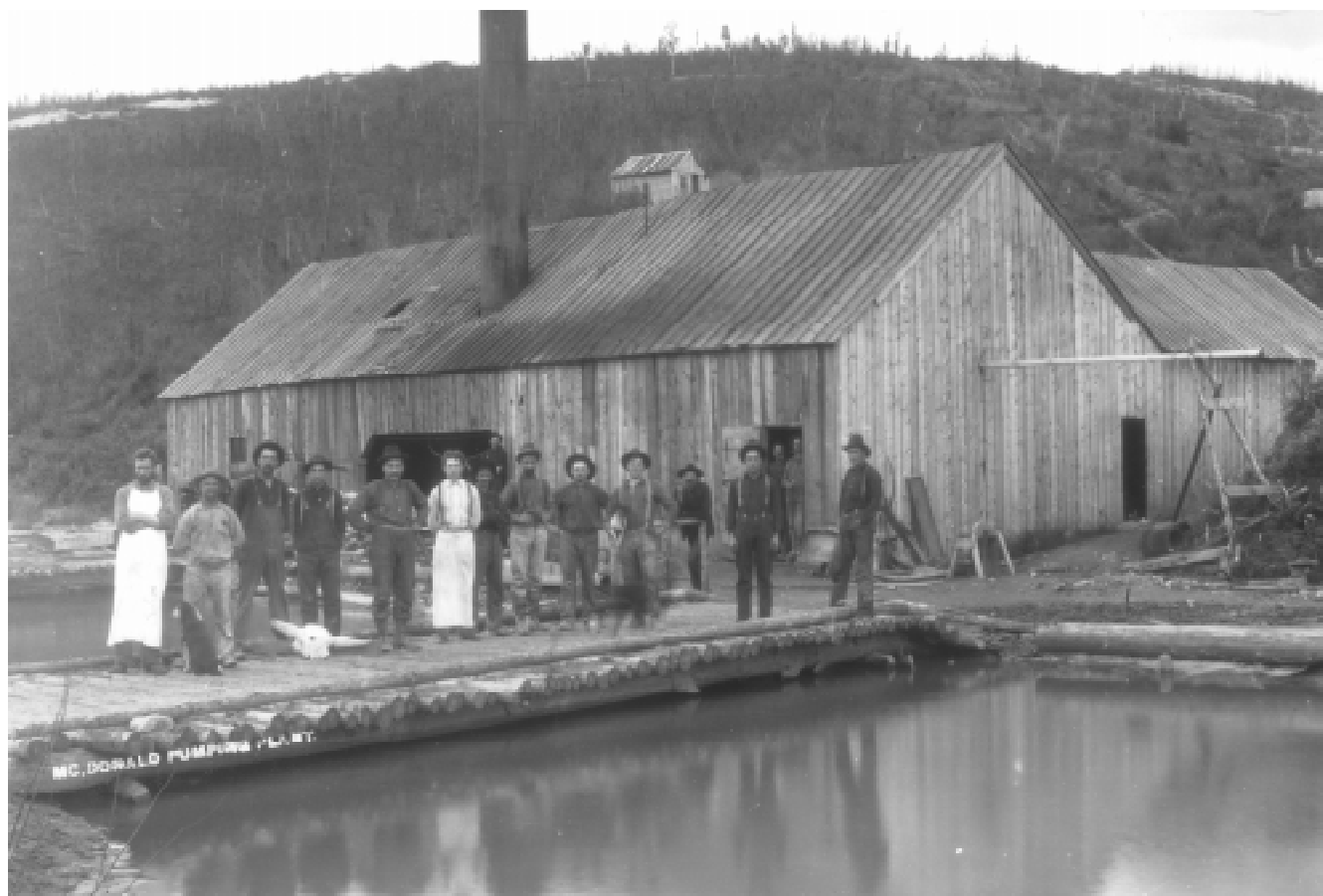
McDonald's Pumping Plant - PC A Johns YT-150

The regional water shortfall prompted the Klondike mining industry to promote several ideas to increase the local natural supply of water. One of the first of these projects was undertaken by Joseph and Ellen Acklin. 12 The Acklins had established a farm on the sunny north side of the Klondike River about three kilometres above Dawson. While raising vegetables and hay were profitable, the farming business was quickly abandoned when gold was discovered on the property. After hydraulic began