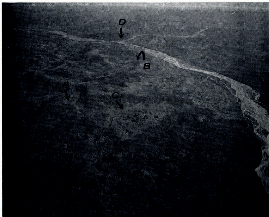
Fig. 3. Aerial view of the Klondike Plateau and White River Valley looking north-east from an altitude of 5,487 m. over the Wellesley Basin. A. Nisling Moraine; B. Nisling Moraine at mouth of Ten Mile Creek valley; C. Donjek Moraine; D. Junction of Donjek and White Rivers. (Photograph by U.S.A.F., 1941, R-24, R74)

streams from Beaver Creek, White River and Donjek River coalesced in a broad lobe which was confined against the south flank of the Klondike Plateau. The broad valley 16 km. west of Mount Dave was blocked by ice and the impounded drainage formed a lake, the level of which may have risen to an altitude of 762 m. (Fig. 2). A large ice tongue spread northward 3.5 km. beyond the mouth of Donjek River. The east-flowing tributaries of the White River were diverted westward into the Tanana drainage and large lakes were impounded in the