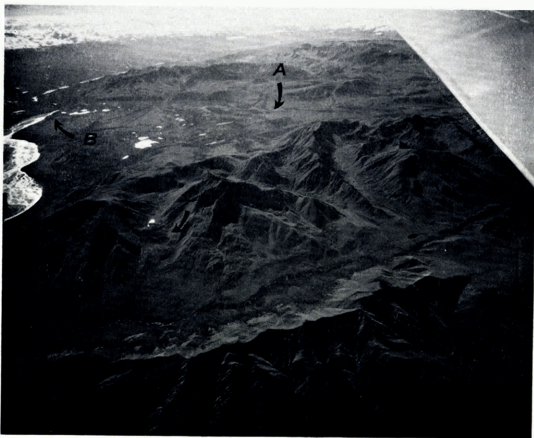
Fig. 5. Aerial view of Tchawusahmon Moraine, looking south-west from an altitude of 5,130 m. A. Front of Tchawusahmon (I) Moraine at Tchawusahmon Lake; B. Moraine from Russell Glacier at the mouth of upper White Canyon, equivalent to Tchawusahmon III; C. Post-Snag valley moraines and tarn lake (1,400 m.) 4.5 km. west of lower White Canyon. (Photograph by U.S.A.F., 1941, R-20, L64)

glacier was up-valley from the forest. This suggests that the front of Klutlan Glacier receded at least 10 km. behind its present position prior to its most recent advance. Sharp (1951, p. 105) made a similar observation in the Steele (Wolf) Creek valley and suggested that this recession may have coincided with the post-Wisconsin altithermal (xerothermic) period. McConnell (1906, p. 20) reported that in 1905 a ridge of fresh uncovered ice appeared to be overriding the ablation moraine in the upper central part of Klutlan Glacier.