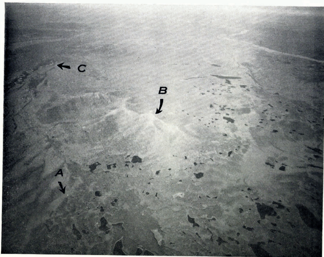
Fig. 4. Aerial view of the prominent front of the Snag Moraine east of Beaver Creek, looking north-east from an altitude of 5,334 m. A. Snag Moraine; B. Niggerhead Mountain; C. Beaver Creek.

Adjacent to Snag Road 15 km. south of Snag, an exposure of Snag till containing striated boulders up to 2 m. in cross-section and pebbles of granite, greenstone, hornblende-gneiss, amygdaloidal basalt, quartzite and andesite is mantled with 20 cm. of loess. The soil is oxidized to a depth of 25 cm. and permafrost is present locally 32 cm. below the ground surface.