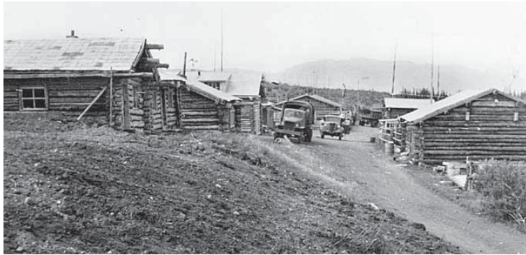
FIG. 3. VILLAGE OF BURWASH LANDING, 1942.

regulations now considered their harvest as an administrative method of reducing the cash costs of relief. This change in attitude allowed the expansion of trapping, big game outfitting, and the development of a fur farming industry, each taking a growing piece out of subsistence hunting by the 1940s. With the revival of mining into the 1930s, Aboriginal subsistence lifeways were further limited.