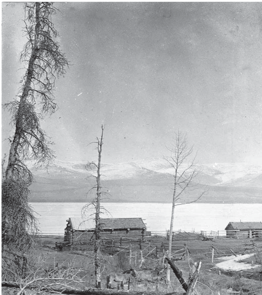
FIG. 2. JACQUOT TRADING POST ON KLUANE LAKE, 1922. [YUKON ARCHIVES, CLAUDE AND MARY TIDD FONDS, #7206.]