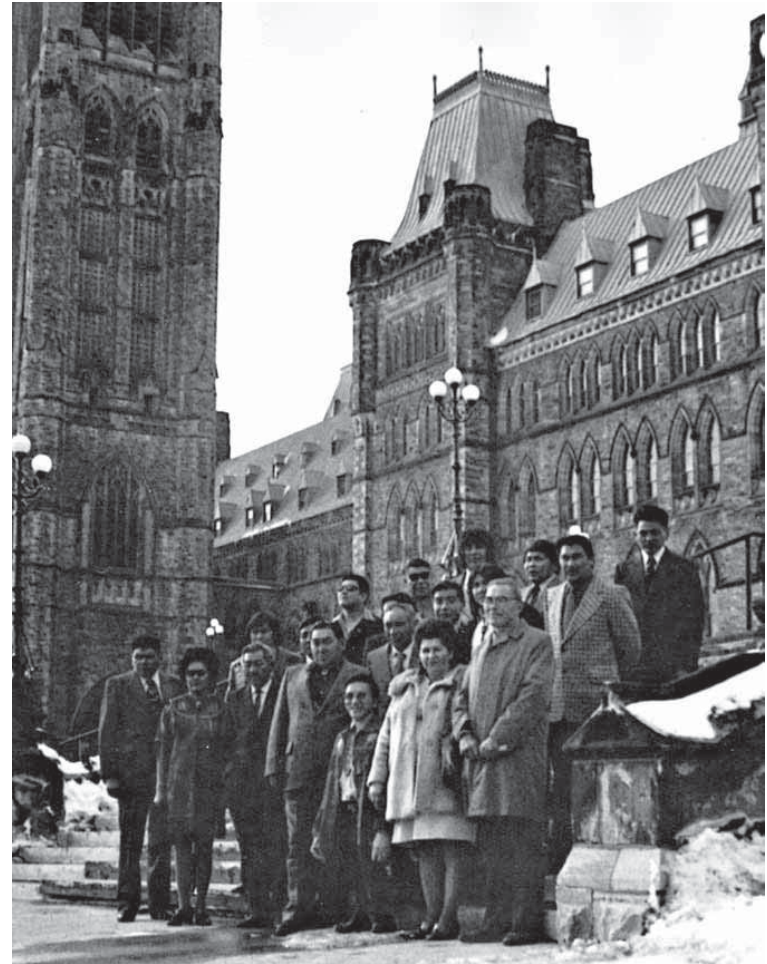
FIG. 9. THE YUKON FIRST NATION LEADERS WHO TRAVELLED TO OTTAWA IN FEBRUARY, 1973 TO PRESENT TOGETHER TODAY FOR OUR CHILDREN TOMORROW TO PRIME MINISTER TRUDEAU.