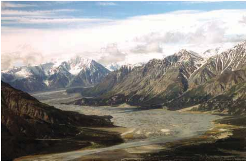
FIG. 1. THE MOUNTAIN VASTNESS OF KLUANE NATIONAL PARK AND RESERVE.

ness will be preserved in their natural state in perpetuity for the enjoyment of future generations of Canadians and indeed for all mankind.... [O]ne of my greatest satisfactions comes from the creation of 10 new national parks, the expansion of the area dedicated to national parks by almost 50 percent, and the extension of the National Parks system to every province and both territories. 2