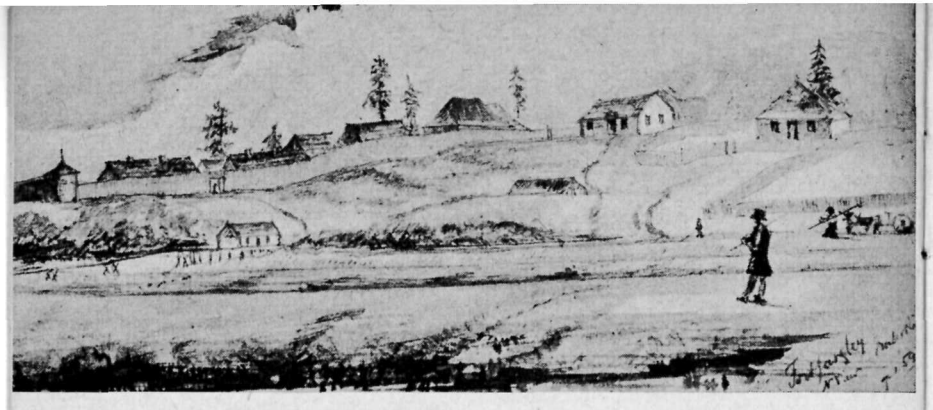
A sketch of Fort Langley from the north drawn by E. Mallandaine in 1859.