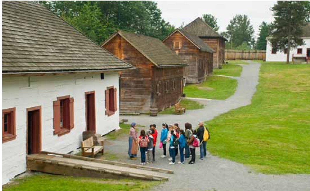
School field trip to Fort Langley NHSC