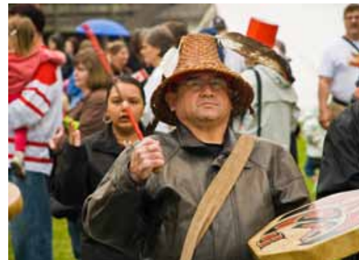
Kwantlen drummer leading the procession on Canada Day Parks Canada/T.Vipond 2010

In addition, this plan contains a five-year implementation strategy with targets and actions for each key strategy and area management approach. In all, this management plan is the primary reference document for decision-making and accountability for the site. A review of this plan will be conducted in ten years to ensure that it remains relevant and effective for the management of Fort Langley NHSC.