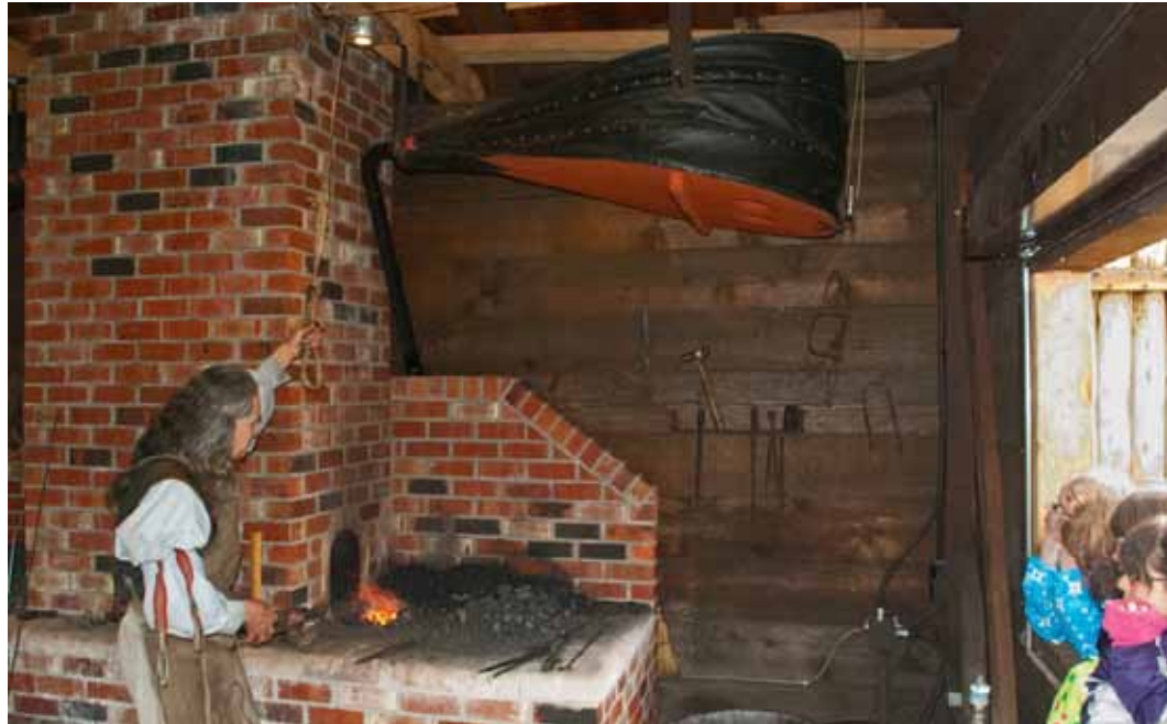
Demonstration at the Smith Shop Parks Canada 2011