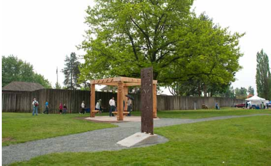
Outside the palisade