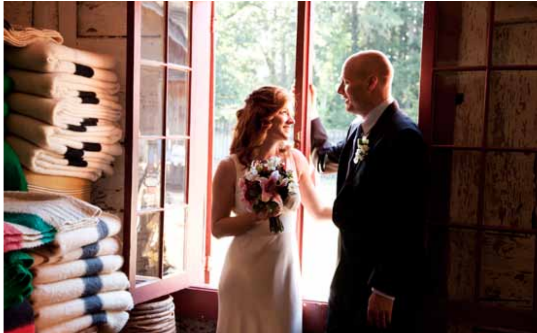
Wedding ceremony at Fort Langley NHSC