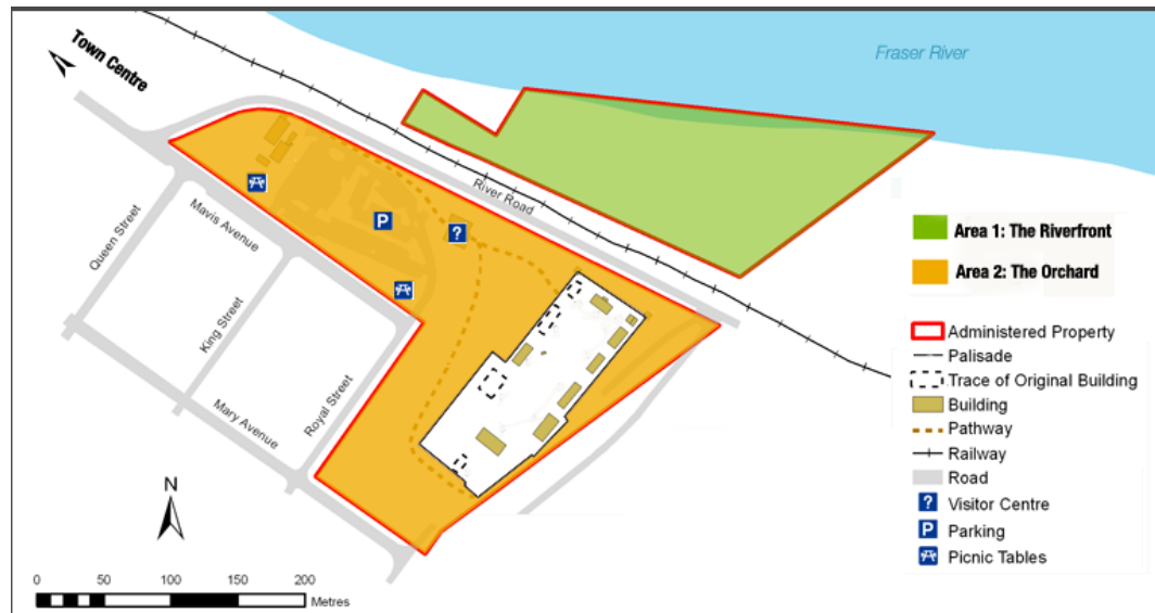
Figure 3: Map of Area Management Approaches