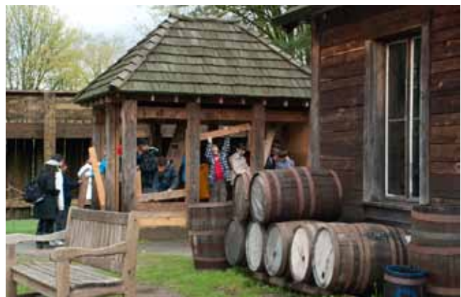
Parks Canada 2011