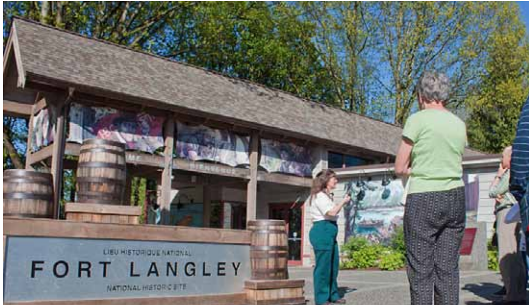
Visitors outside the visitor centre