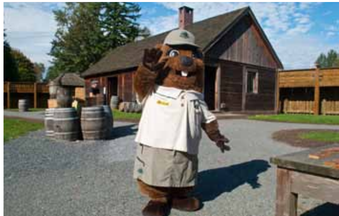
Parka at Fort Langley NHSC Parks Canada/N.Hildebrand 2011

This section expands on the objectives outlined in the preceding sections with a five-year implementation strategy. Outlined below are the objectives and accountability for targets and actions for each of the key strategies and area management approaches.