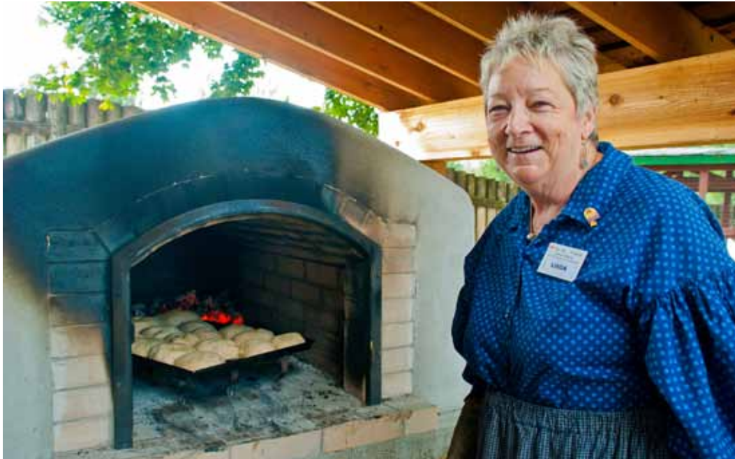
Volunteer of Fort Langley NHSC