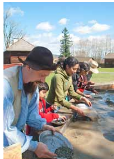
Gold panning Parks Canada/N. Hildebrand 2011