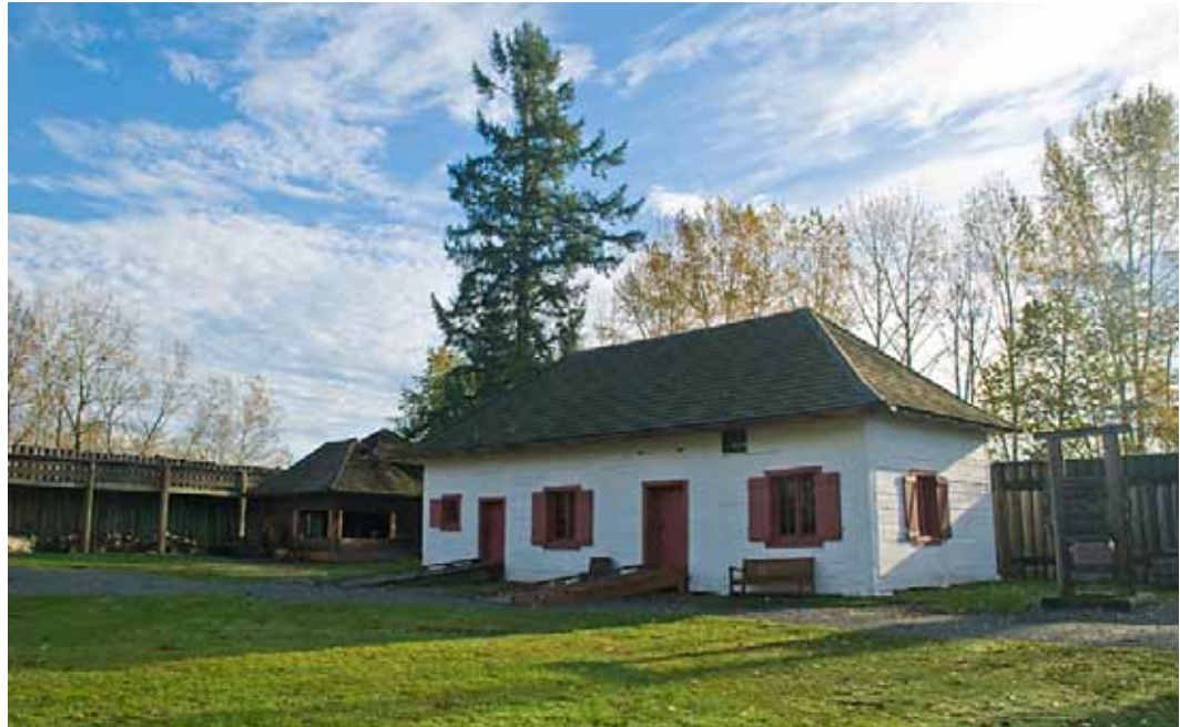
The Storehouse