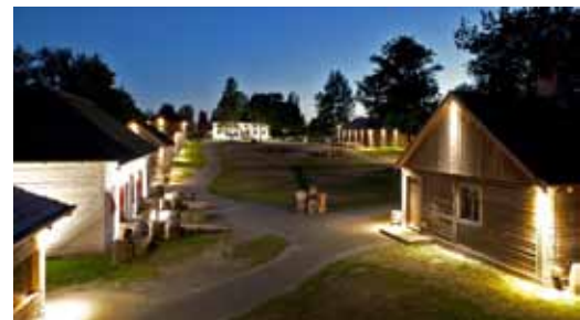
Fort Langley NHSC at night Parks Canada/B.Matheson 2011

during the management planning process. Appropriate strategies are identified to avoid or reduce potential negative effects of management that could arise through individual initiatives or as a result of cumulative effects. The direction outlined in the plan strategies, combined with project-level environmental assessments prior to project commencement, will ensure that management plan implementation will not likely result in any significant adverse cumulative effects. For those initiatives that trigger the CEAA, the impacts of proposed projects will be assessed prior to Parks Canada deciding on a course of action to approve or not approve the project. In conclusion, implementation of the strategies and actions in the management plan is expected to achieve the desired results for commemorative integrity, visitor experience, and public education at Fort Langley NHSC.