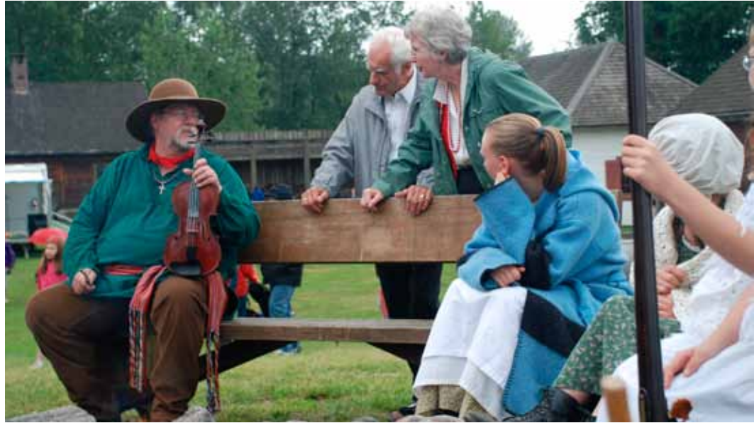
Parks Canada/N. Hildebrand 2010