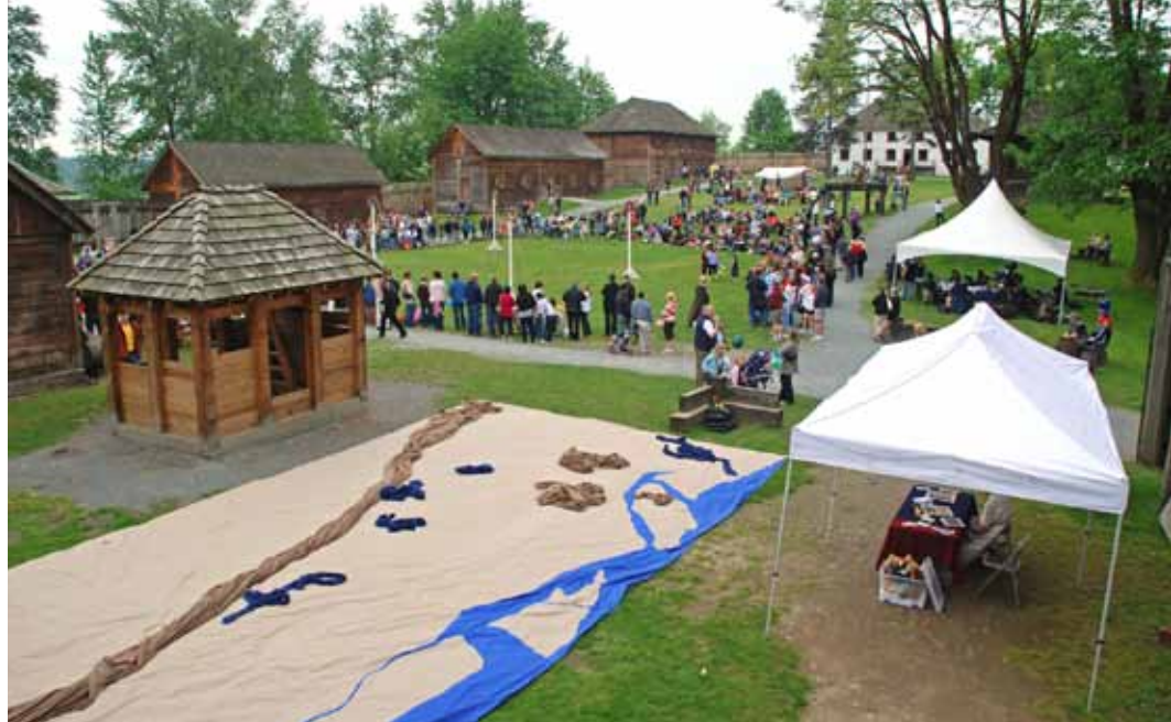
May Day at Fort Langley NHSC Parks Canada/N. Hildebrand 2008