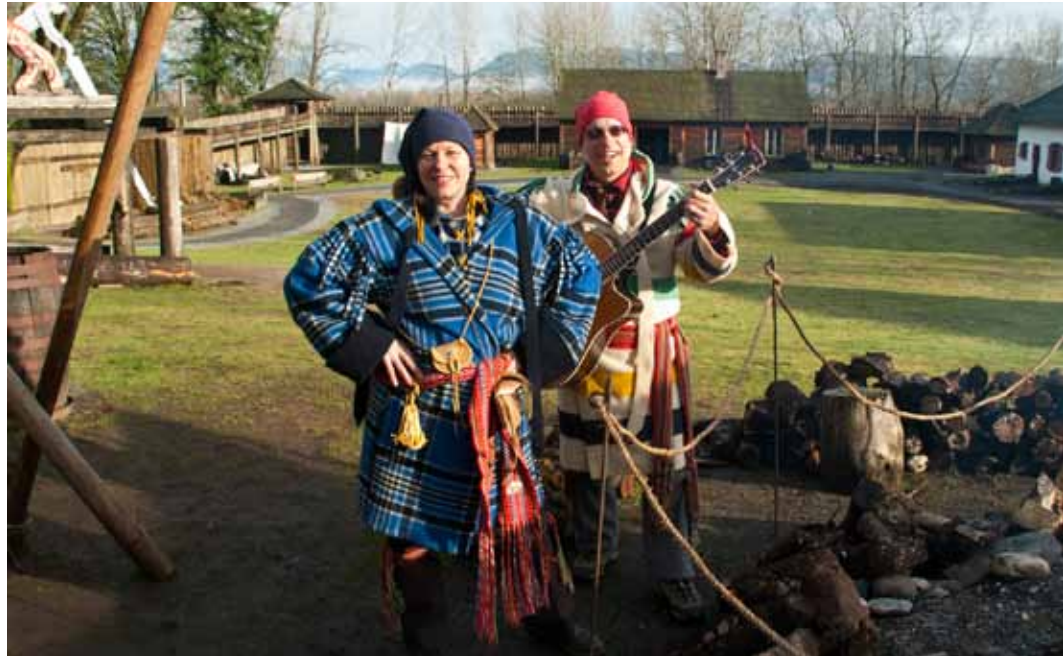
Vives les Voyageurs