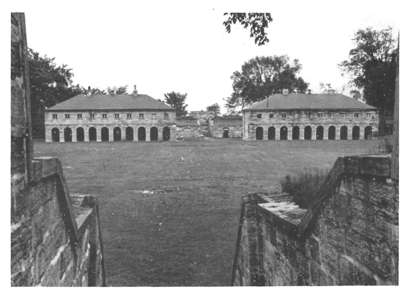
Fort Lennox National Historic Park